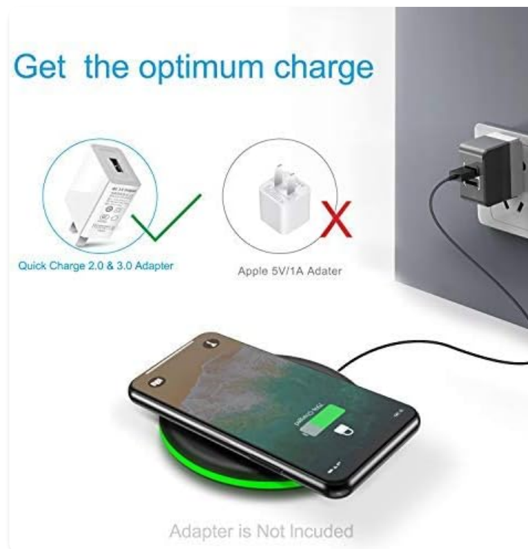
Image: Illustration showing the correct connection of the wireless charging pad to a Quick Charge 2.0 & 3.0 adapter (indicated by a green checkmark) and an incorrect connection to an Apple 5V/1A adapter (indicated by a red X).