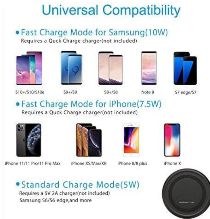
Image: Diagram illustrating the universal compatibility of the charging pad, showing different charging modes (10W for Samsung, 7.5W for iPhone, 5W for other Qi devices) and compatible phone models.