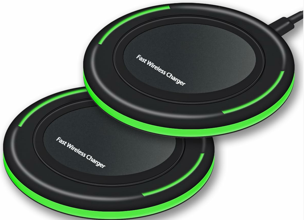
Image: Olahomo 10W Qi Fast Wireless Charging Pad, a sleek black circular pad with a USB-C port.