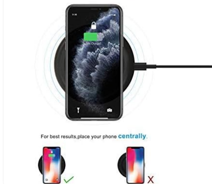
Image: Diagram showing a phone placed centrally on the charging pad for optimal charging, with an incorrect off-center placement marked with an X.