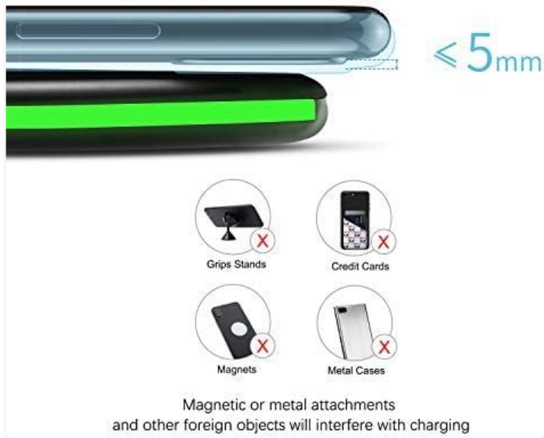
Image: Illustration showing a phone with a case less than 5mm thick being charged. It also highlights items that can interfere with charging, such as grips, credit cards, magnets, and metal cases.