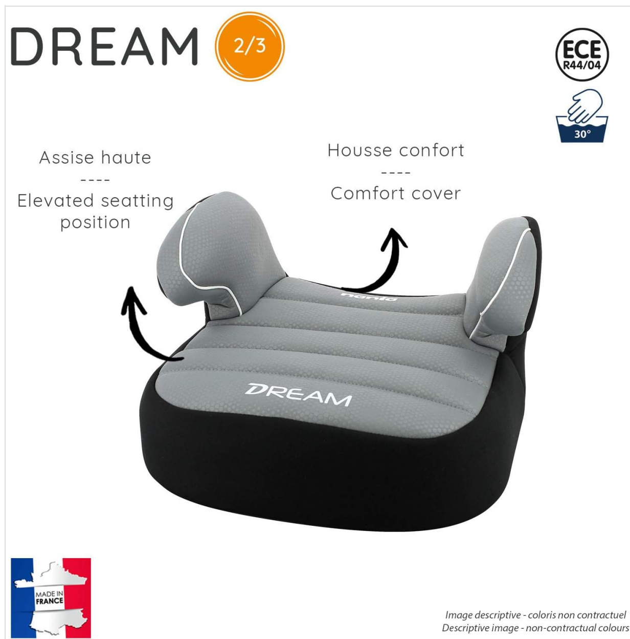
Figure 4: The comfort cover of the Nania Dream booster seat is designed for easy removal and cleaning, indicated by the 30° wash symbol.