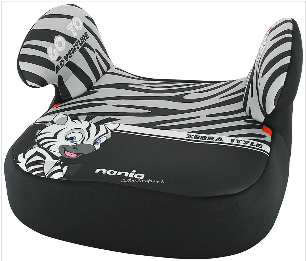
Figure 1: Front view of the Nania Dream Group 2/3 Adventure Zebra Car Booster Seat. It features a black and grey zebra pattern with the "nania adventure" logo and "ZEBRA STYLE" text.

The Nania Dream booster seat consists of a sturdy base with integrated armrests and a comfortable, padded cover. The design includes specific guides for the vehicle's 3-point seat belt.