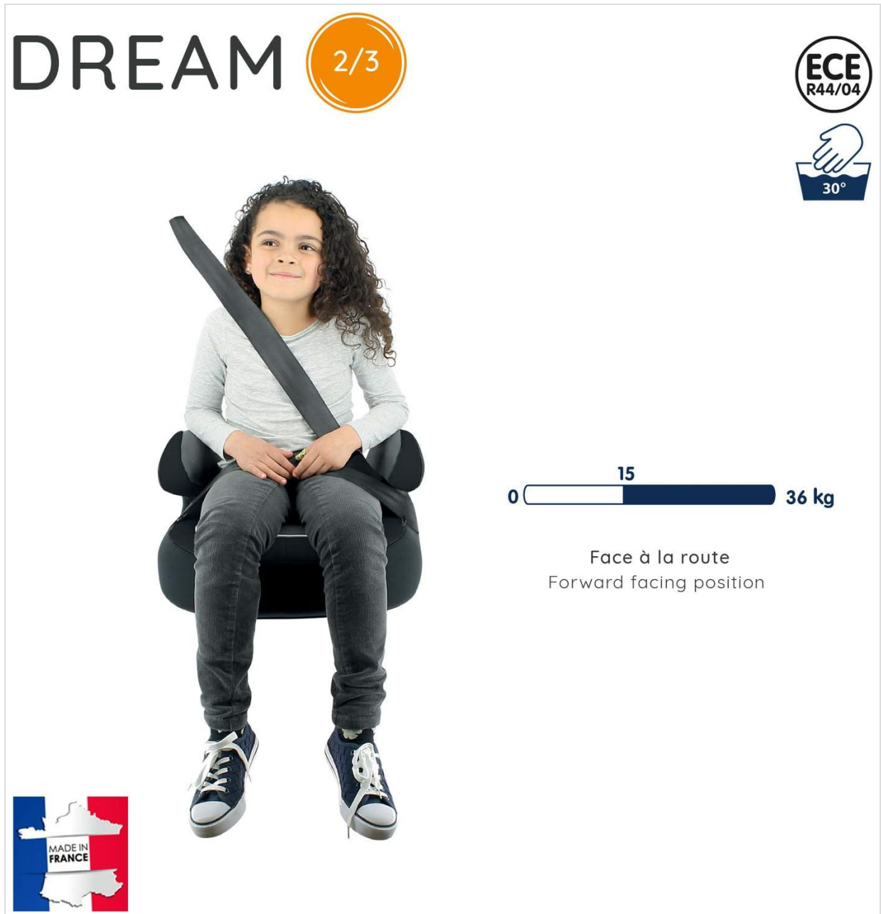
Figure 3: A child correctly secured in the Nania Dream booster seat using a vehicle's 3-point seat belt. The image illustrates the forward-facing position and proper belt placement.

The booster seat relies on the vehicle's seat belt to secure both the child and the booster seat itself.