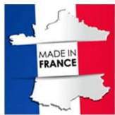
Image descriptive - coloris non contractuel Descriptive image - non-contractual colours