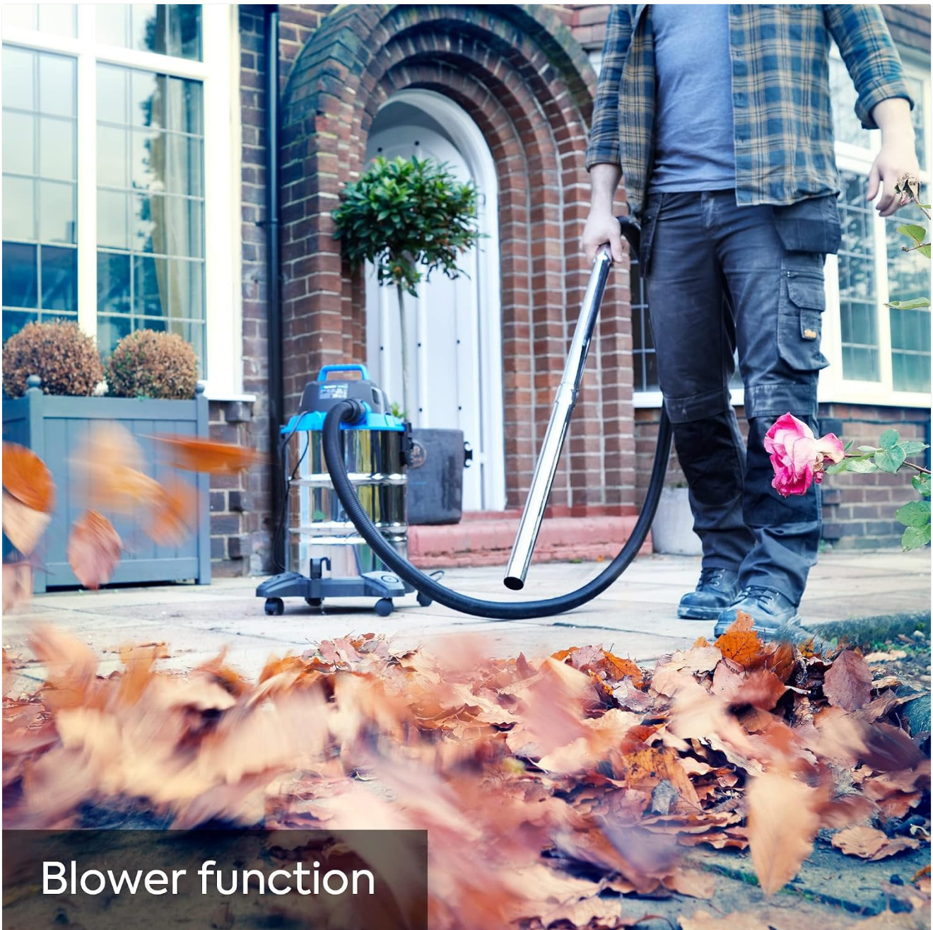
Image: The Vacmaster VQ1530SFDC utilizing its blower function to clear leaves from an outdoor area.