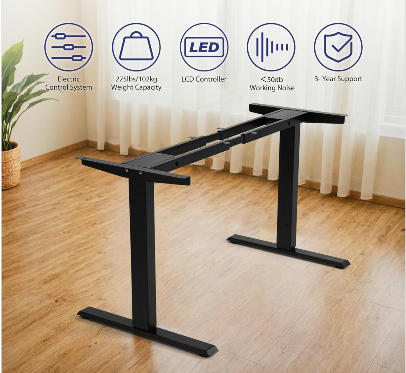
Figure 6: Visual representation of the key features offered by the TOPSKY DF02.01 standing desk frame.