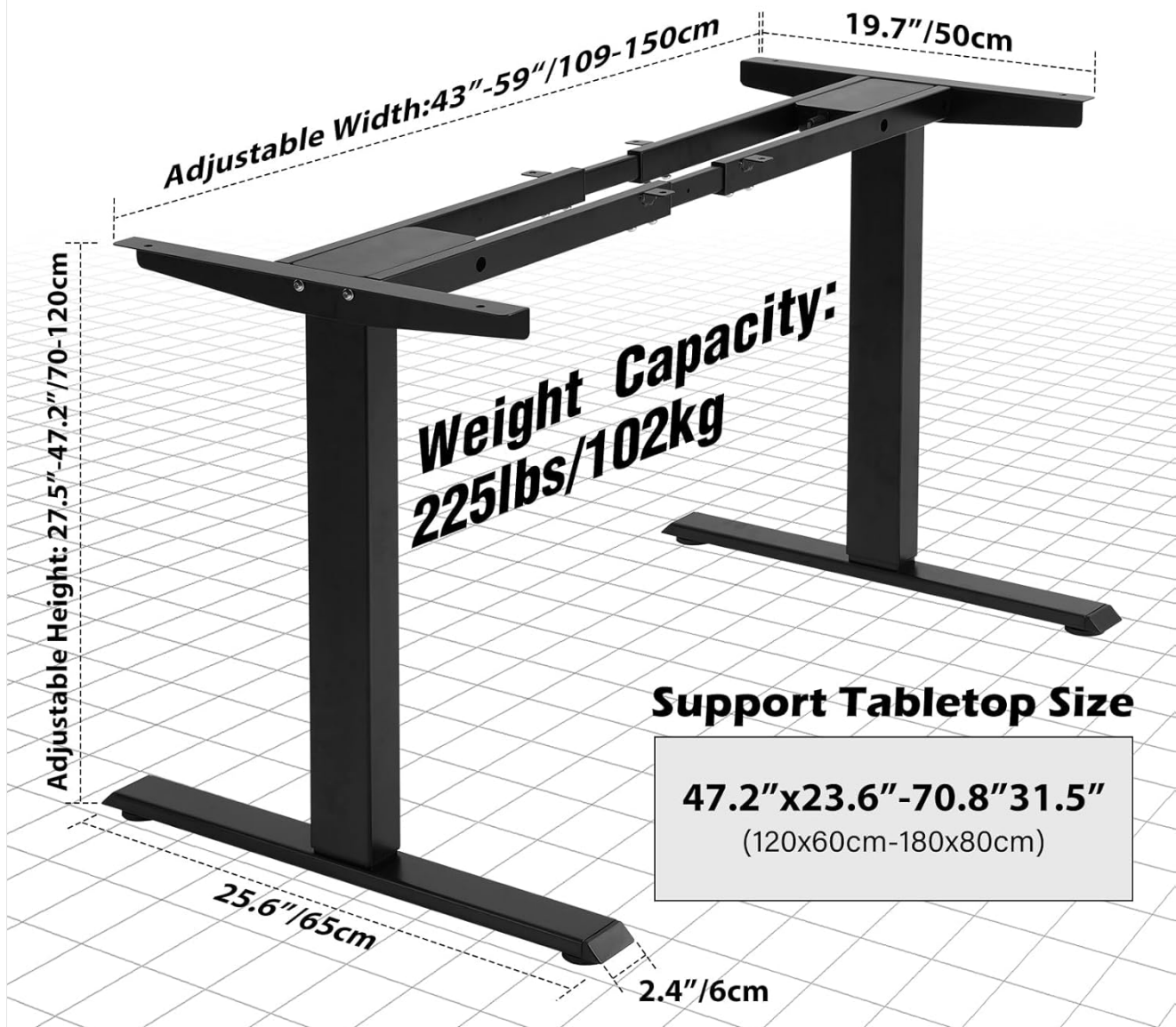
Figure 2: Key dimensions and weight capacity of the TOPSKY DF02.01 desk frame.