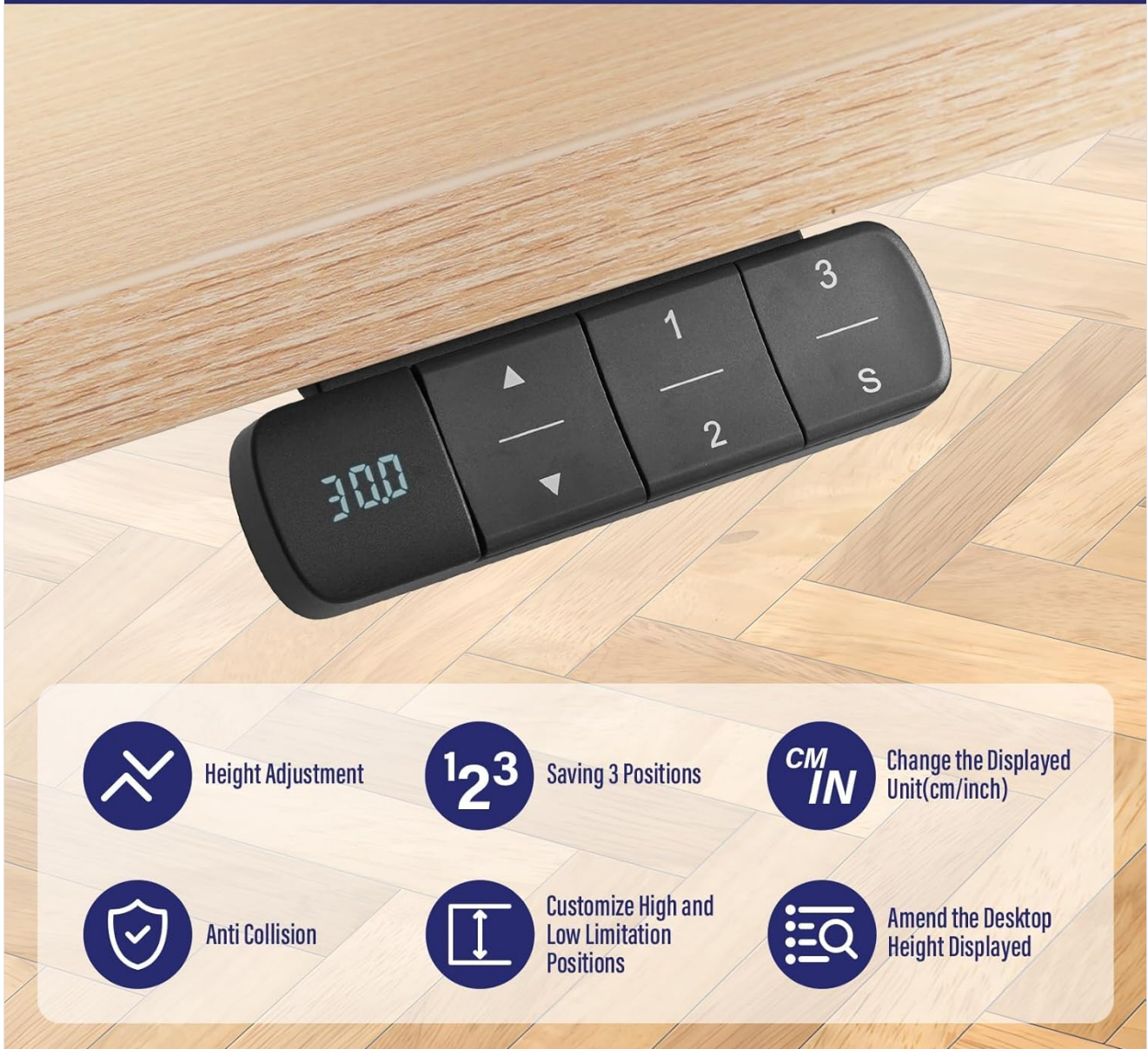
Figure 4: The LCD controller offers various functions including height adjustment, memory positions, anti-collision, and unit conversion.