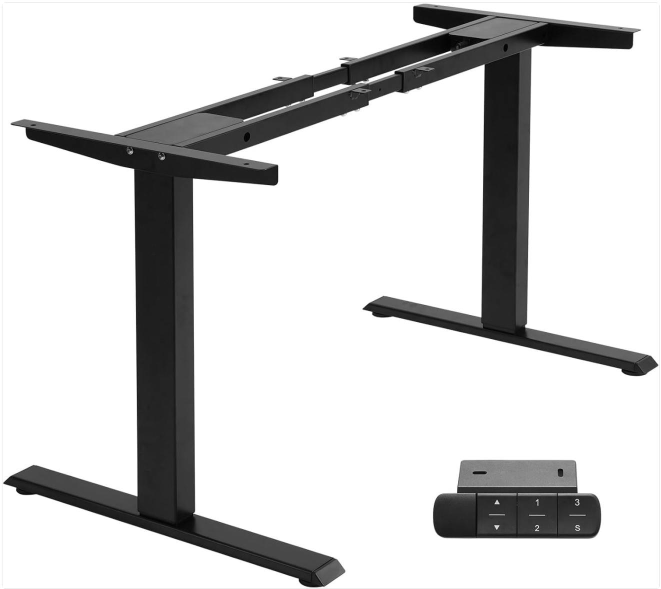
Figure 1: TOPSKY DF02.01 Dual Motor Electric Adjustable Standing Desk Frame (Black)

Key features include a powerful dual-motor system for quick and quiet height adjustments, a sturdy powder-coated steel frame supporting up to 225 lbs (102 kg), and an adjustable height range from 27.6 inches (70 cm) to 47.3 inches (120 cm). The frame width is adjustable from 43 inches (108.8 cm) to 59 inches (150 cm), accommodating tabletops up to 70.8 x 31.5 inches (180 x 80 cm).