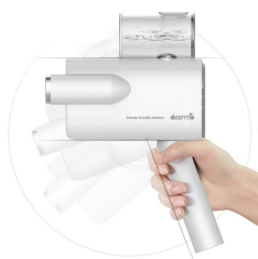
Figure 2.4: Illustration of the overhead 100ml water tank design, which utilizes gravity to reduce effort during ironing.

Overhead 100ML Water Tank, Gravity Forward, Less Effort When Ironing