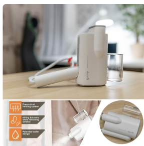
Figure 2.5: Features of the