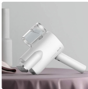
Figure 2.3: The steamer with its transparent 100ml water tank clearly visible, ready for use.

Overhead 100ML Water Tank, Gravity Forward, Less Effort When Ironing