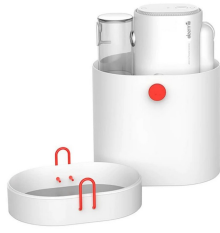
Figure 2.6: The Deerma HS007 steamer and its included accessories, such as the water cup, stored compactly in its dedicated container.

steamer including its pressurized heating system, ability to kill bacteria while removing wrinkles, and patented water design.