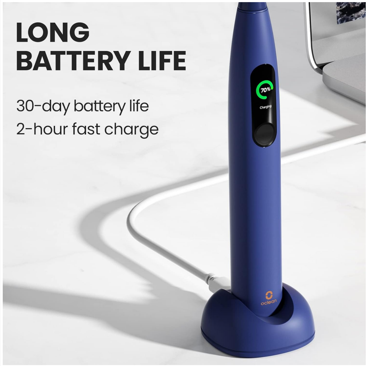
Image: The Oclean X Pro toothbrush standing upright on its charging base, connected via a white USB cable.