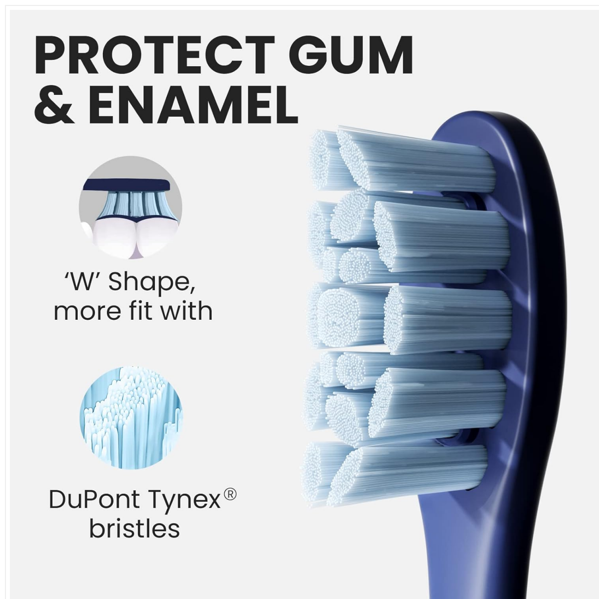
Image: A close-up view of the Oclean X Pro's 'W' shape DuPont Tynex bristles, designed for gum and enamel protection.

Dentists recommend replacing your brush head every 3 months or sooner if the bristles appear frayed. To replace, simply pull the old brush head straight off the handle and push a new Oclean DuPont brush head onto the shaft until it clicks.