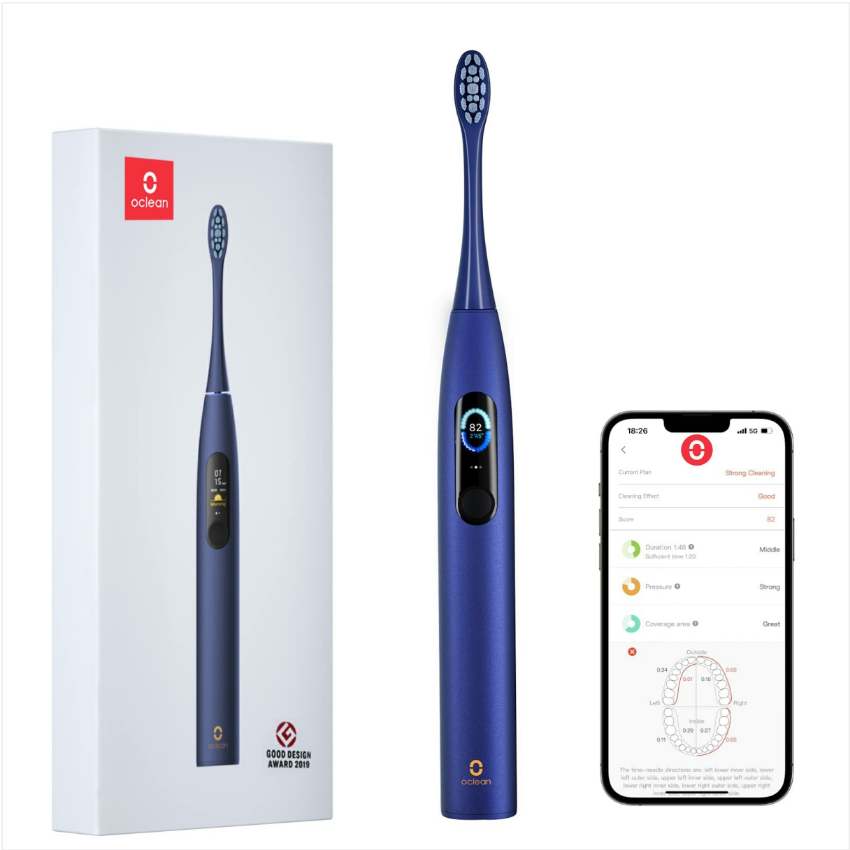
Image: Close-up of the Oclean X Pro's smart screen showing brushing results and blind areas.