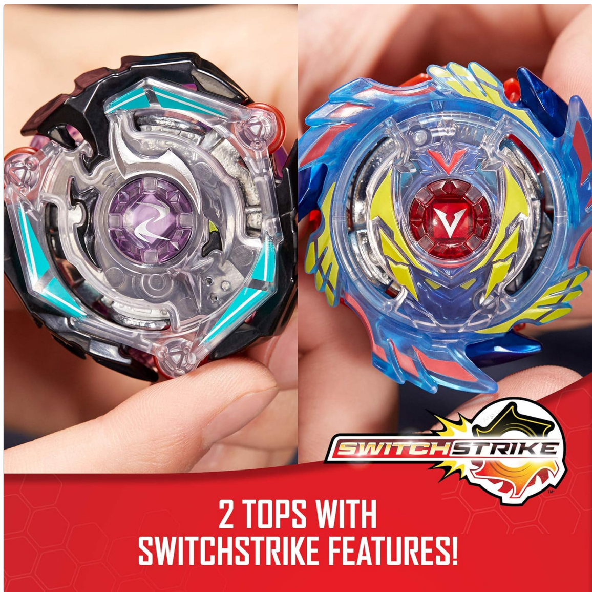
Image: Close-up of two assembled Beyblade Burst tops, Genesis Valtryek V3 (blue) and Satomb S3 (black/purple), held in hands, ready for battle.