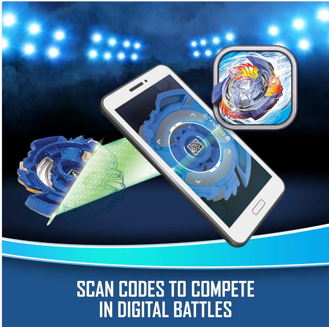
Image: A smartphone screen displaying the Beyblade Burst app, with a Beyblade top being scanned to engage in digital battles.