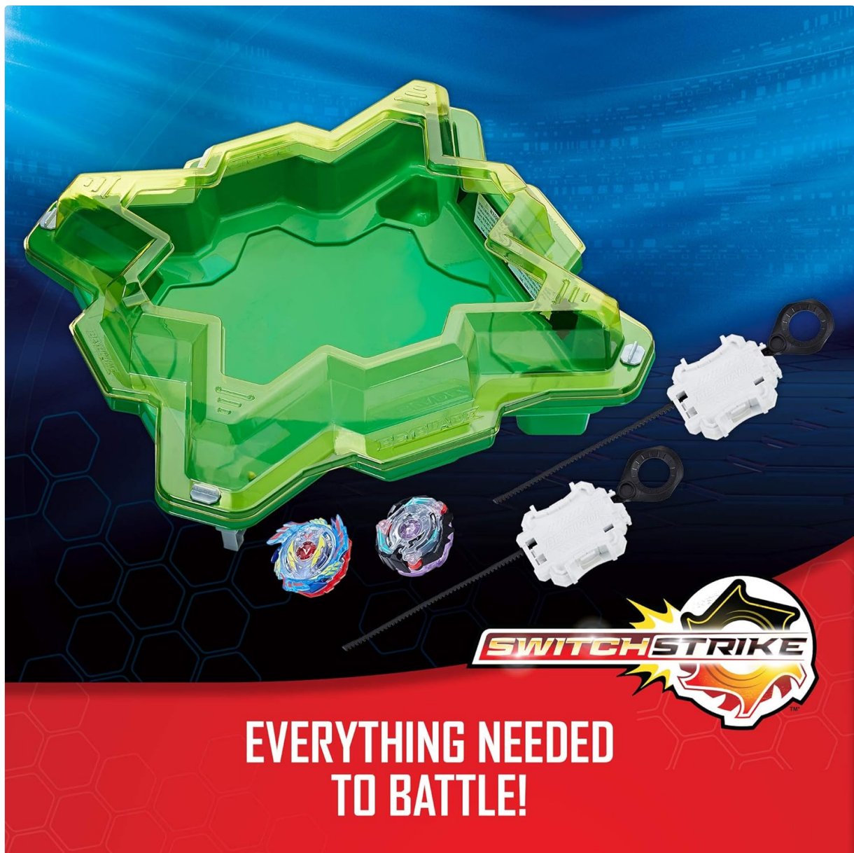
Image: All components of the Beyblade Burst Evolution Star Storm Battle Set, featuring the green Beystadium, two Beyblade tops (blue and red), and two launchers.