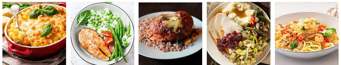
Image: The microwave oven displayed with various cooked food items, illustrating the convenience of its preset cooking programs.