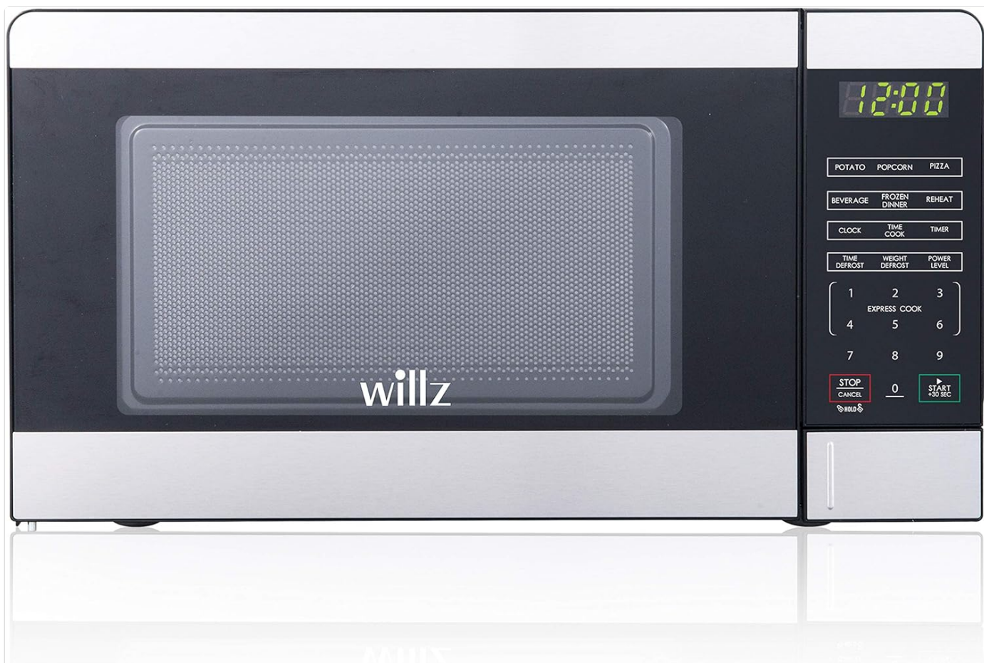
Image: Front view of the Willz WLCMV207S2-07 microwave oven, showcasing its sleek design and control panel.