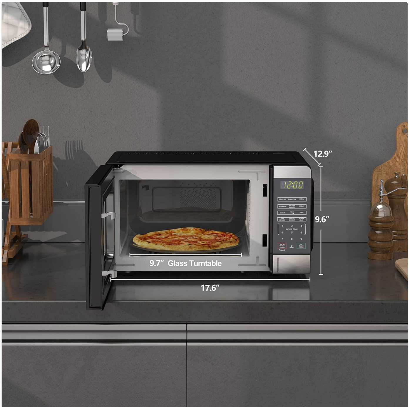
Image: Side view of the microwave oven with dimensions (17.6" W x 12.9" D x 9.6" H) and internal components like the 9.7" glass turntable highlighted.