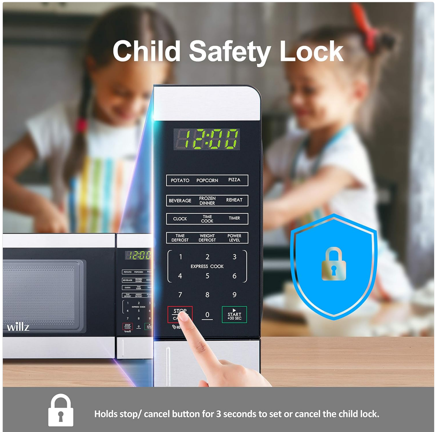
Image: A hand pressing the "STOP/CLEAR" button on the microwave control panel, with an icon indicating the child safety lock feature.

the lock is active. To deactivate, press and hold "STOP/CLEAR" again for 3 seconds.