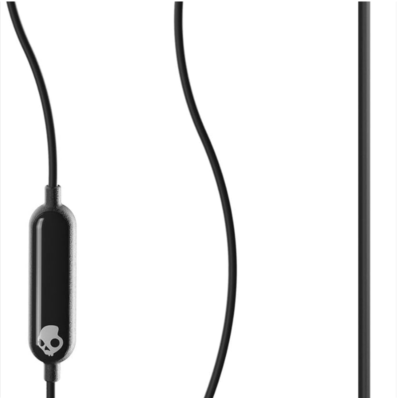
Image: Skullcandy Set USB-C Wired Earbuds in True Black, showcasing the earbuds, in-line remote, and USB-C connector.