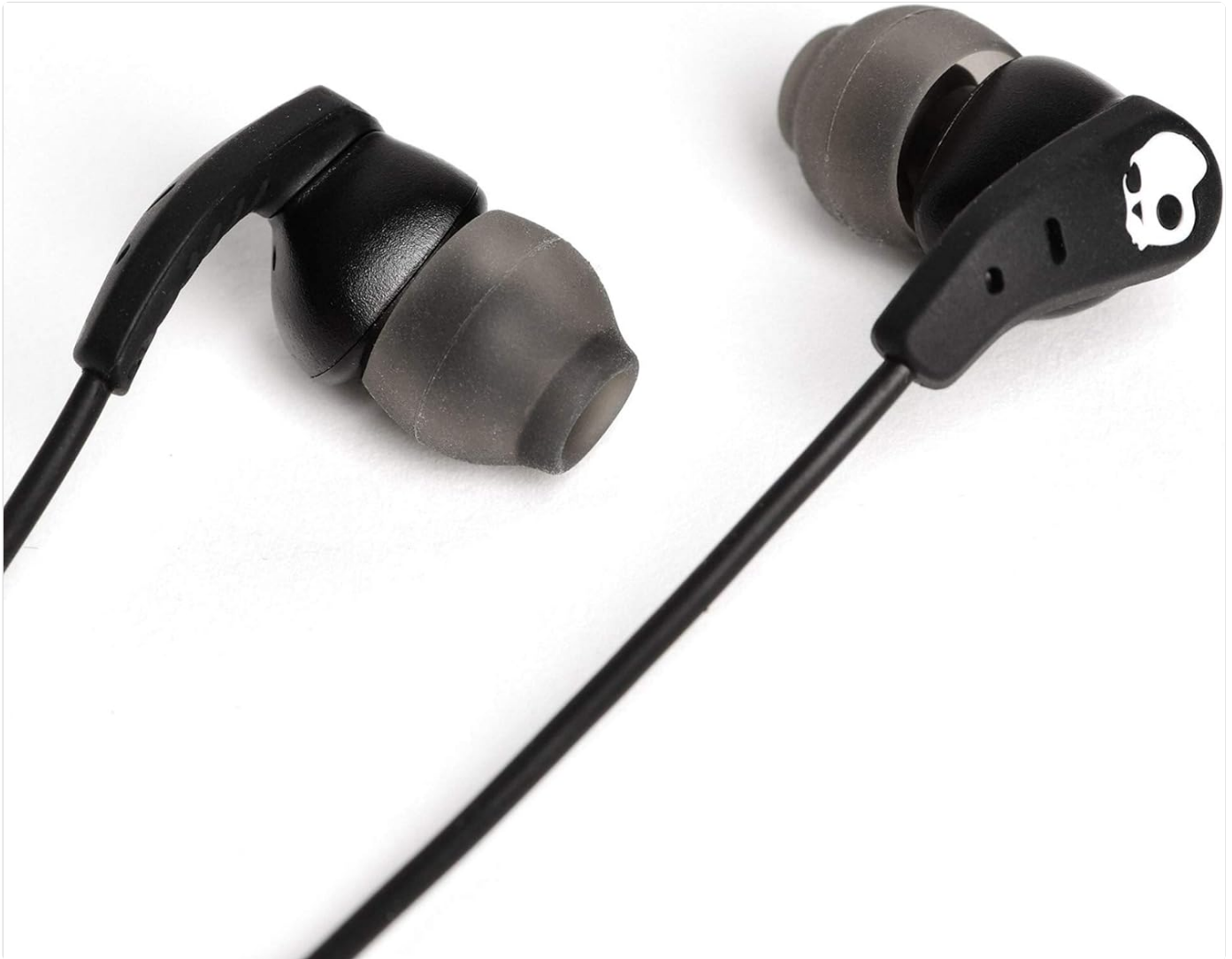
Image: A close-up view of an individual Skullcandy earbud, highlighting the soft ear gel and the ergonomic design for a comfortable and secure fit.