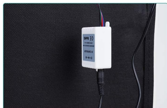
Image: The wireless remote, RF controller, and power adapter for the LED lighting system.