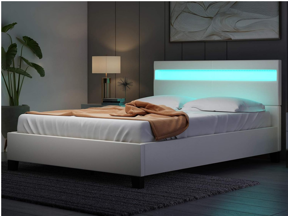
Image: The bed frame illuminated with blue LED lights, demonstrating an ambient lighting option.