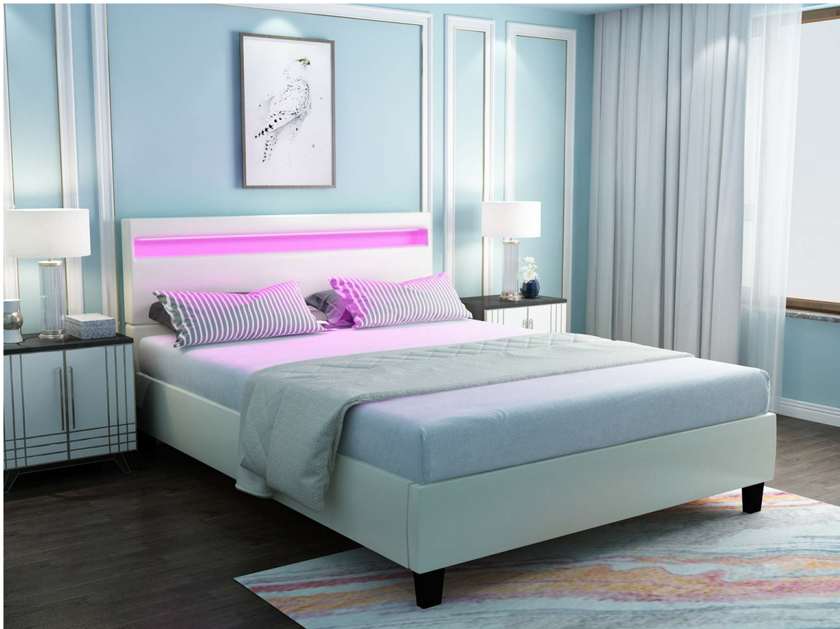
Image: The mecor Queen Size LED Bed Frame with its headboard LED lights illuminated.