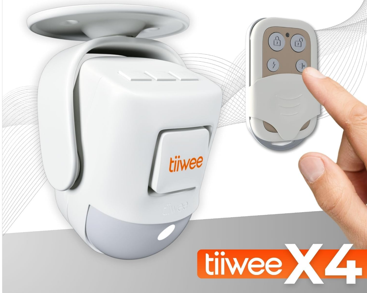
Image: The tiivee X4 motion detector unit and its accompanying remote control.