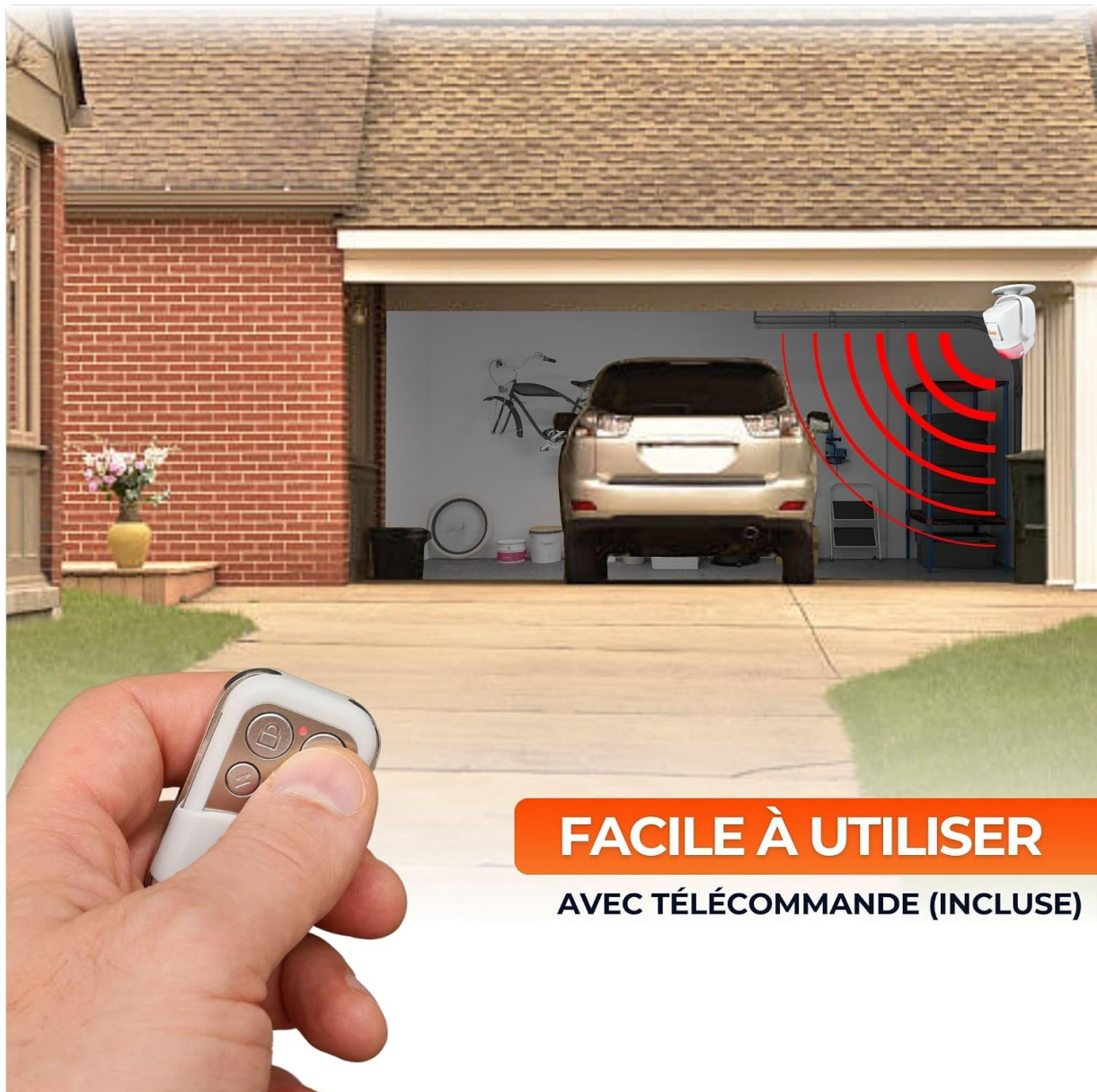
Image: A hand holding the tiwee X4 remote control, demonstrating its ease of use for activating and deactivating the alarm.