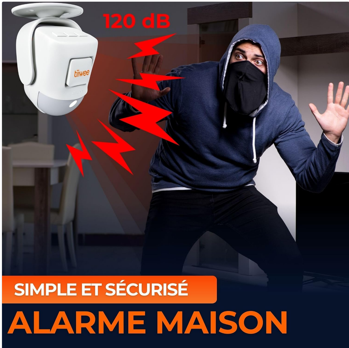
Image: The tiivee X4 motion detector alarm sounding, deterring an intruder in a home setting.