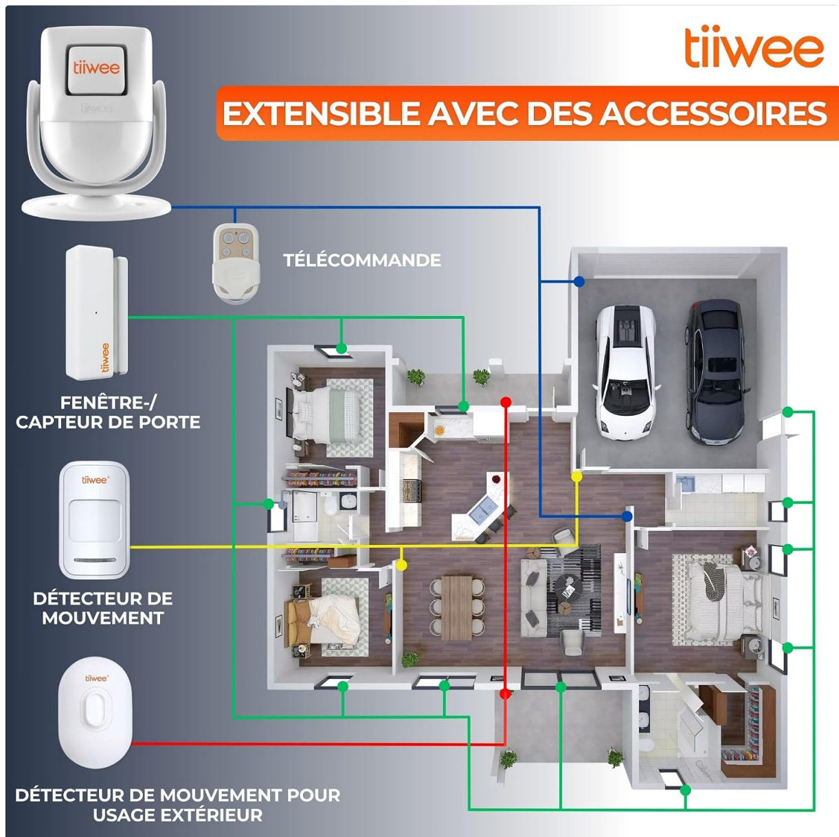
Image: Diagram illustrating how the tiivee X4 system can be extended with additional sensors like door/window contacts and external motion detectors.