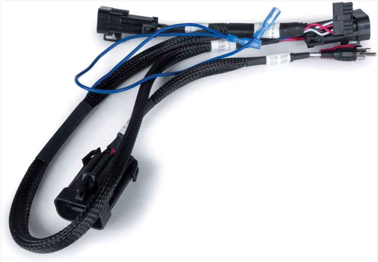
Image: A detailed view of the MTX Audio wiring harness, featuring various connectors and labeled wires for amplifier and RideCommand integration.