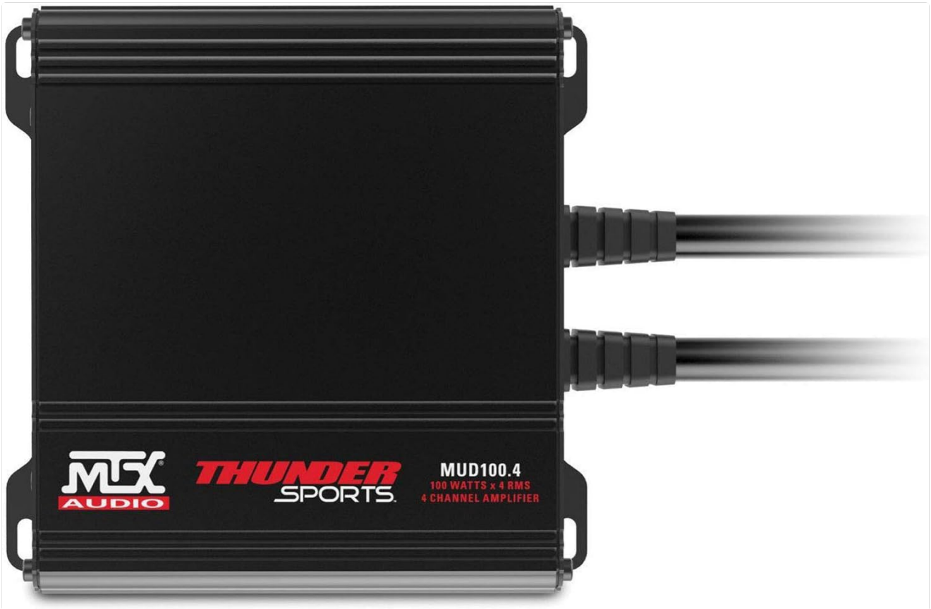
Image: The MTX Audio MUD100.4 4-channel amplifier, a compact black unit with "MTX THUNDER SPORTS" branding and connection ports.