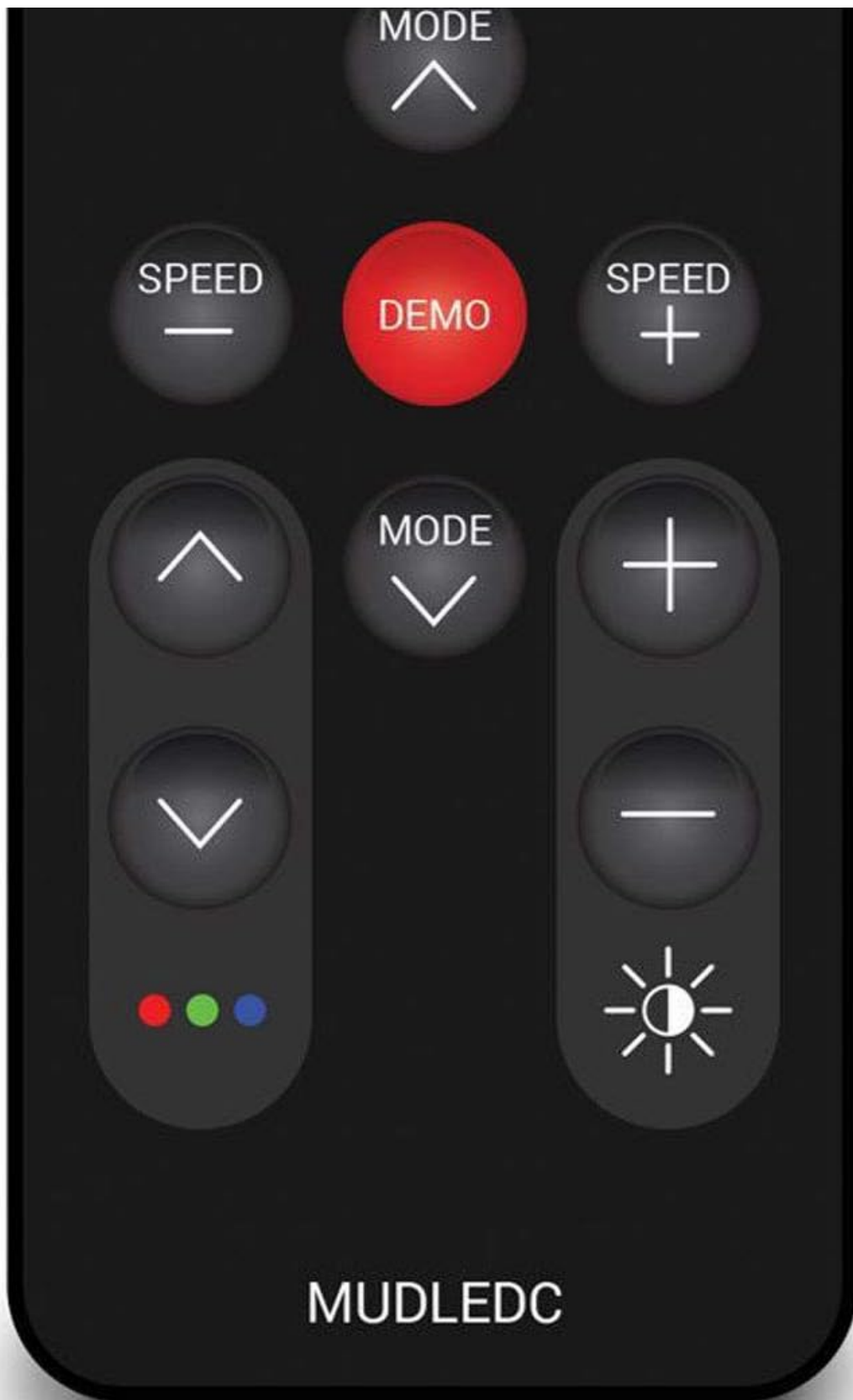
Image: The MTX Audio MUDLEDC remote control, a black rectangular device with various buttons for power, mode, speed, and color selection for RGB lighting.