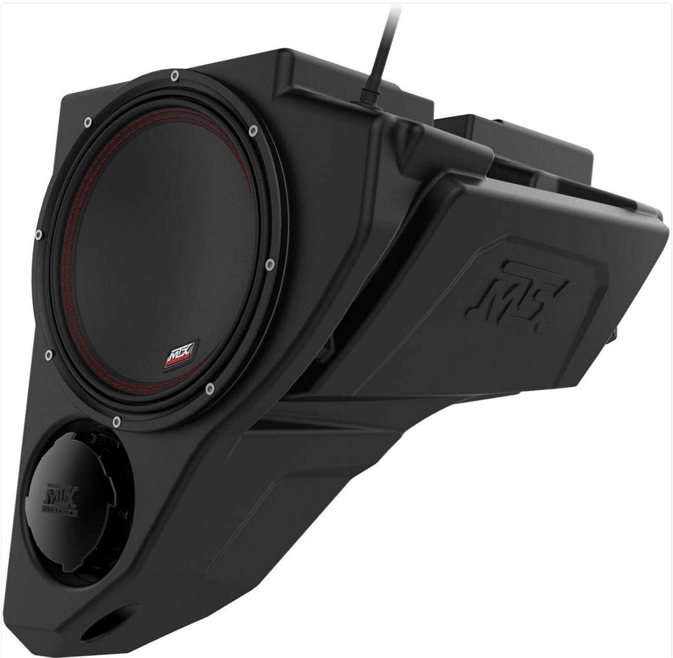
Image: The MTX Audio RZR-14-SW 10-inch subwoofer enclosure, a black unit with a red-stitched subwoofer cone, designed for custom fit in Polaris RZR vehicles.