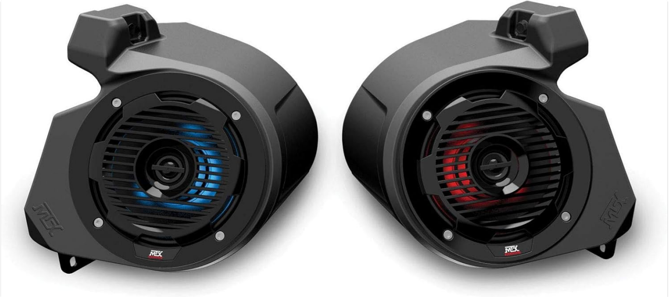
Image: Two MTX Audio RZR-14-FS front speaker pods, one illuminated with blue RGB lighting and the other with red, showcasing their custom fit design.

The RZR-14-FS front speaker pods are designed to fit seamlessly into your RZR's kick panels. Utilize the POD-LOC Technology for quick and simple installation with the custom bracket. Ensure secure mounting to prevent vibration.