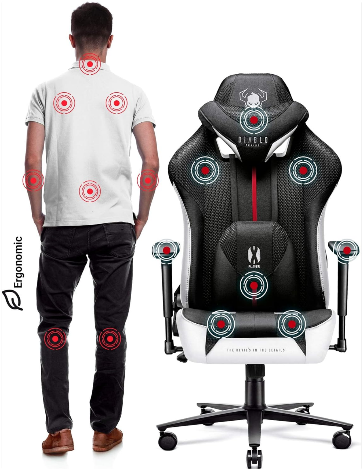
Figure 3.6: Ergonomic support points of the chair.

This image highlights the specific areas of the chair that provide ergonomic support, corresponding to the body's natural pressure points for improved comfort and posture.