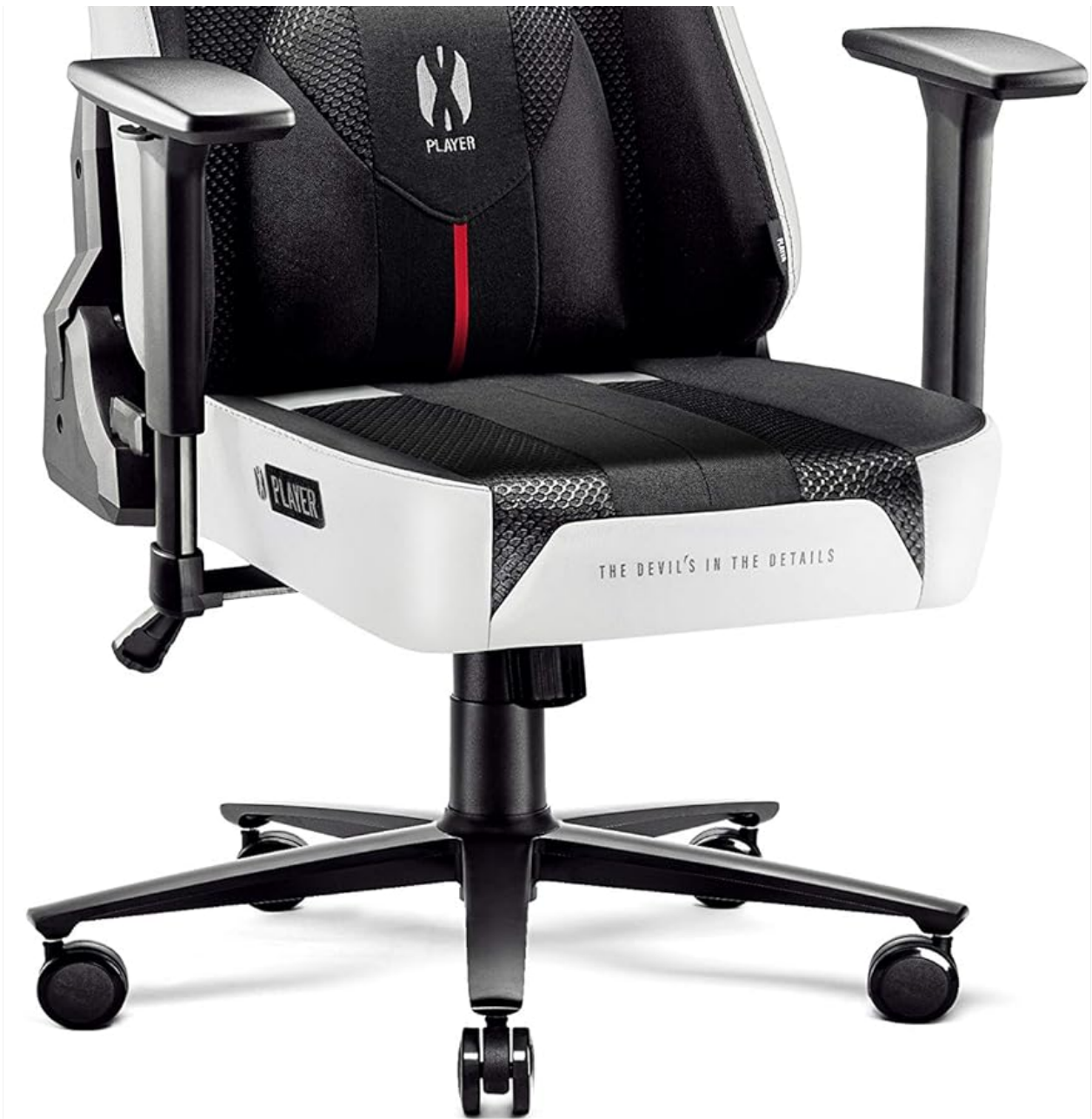
Figure 1.1: Front view of the Diablo X-Player 2.0 Gaming Chair.

This image displays the Diablo X-Player 2.0 Gaming Chair in its full form, highlighting its white and black color scheme, ergonomic design, and prominent Diablo branding on the headrest and lumbar cushion.