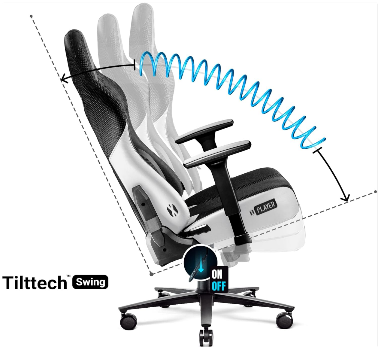
Figure 3.1: Tilttech Gear recline mechanism showing various angles.

This image illustrates the range of recline angles available with the Tilttech Gear mechanism, from upright (90° for work) to fully reclined (160° for turbo nap), including gaming (120°) and movie (140°) positions.