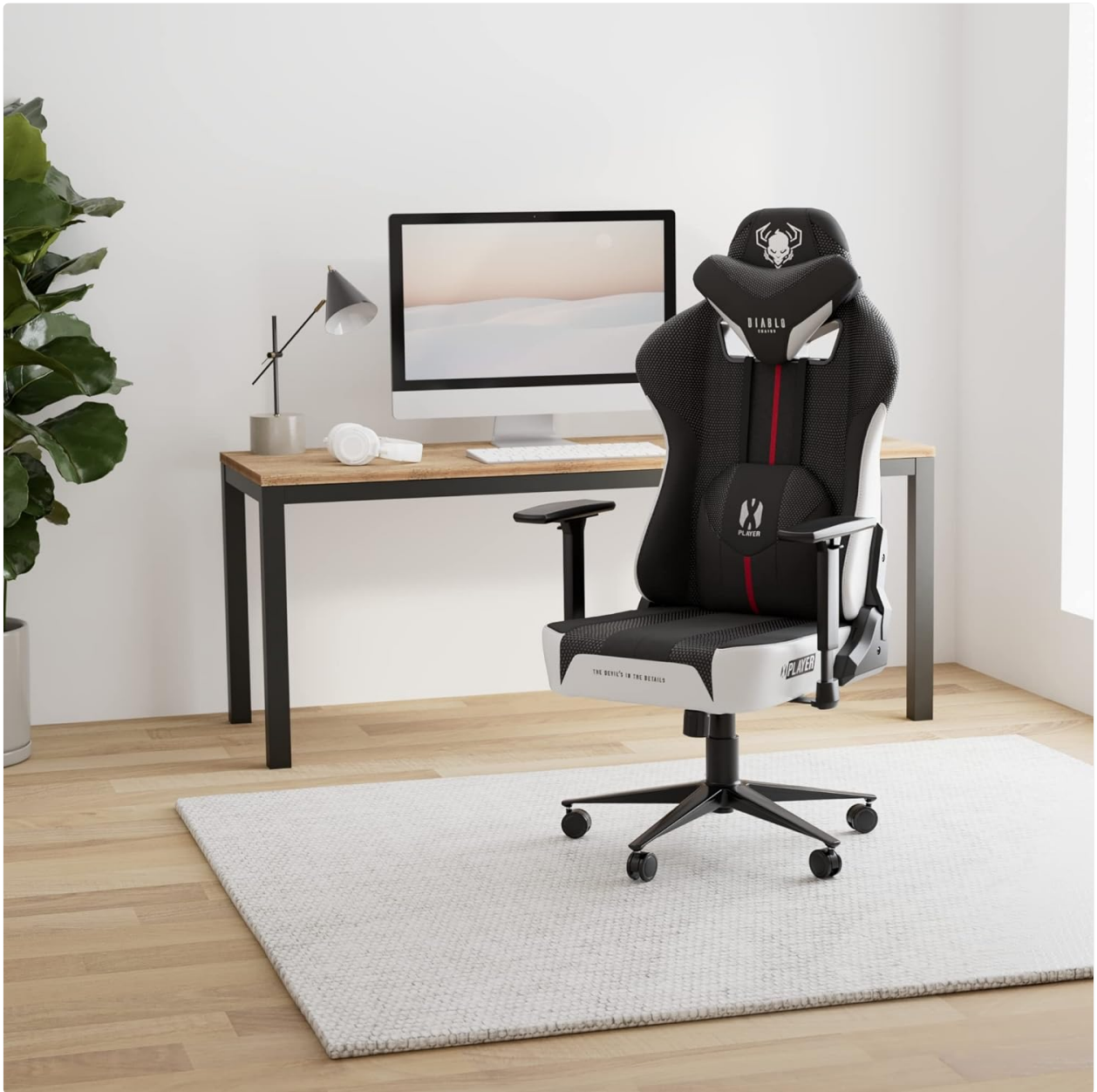
Figure 1.2: Diablo X-Player 2.0 Gaming Chair in a typical home office environment.

The chair is shown positioned in front of a desk with a computer monitor, illustrating its suitability for both gaming and professional use within a home or office setup.