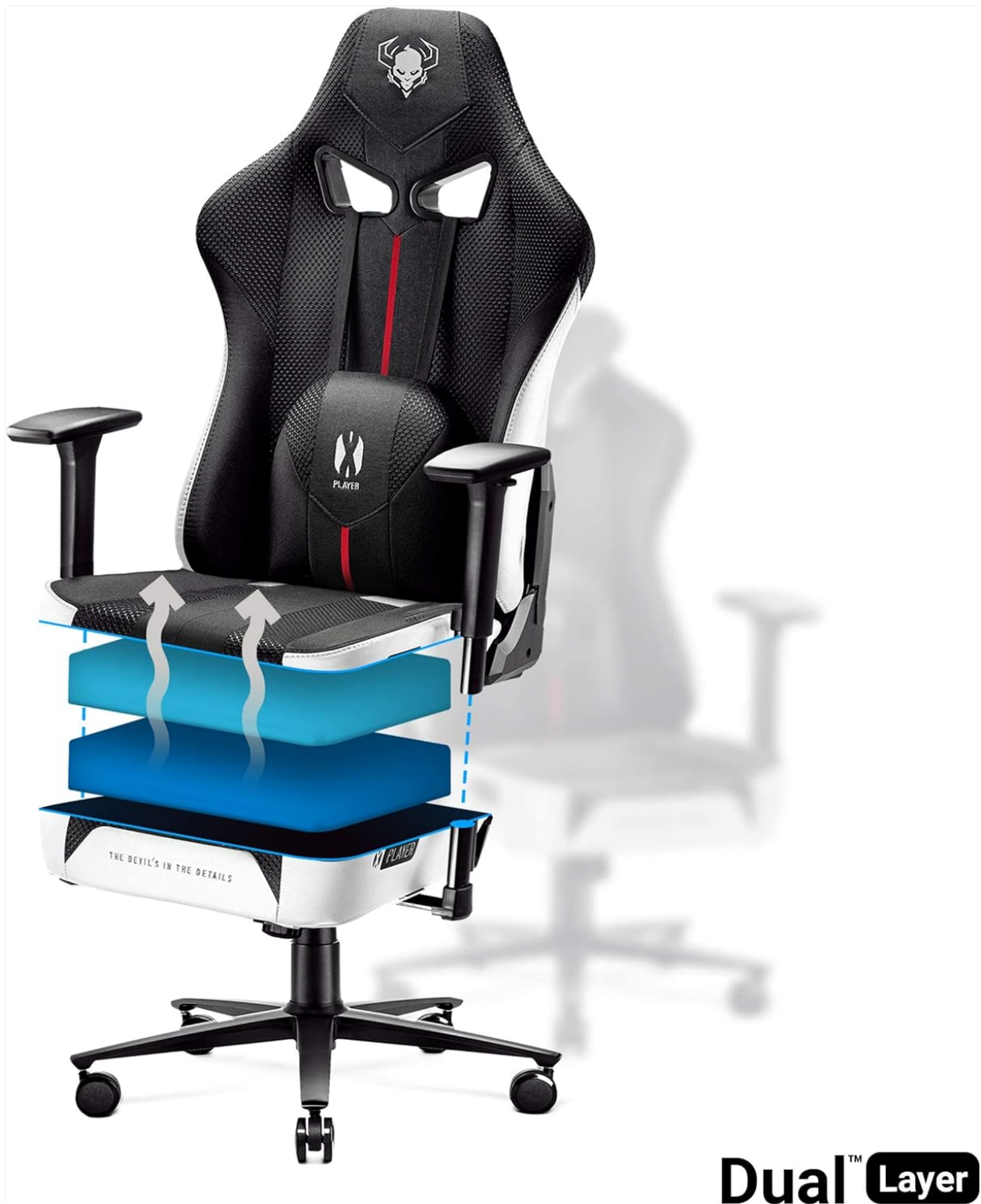
Figure 3.5: Dual Layer cushioning system.

This cutaway view illustrates the Dual Layer cushioning system within the seat, showing the different layers of foam designed for optimal support and breathability.