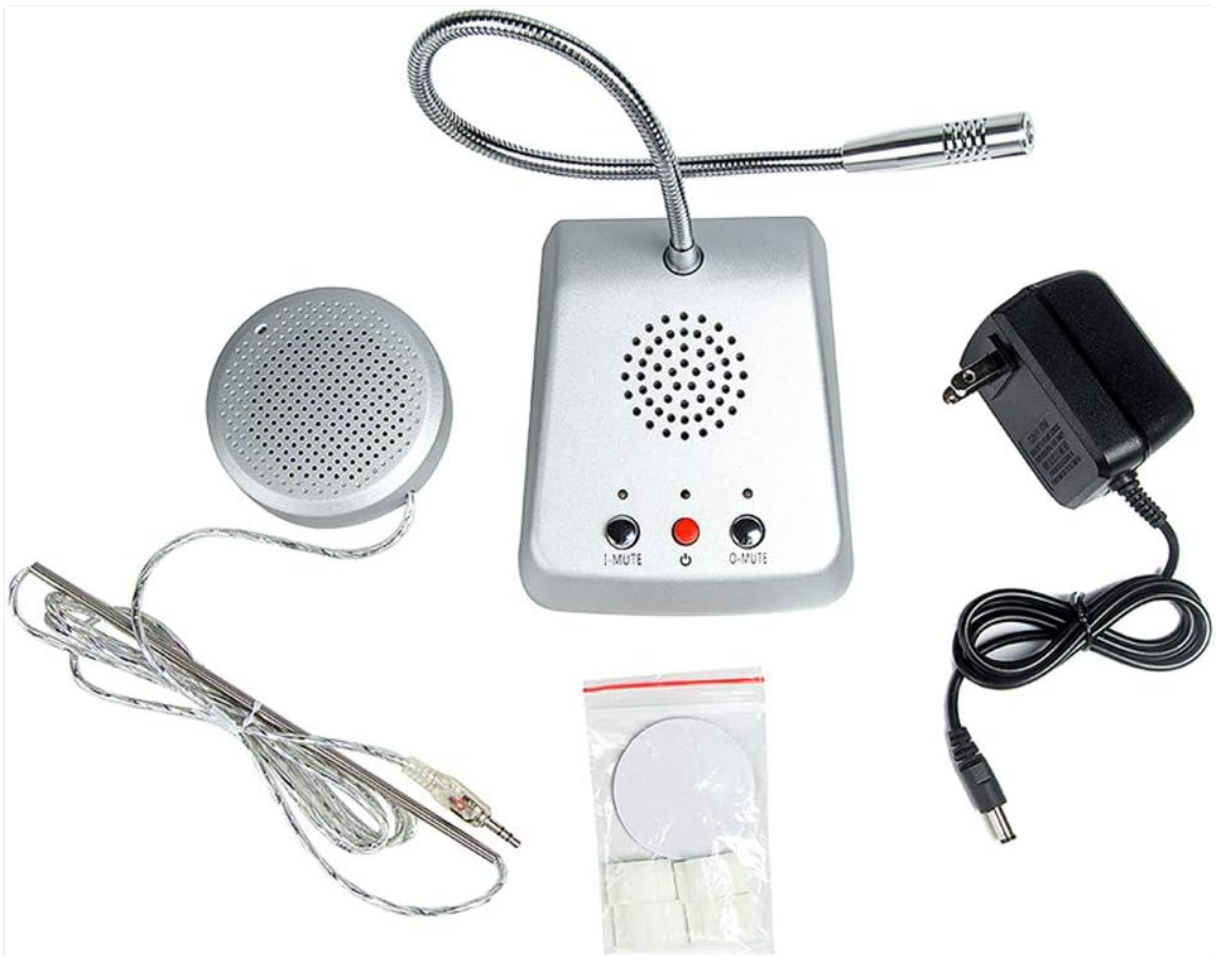
Figure 2: Unboxed components of the intercom system