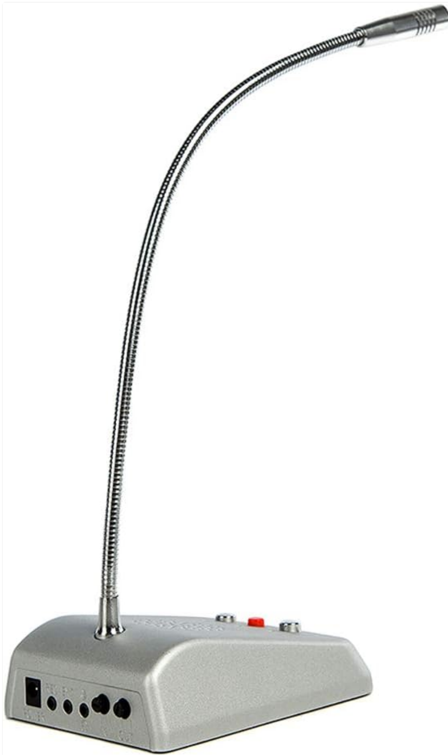
Figure 4: Main unit front controls including mute switches

For a visual demonstration of the system's operation, please refer to the video below: