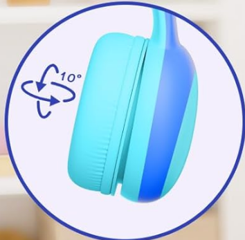
SUPPORT \pm 10^\circ ADAPTIVE ADJUSTMENT