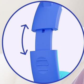
8-POSITION ADJUSTABLE HEADBAND