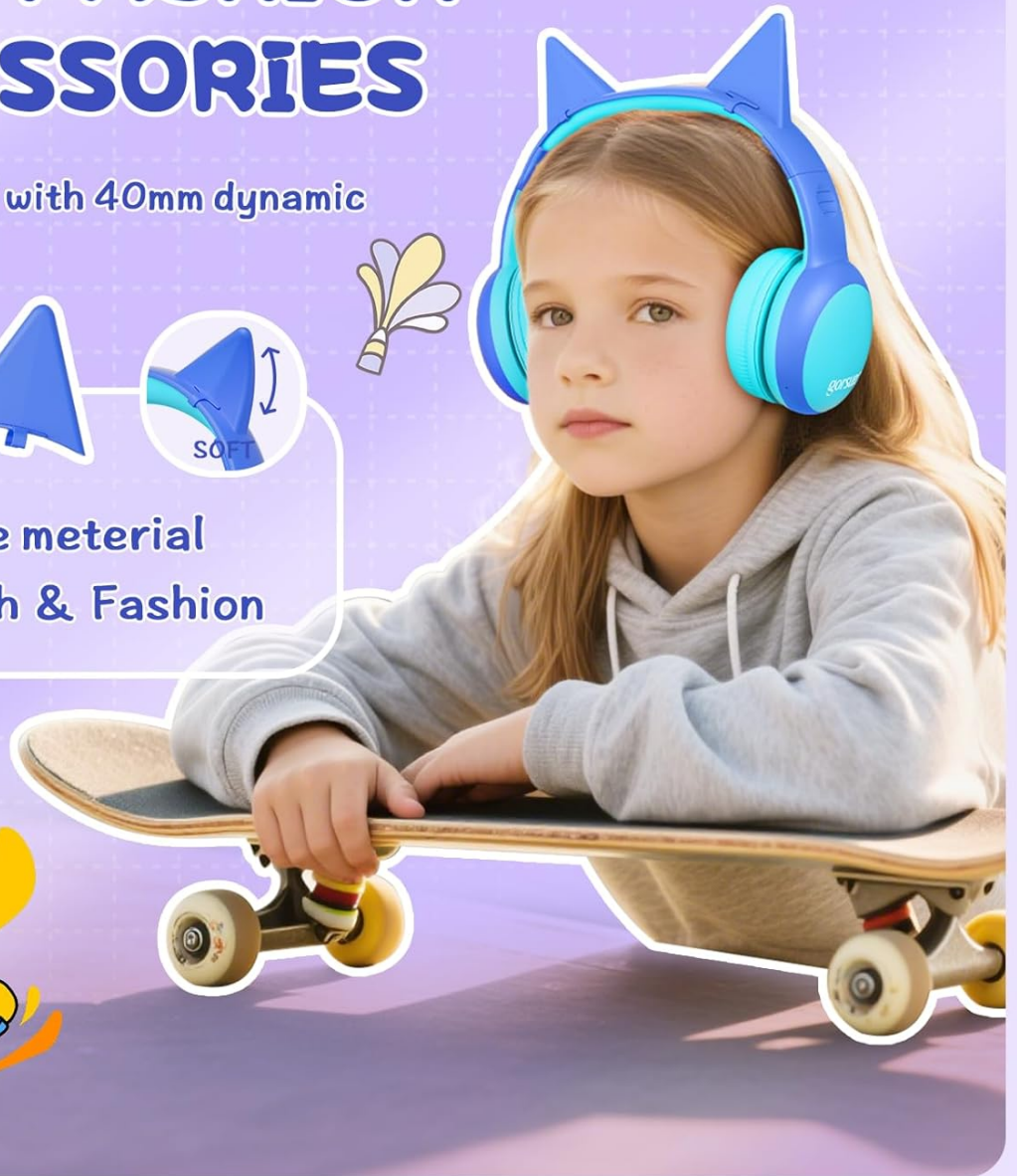
Image: A detailed view of the gorsun headphones, highlighting the detachable cat ears and the internal 40mm dynamic drivers for sound quality.