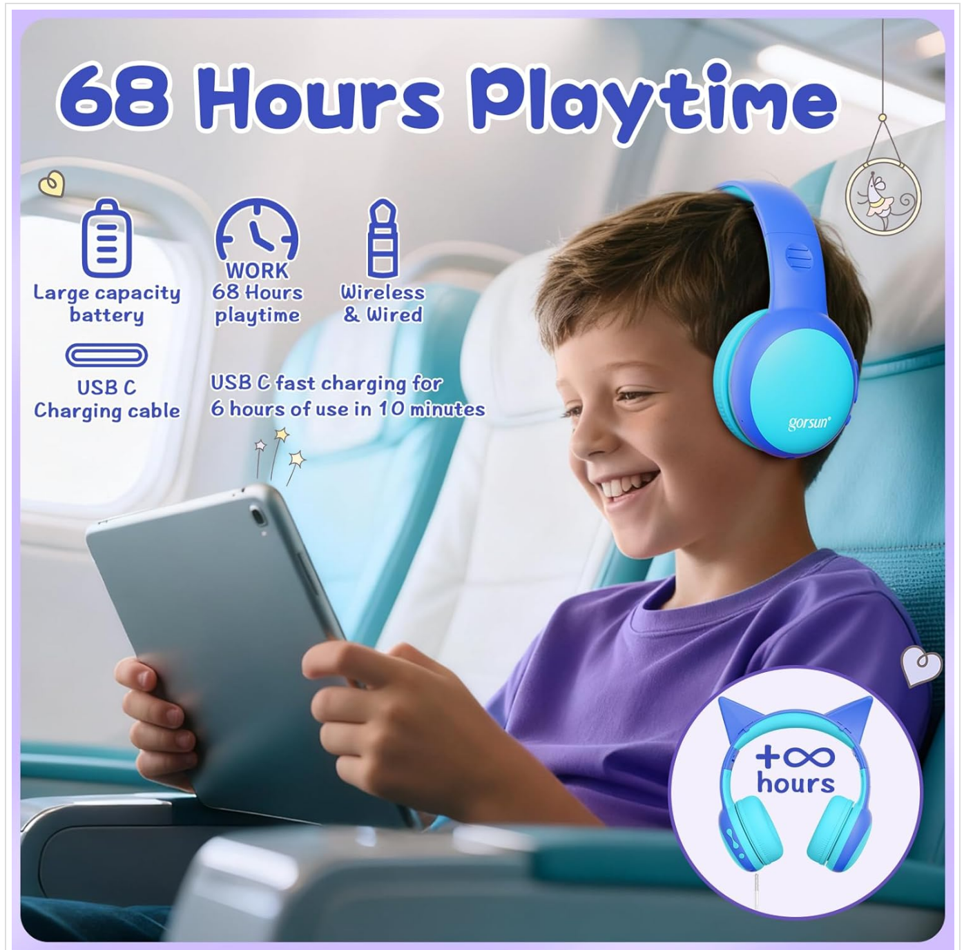
Image: A child wearing the gorsun headphones on an airplane, with visual cues indicating 68 hours of playtime and USB-C fast charging capabilities.