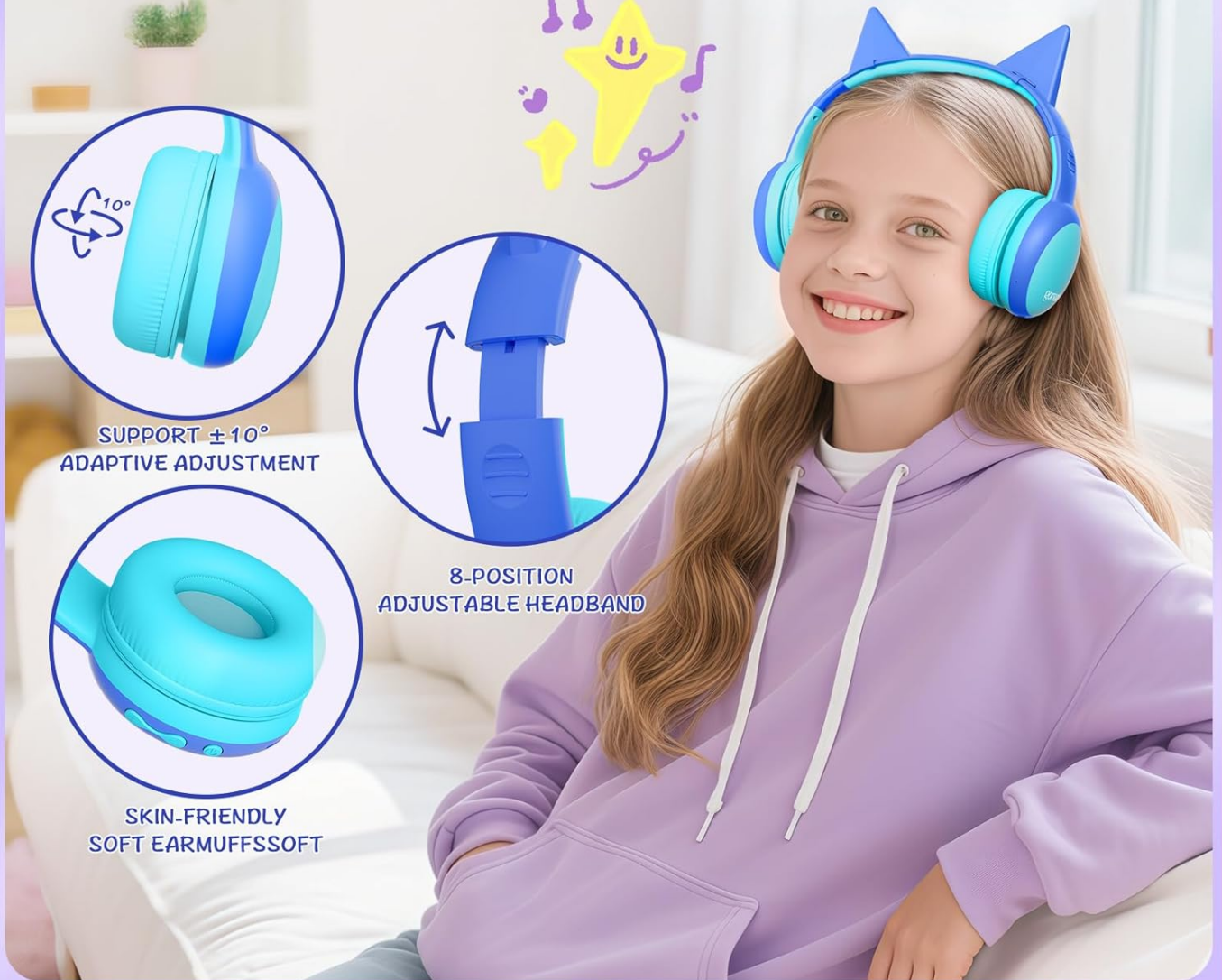
Image: A visual representation of the gorsun headphones' comfort features, including the \pm 10^\circ adaptive swivel earcups, 8-position adjustable headband, and skin-friendly soft earmuffs.