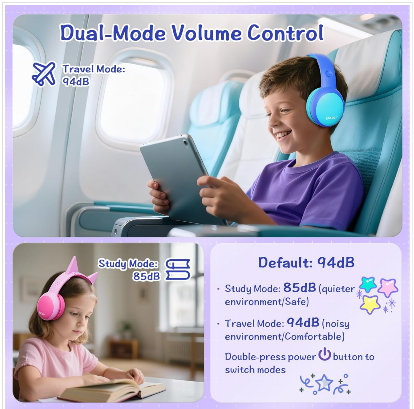
Image: A visual guide to the dual-mode volume control, showing a child using the headphones in "Travel Mode" (94dB) on an airplane and another child in "Study Mode" (85dB) while reading, with instructions to double-press the power button to switch modes.