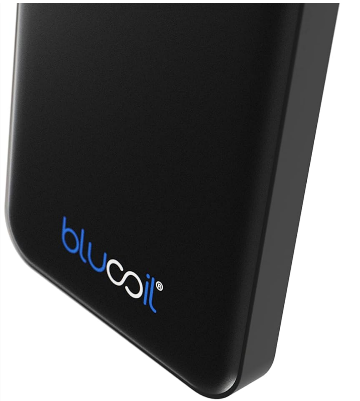
Image: The blucoil 5000mAh Portable Power Bank, a black rectangular device with four LED indicator lights and the blucoil logo.