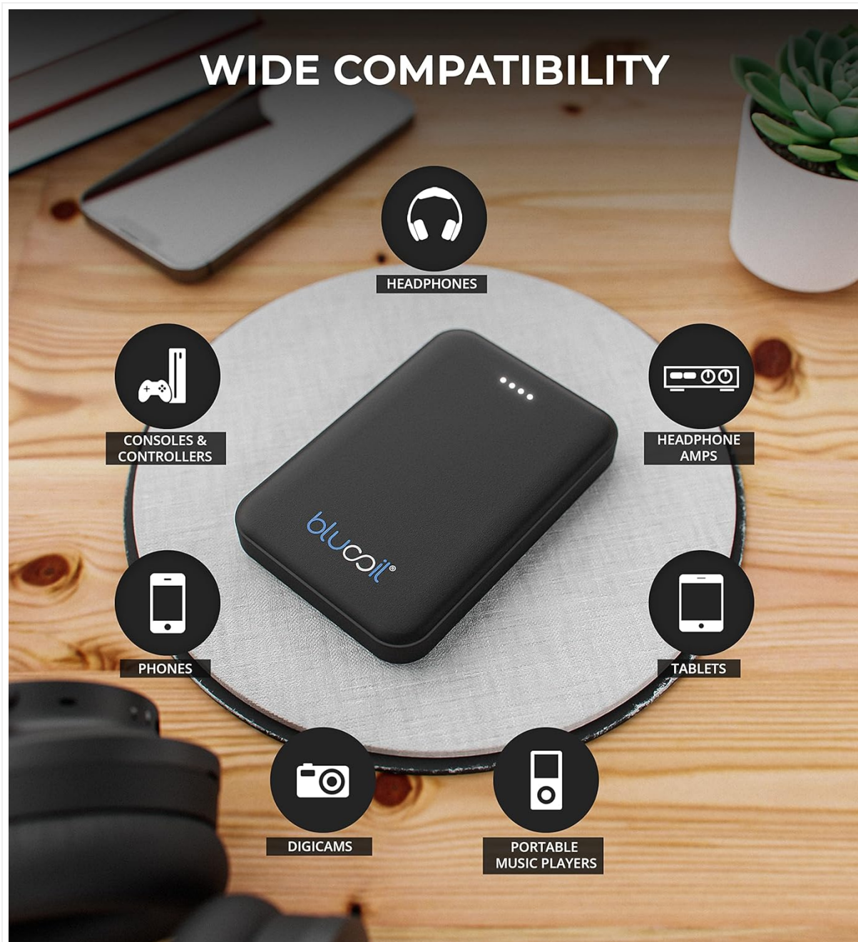
Image: The blucoil power bank surrounded by icons representing various compatible devices such as phones, tablets, headphones, and game consoles.