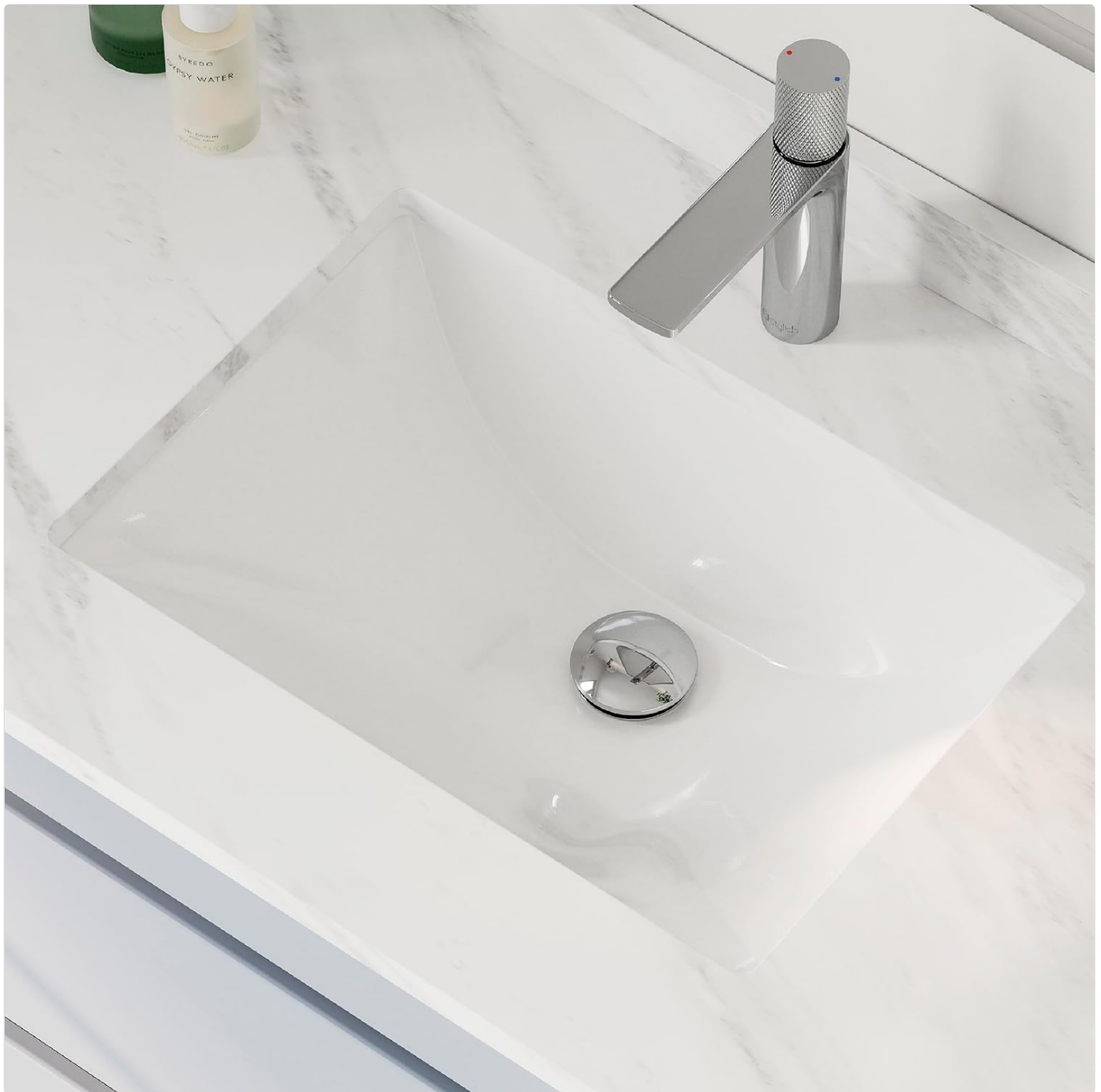
Image 6.1: The STYLISH P-201 sink installed in a bathroom vanity, with water flowing from the faucet, demonstrating typical operation.