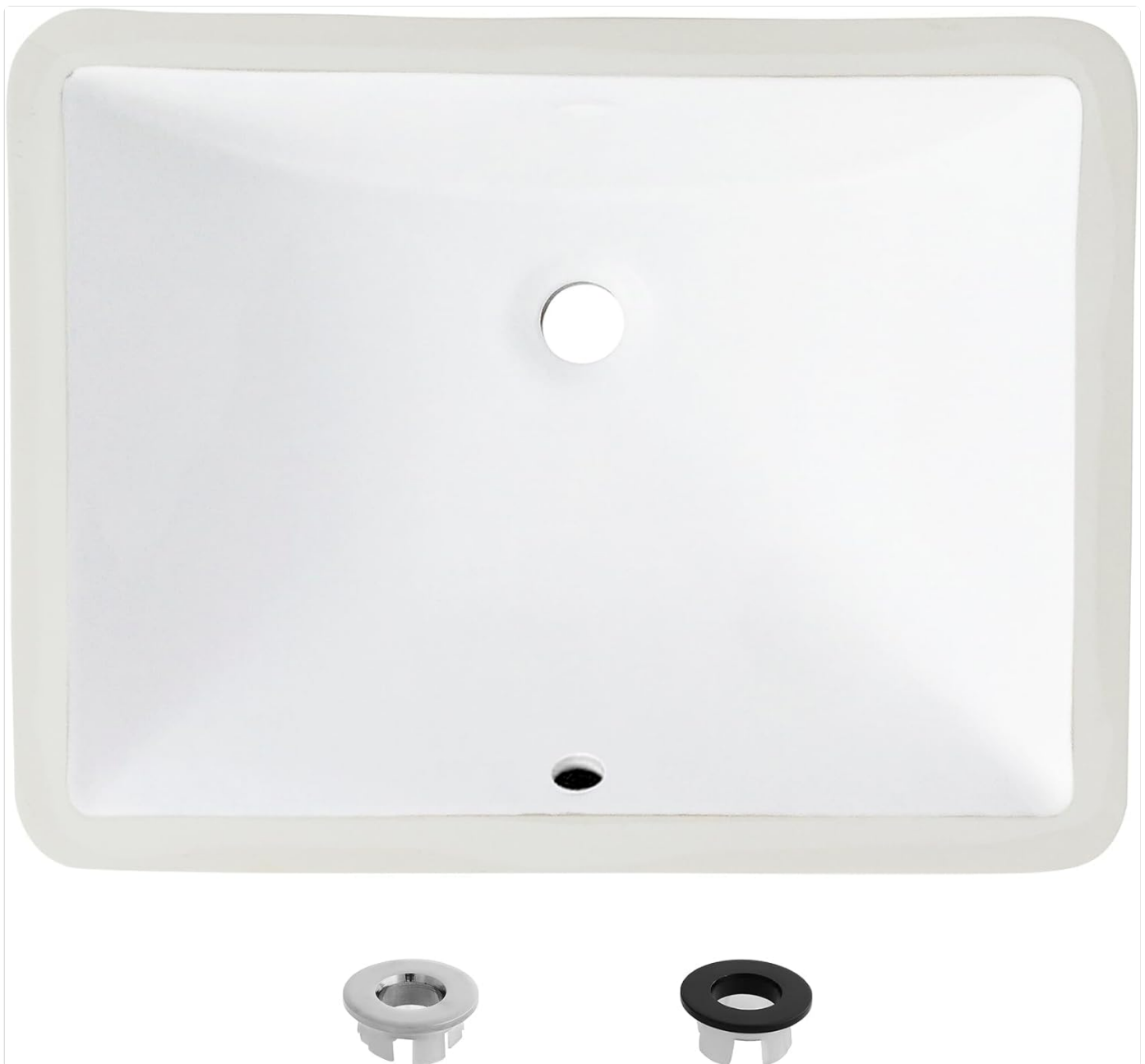
Image 1.1: The STYLISH P-201 Undermount Bathroom Sink, showcasing its rectangular design and white porcelain finish.