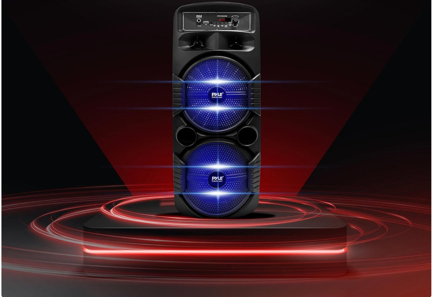
Figure 5.1: The speaker offers multiple connectivity options for diverse audio sources.