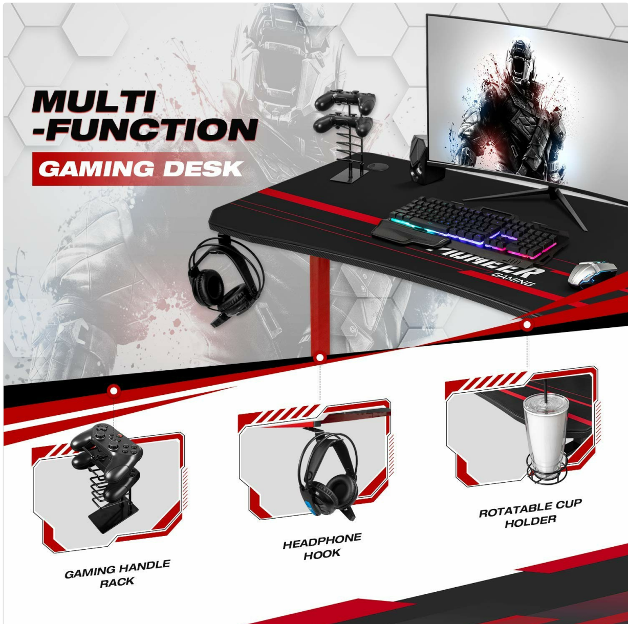
Image: A detailed view highlighting the gaming handle rack, headphone hook, and rotatable cup holder accessories.