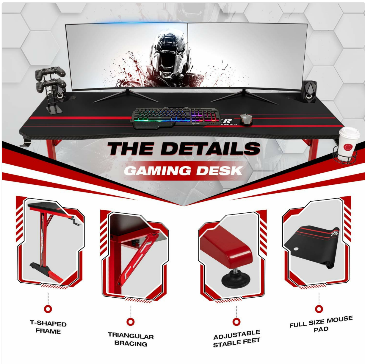
Image: Detailed view of the desk's structural components, including the T-shaped frame, triangular bracing, adjustable stable feet, and the full-size mouse pad.

The desk features a T-shaped frame with triangular bracing for enhanced stability. Adjustable stable feet are included to ensure the desk remains level on uneven surfaces.