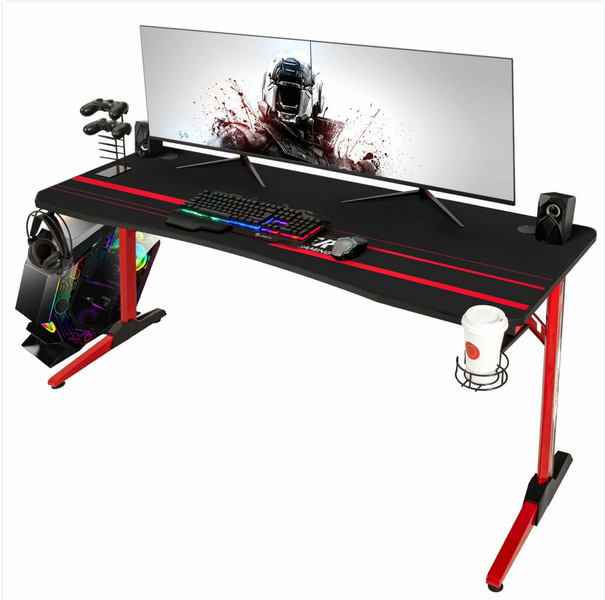
Image: The Devoko 55-inch Gaming Desk fully assembled, showcasing its design and capacity for gaming equipment.