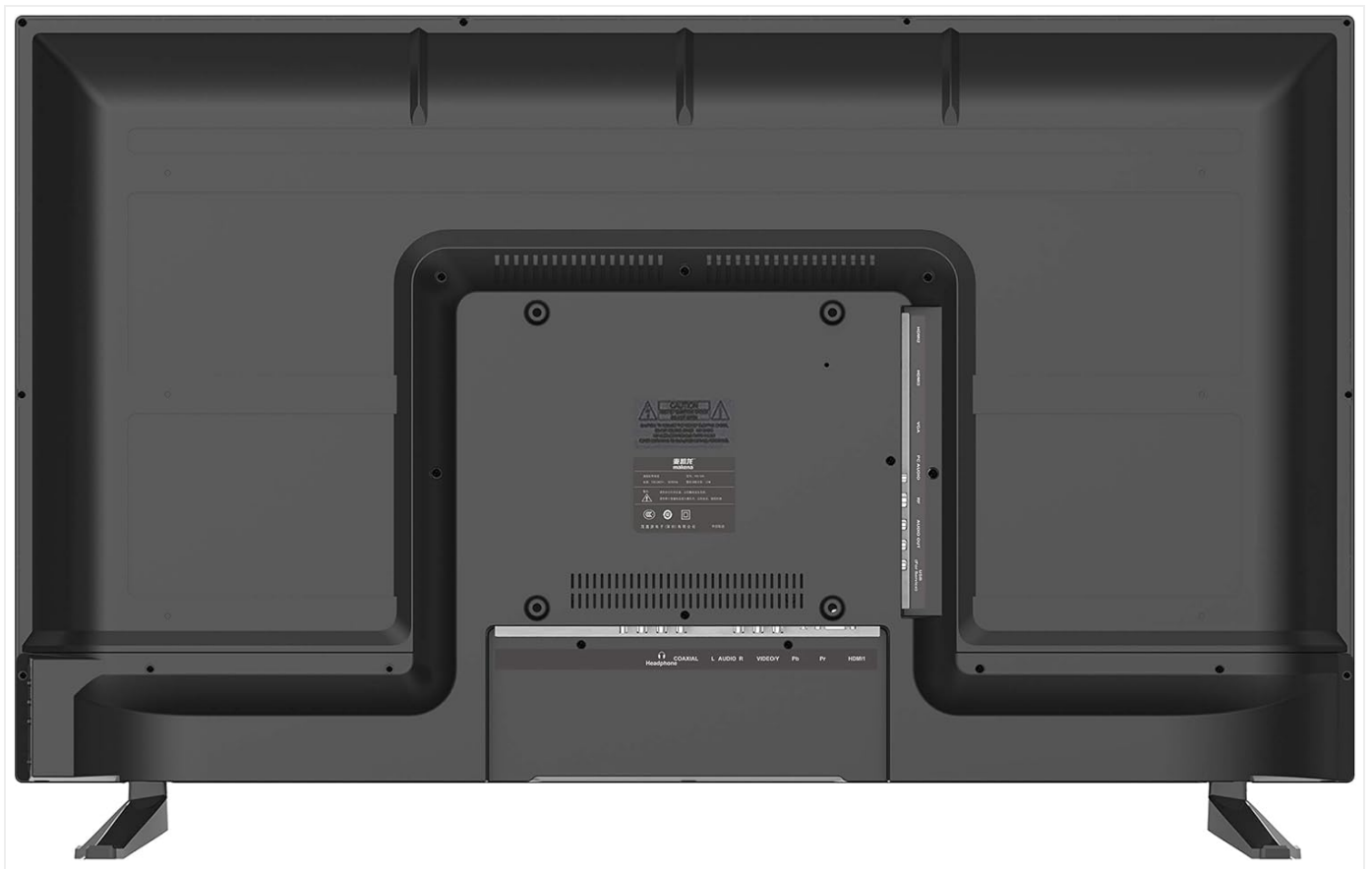
Image: Rear view of the RCA 40" Smart TV, highlighting the VESA mounting holes and various input ports. This view is essential for understanding wall mount compatibility and cable management.