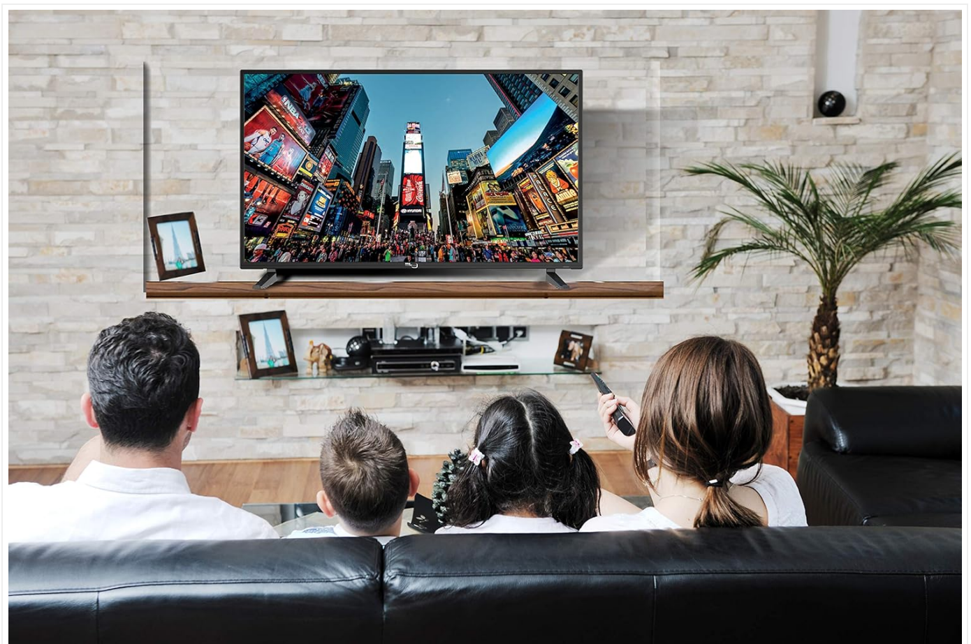
Image: The RCA 40" Smart TV mounted on a wall in a living room, with a family seated on a couch watching content. This image demonstrates the TV in a typical home entertainment setting, highlighting its smart capabilities for family viewing.

Easily access content streaming services like Netflix, YouTube, and Prime Video directly from your TV's home screen. Ensure your TV is connected to the internet for full functionality.