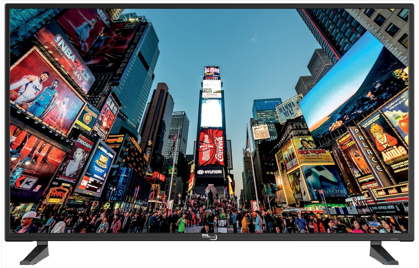
Image: Front view of the RCA 40" Smart TV with its stand attached, displaying a dynamic city scene on the screen. This image illustrates the TV's appearance when set up on a flat surface.

Carefully place the TV screen-down on a soft, clean surface to prevent scratches. Align the stand pieces with the corresponding slots on the bottom of the TV. Secure the stands using the provided screws.