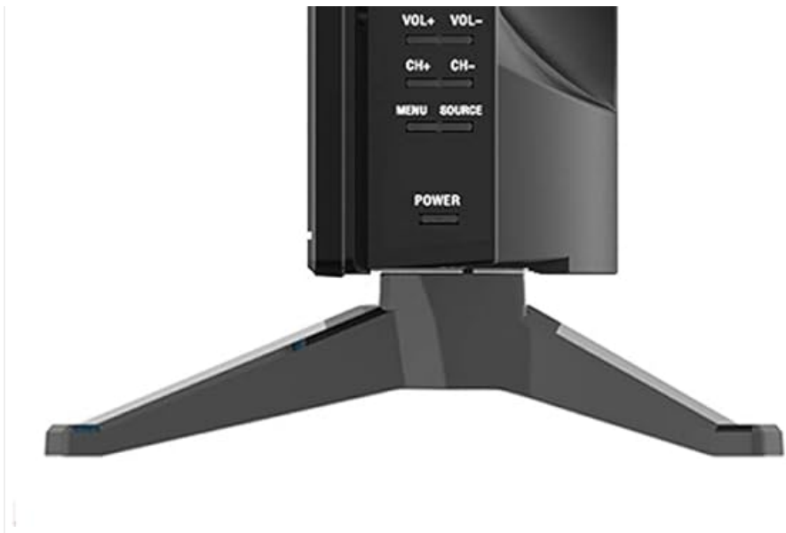
Image: Left side view of the RCA 40" Smart TV, displaying the physical control buttons for volume, channel, menu, source, and power. These buttons provide an alternative way to operate the TV without the remote control.