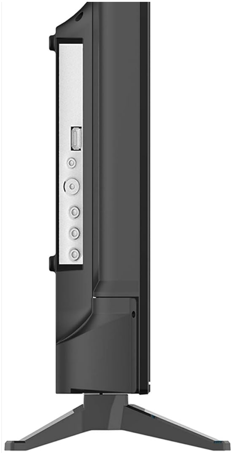
Image: Side view of the RCA 40" Smart TV, illustrating the accessible input ports including HDMI and USB. This image helps users identify where to connect their external devices.