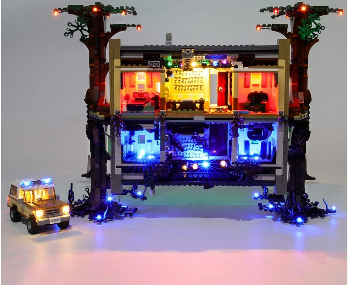
A close-up of the police vehicle from the LEGO 75810 set, with its headlights and taillights illuminated by the GEAMENT light kit.