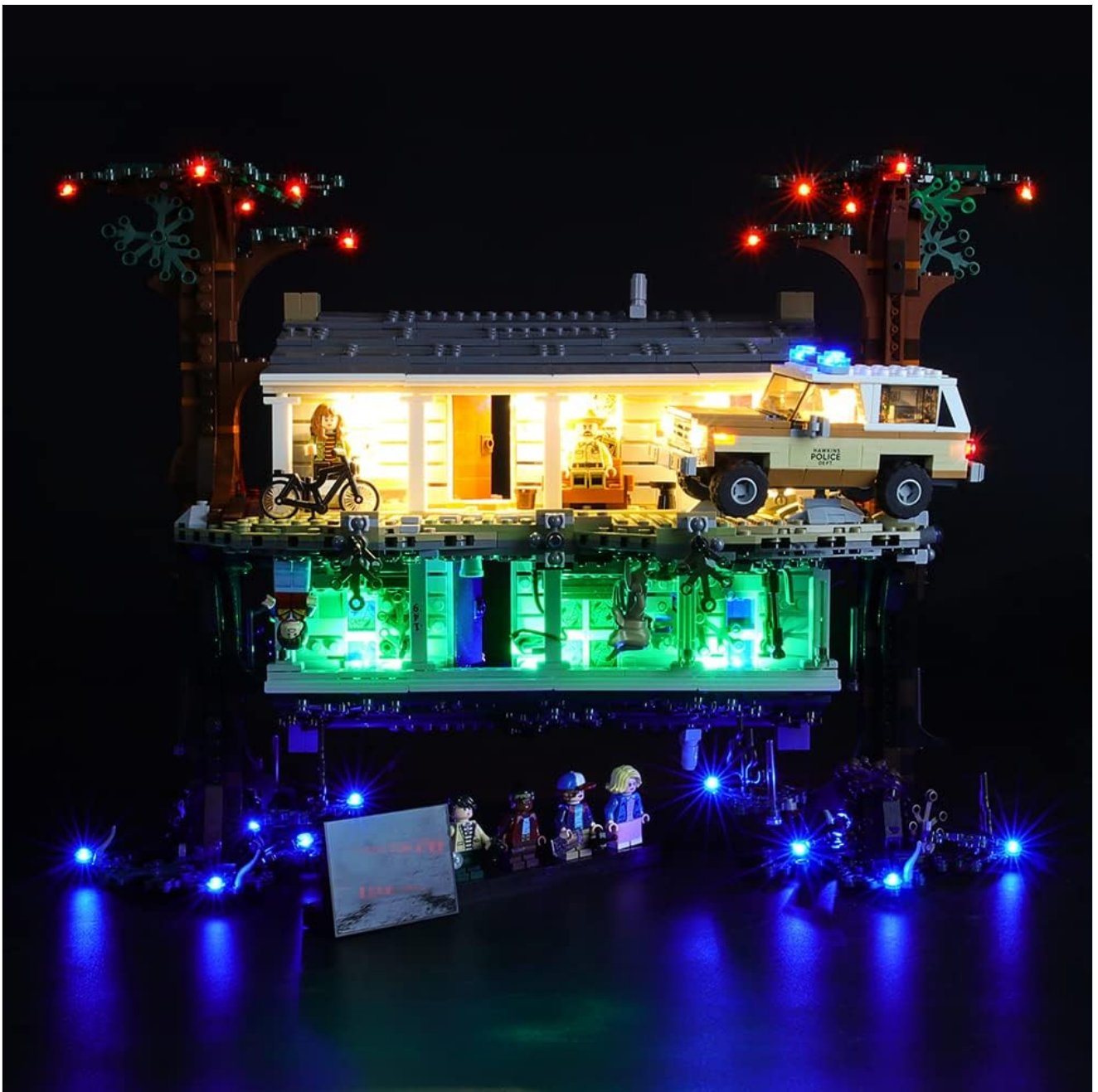
The fully assembled LEGO 75810 Stranger Things The Upside Down model illuminated by the GEAMENT light kit, showing both the regular house and the Upside Down sections with distinct lighting.