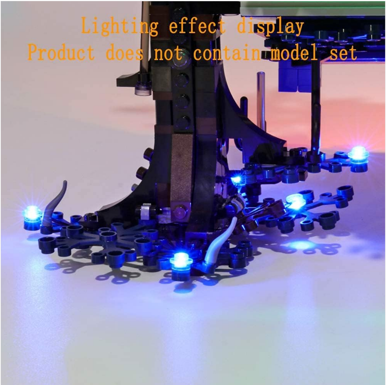
A detailed view of the illuminated tree base and surrounding elements in the Upside Down section of the LEGO 75810 model, showing blue LED lights.