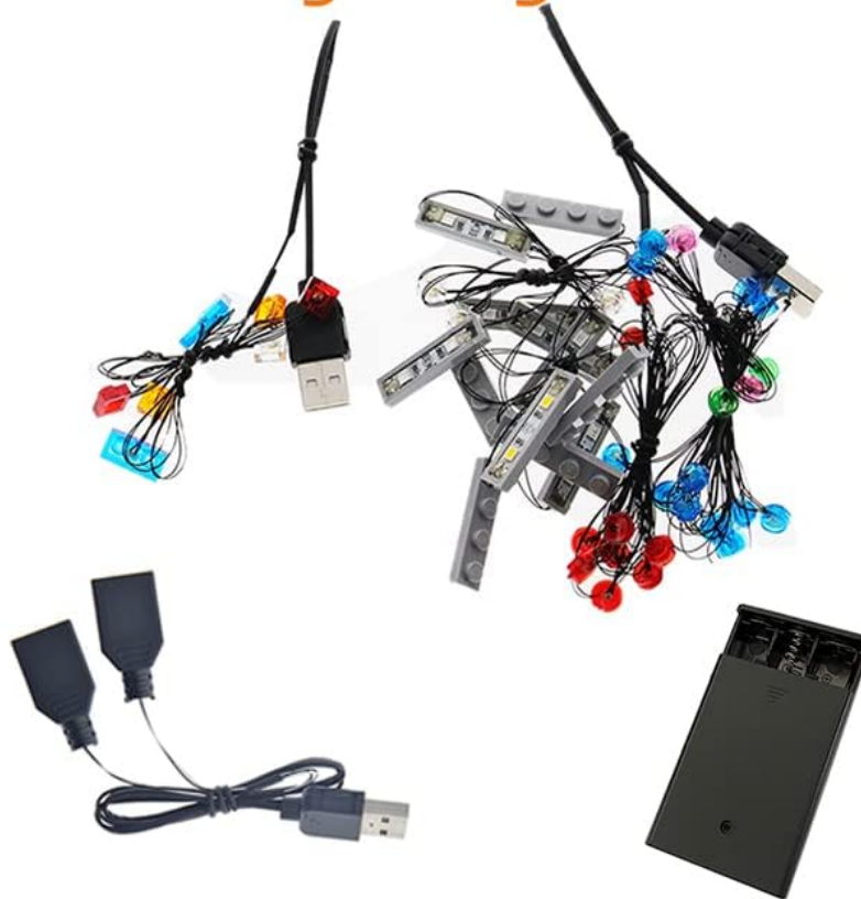
A photograph showing the various components included in the lighting kit, such as LED light strings, connecting cables, and a battery box/USB power connector.

Please note: This product only contains the following items and installation instruction, not LEGO set! Lighting Kit