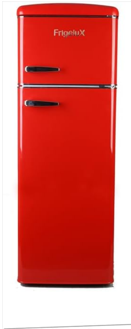
Image 1: Front view of the FrigeluX RFDP246RRA++ Retro Vintage Refrigerator in red.

The appliance is equipped with 3 adjustable feet and 2 wheels for easy positioning and leveling. Adjust the feet to ensure the refrigerator is stable and level, which is crucial for efficient operation and door alignment.