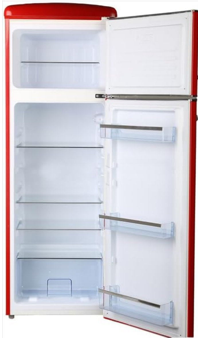
Image 2: Interior view showing glass shelves, door balconies, and vegetable crisper.

The refrigerator compartment has a volume of 194 Liters . It includes 5 adjustable glass shelves , 3 door balconies for bottles and smaller items, and 1 vegetable crisper drawer to keep produce fresh.