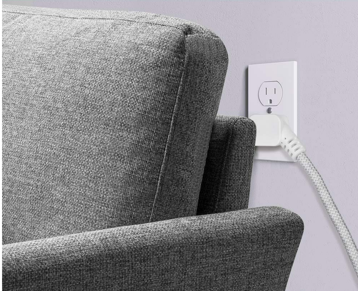
Image: A close-up of the 45-degree angled flat plug inserted into a wall outlet, positioned behind a piece of furniture, illustrating its space-saving design.