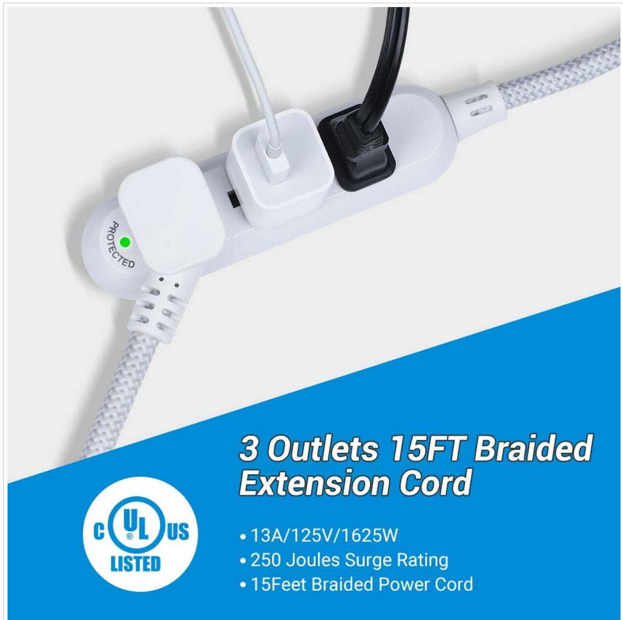
Image: The DEWENWILS 3-Outlet Power Strip with various device plugs inserted, showing the compact design and braided cord. The 'Protected' indicator light is visible.