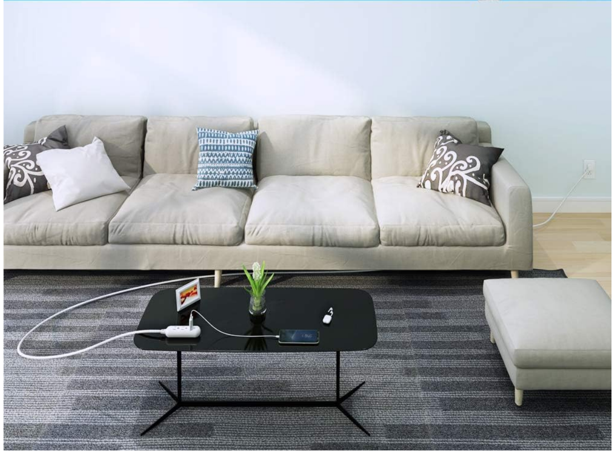
Image: The 15-foot braided extension cord extending from a wall outlet to a power strip on a coffee table in a living room, demonstrating its reach and flexibility.