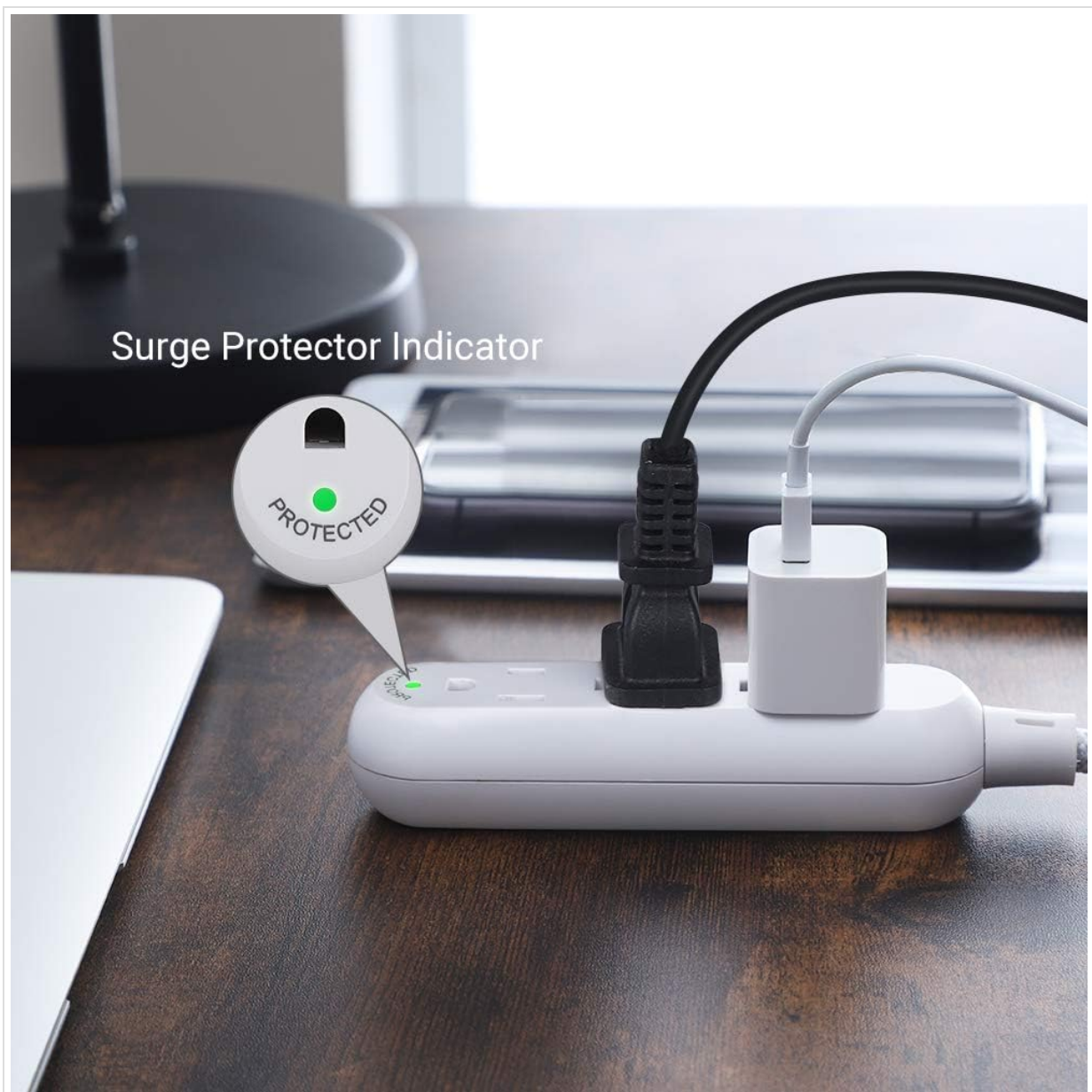
Image: A close-up of the power strip showing the green 'Protected' LED indicator light illuminated, signifying active surge protection.