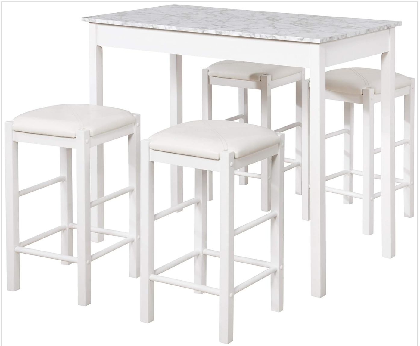
Image: The Linon White 3-Piece Faux Marble Tavern Set positioned in a modern living space, showcasing its compact and functional design.