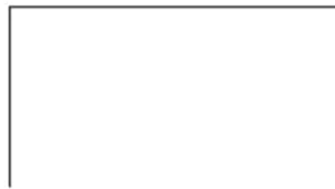
Image: Side view of a stool, illustrating the sturdy solid wood legs in a white painted finish and the backless design.

Sturdy solid wood legs in a white painted finish