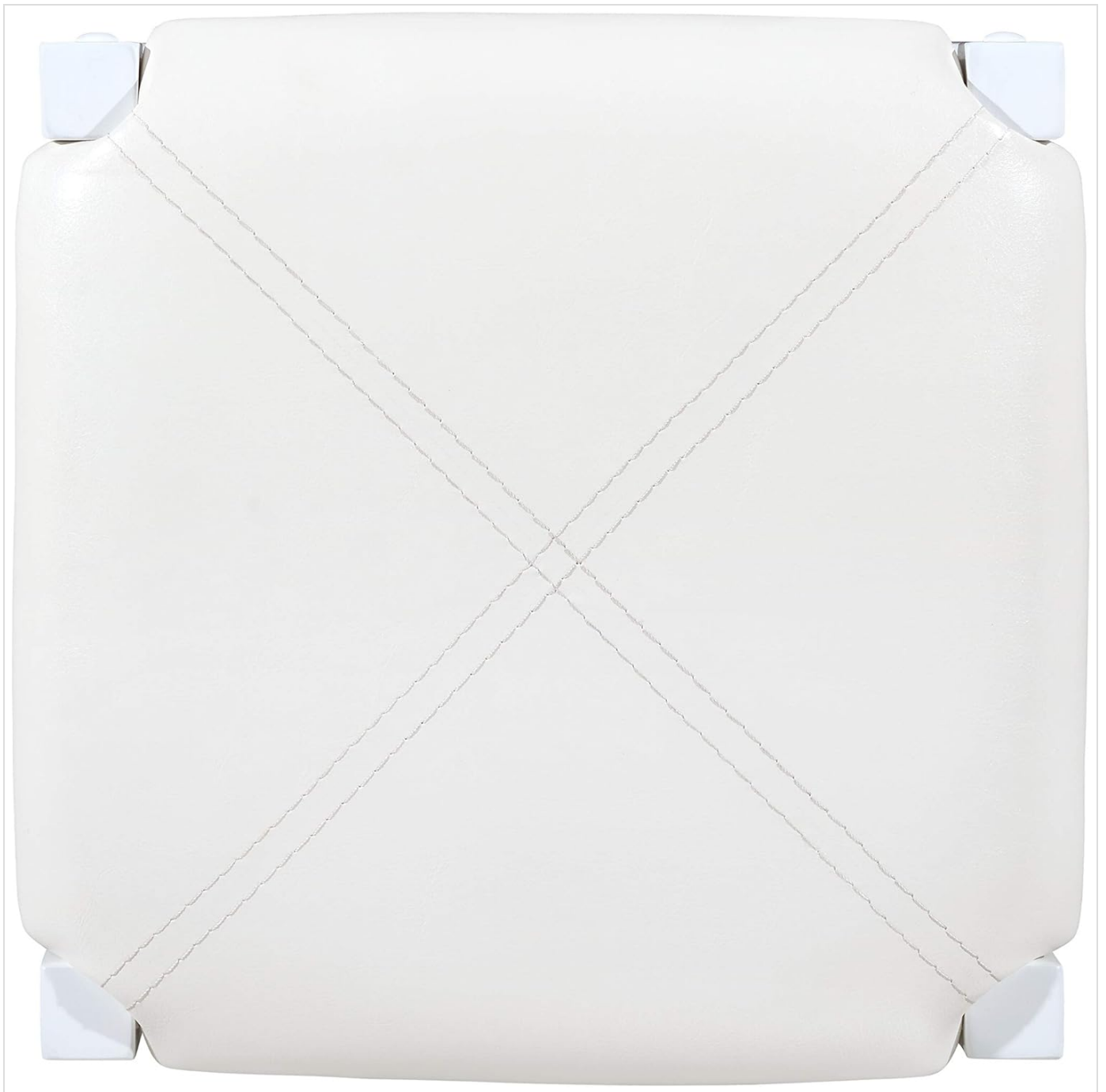
Image: Close-up view of the stool's padded faux leather seat, highlighting the stitching detail.