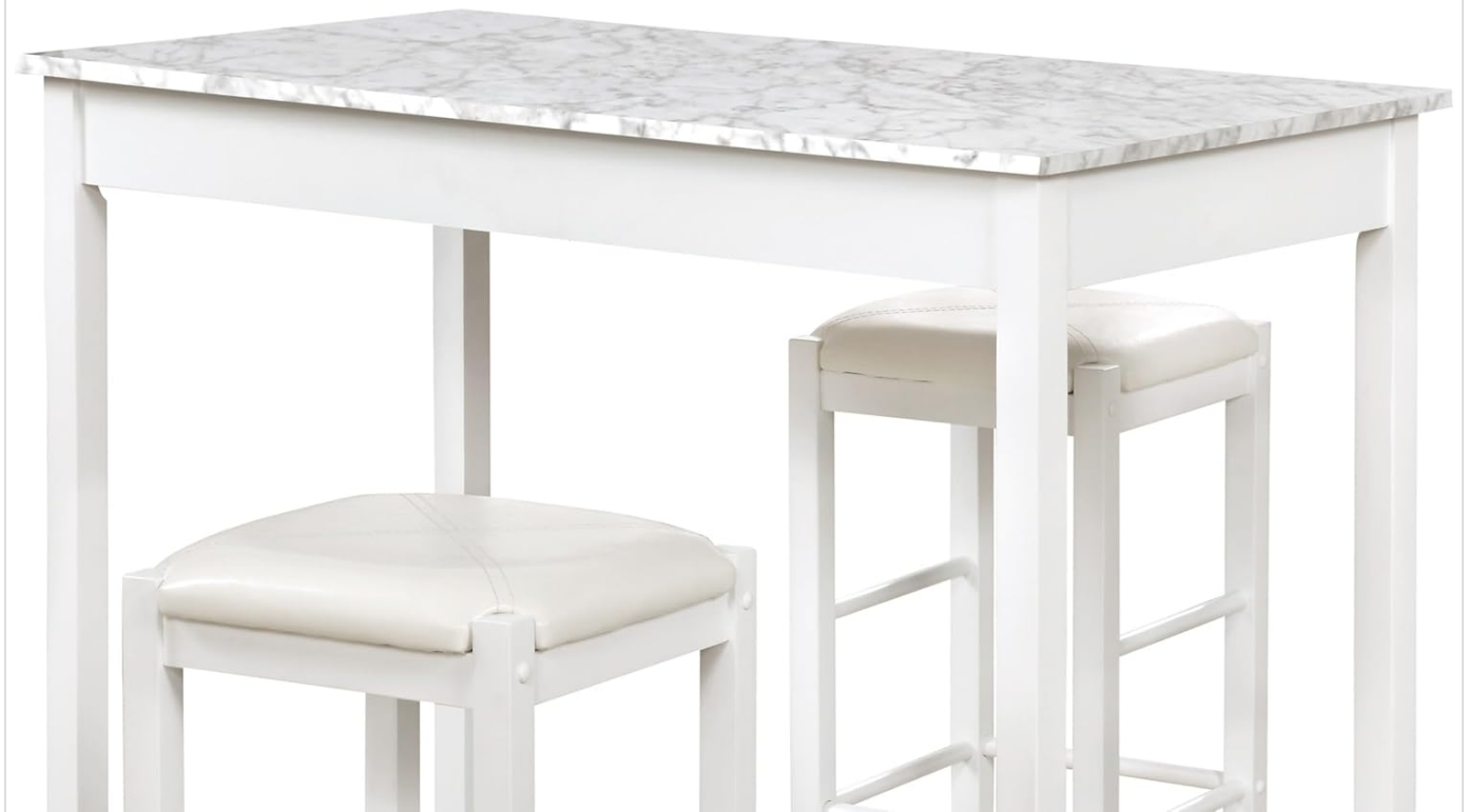
Image: Front view of the Linon White 3-Piece Faux Marble Tavern Set, showing the table and two stools.