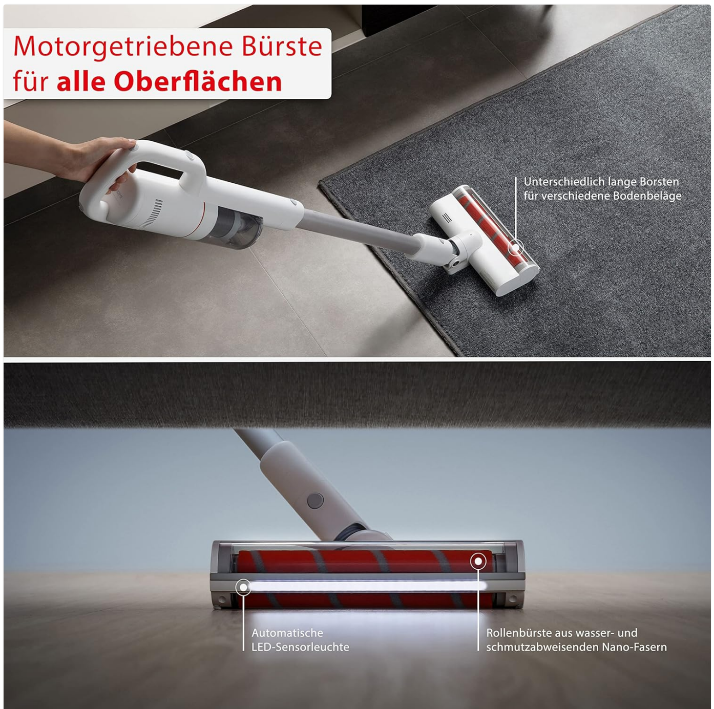
Image: The ROIDMI S2 cordless vacuum in use, showing the motorized floor brush with its automatic LED sensor light illuminating the area in front of it. The brush is designed for various floor types.