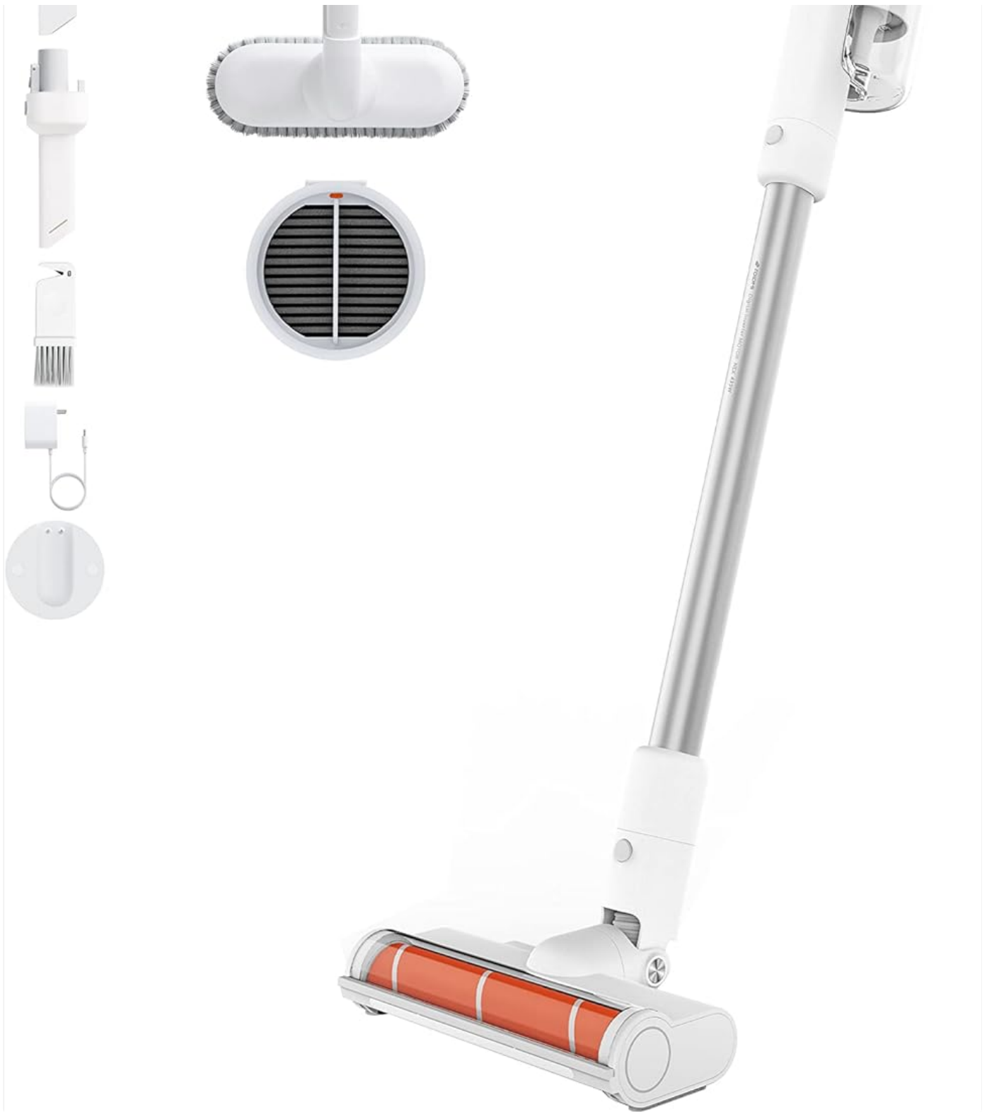
Image: All components included with theROIDMI S2 Cordless Vacuum Cleaner, laid out on a white background. This includes the main vacuum unit, extension wand, floor brush, various nozzles, and the magnetic wall mount.

Verify that all items are present and in good condition: