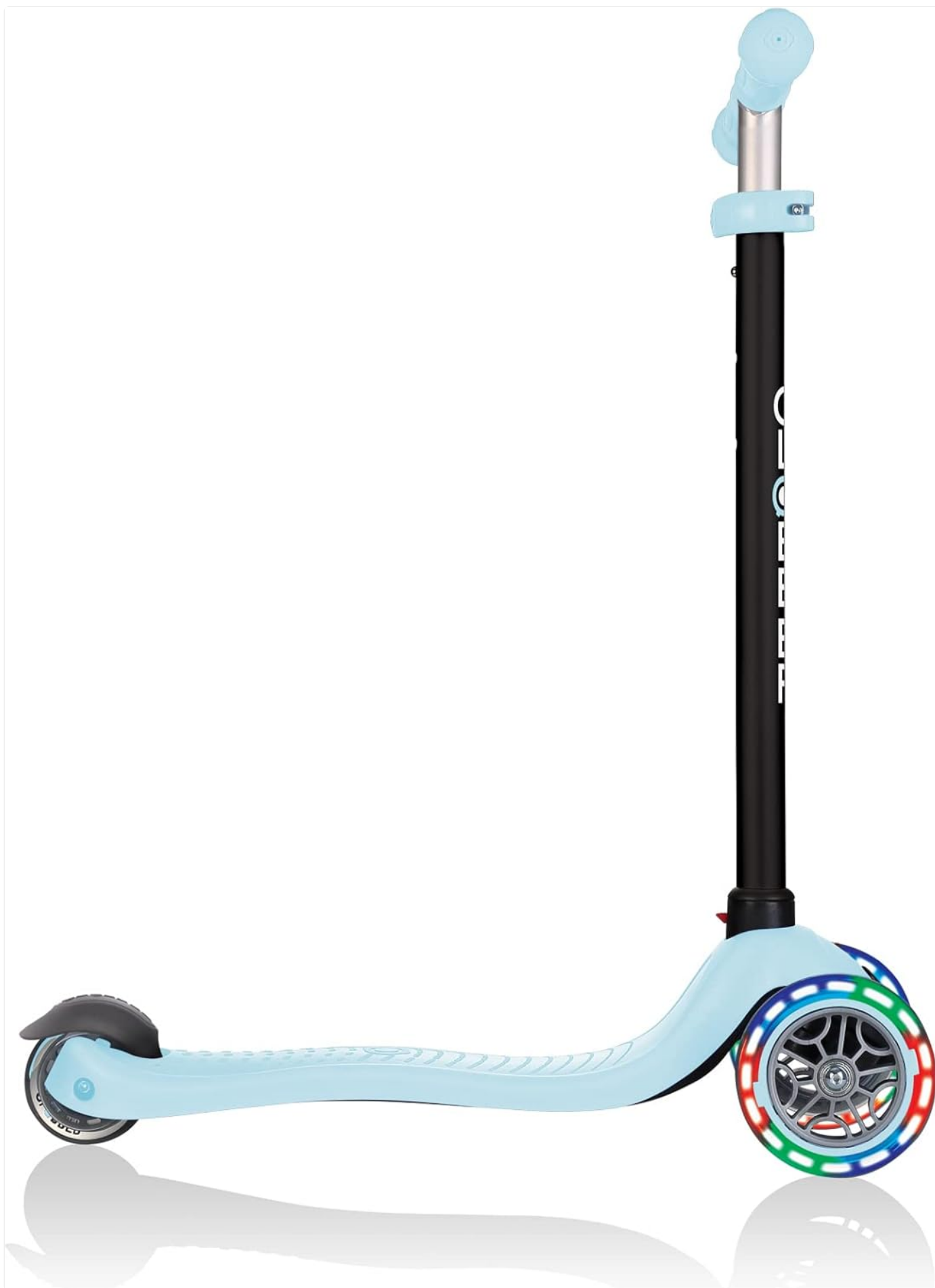
Image: Side view of the Globber GO.UP Sporty Lights in scooter mode, showing the full profile of the deck and wheels.