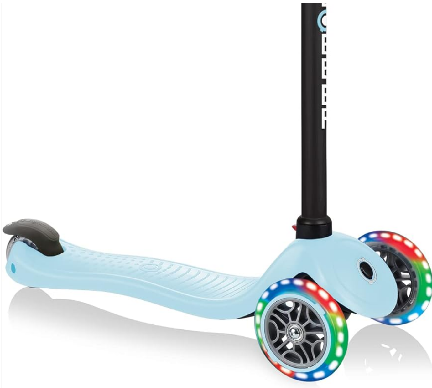
Image: The Globber GO.UP Sporty Lights configured as a three-wheeled scooter, showing the height-adjustable T-bar handlebar.