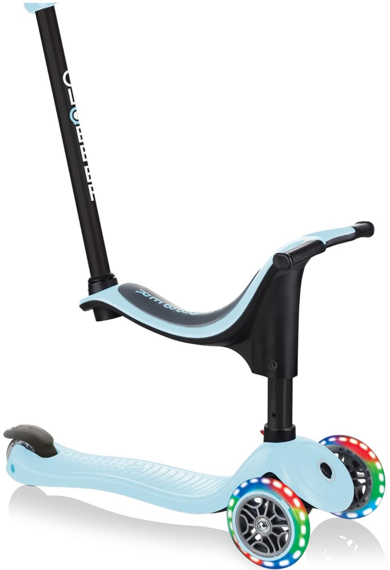
Image: The Globber GO.UP Sporty Lights in its ride-on configuration, featuring a seat, parental handle, and light-up wheels. This mode is suitable for younger children.