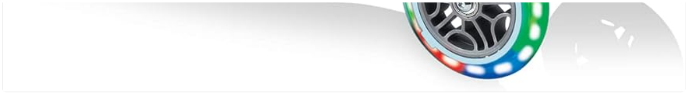
Image: Front view of the Globber GO.UP Sporty Lights in scooter mode, showcasing the T-bar handlebar and the light-up front wheels.