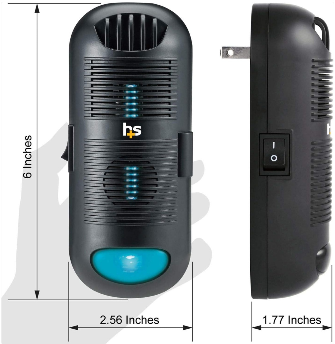
Figure 5: Product dimensions.