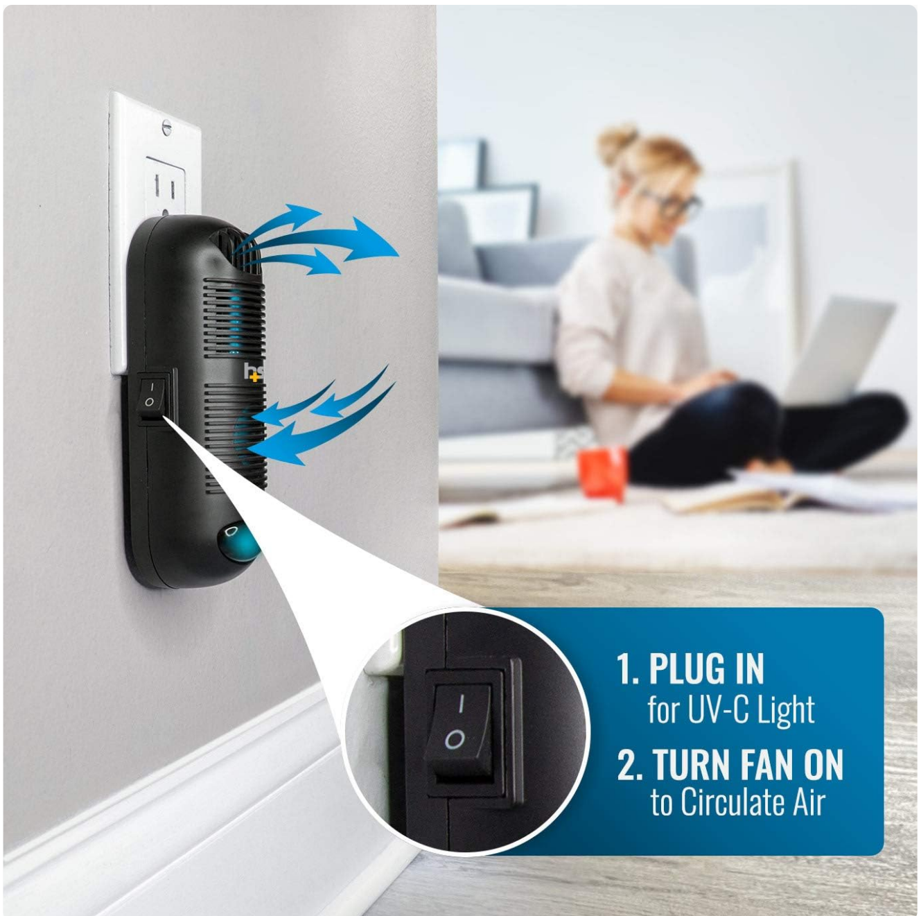
Figure 3: Plugging in the unit and activating the fan.