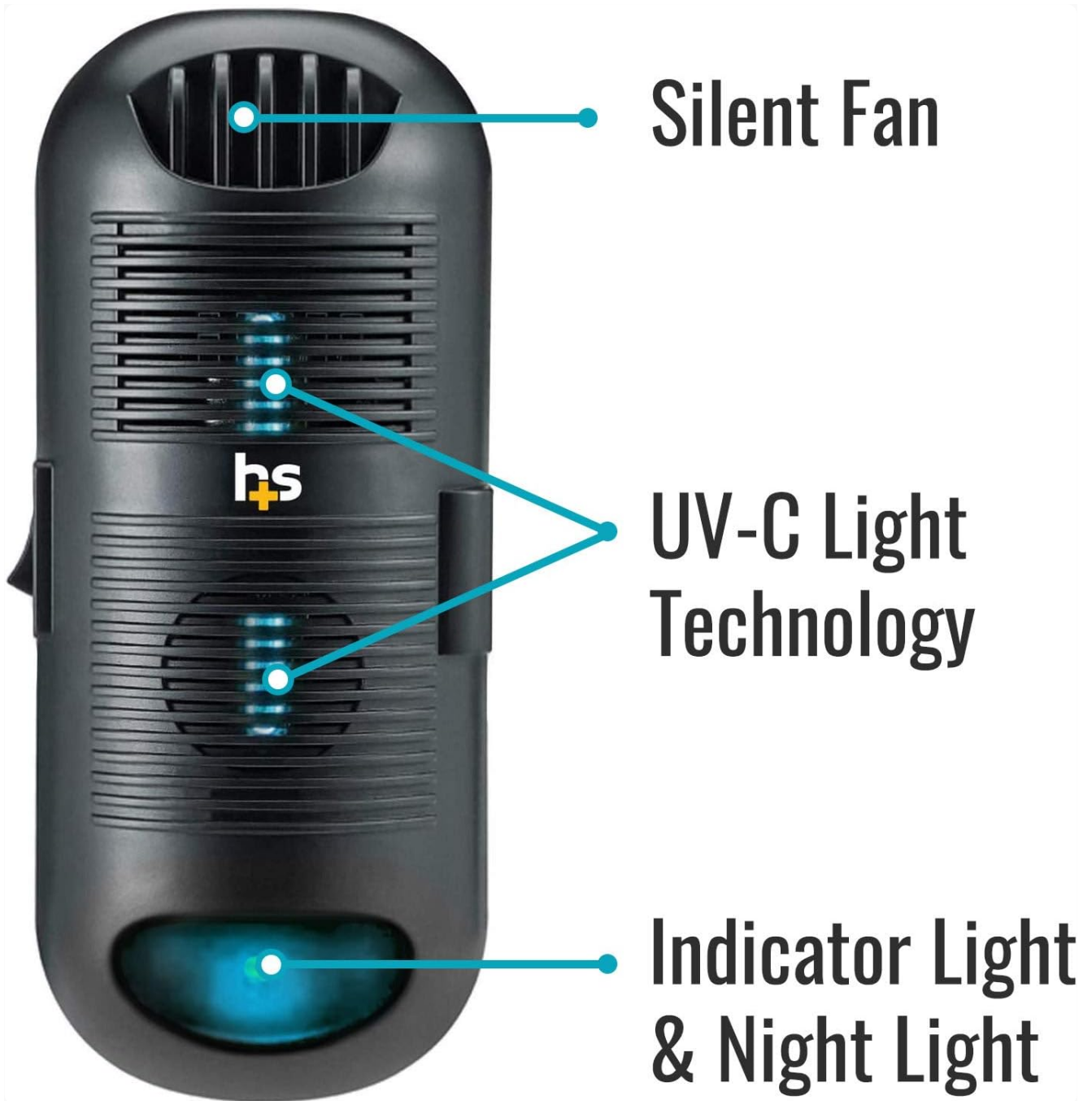
Figure 2: Key features of the HealthSmart Air Purifier.