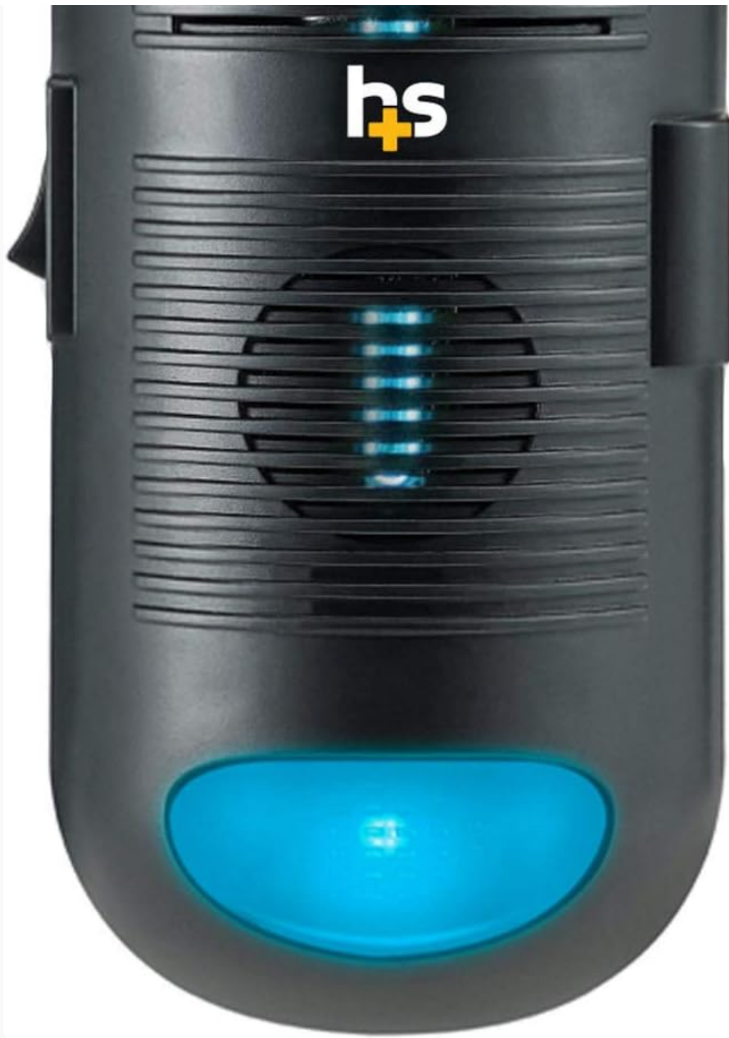
Figure 1: Front view of the HealthSmart Air Purifier and Air Sanitizer.