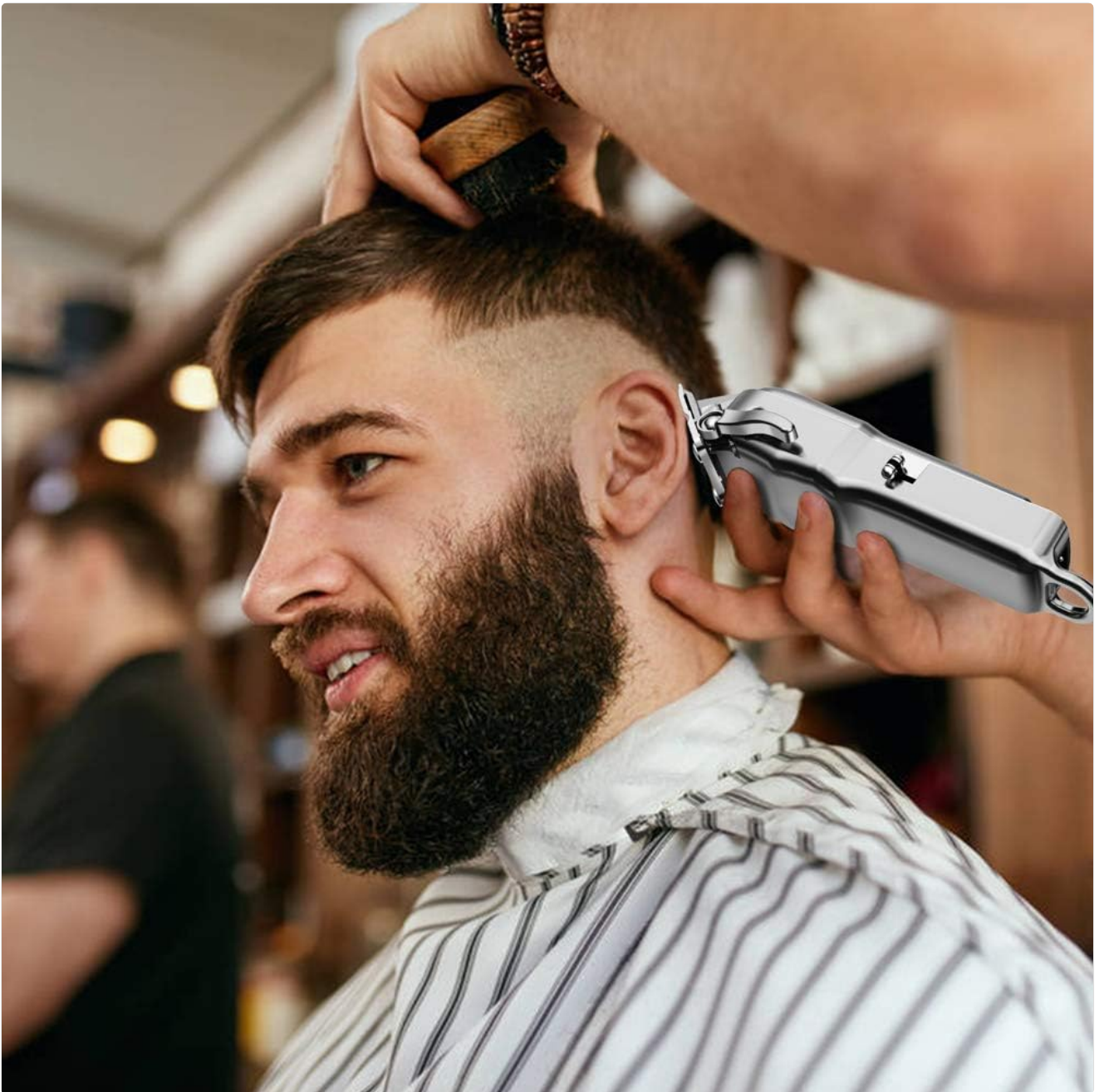
Image: A man receiving a haircut using the AIBORS Hair Clipper, demonstrating typical usage.