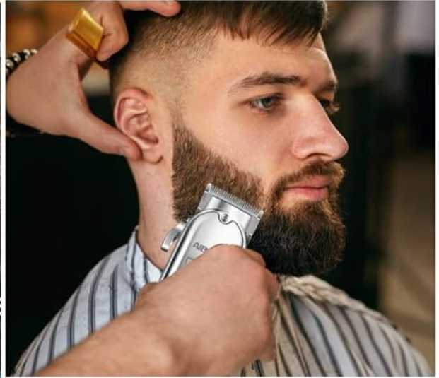
Image: Demonstrates the clipper's versatility for both corded and cordless operation, suitable for different grooming needs.