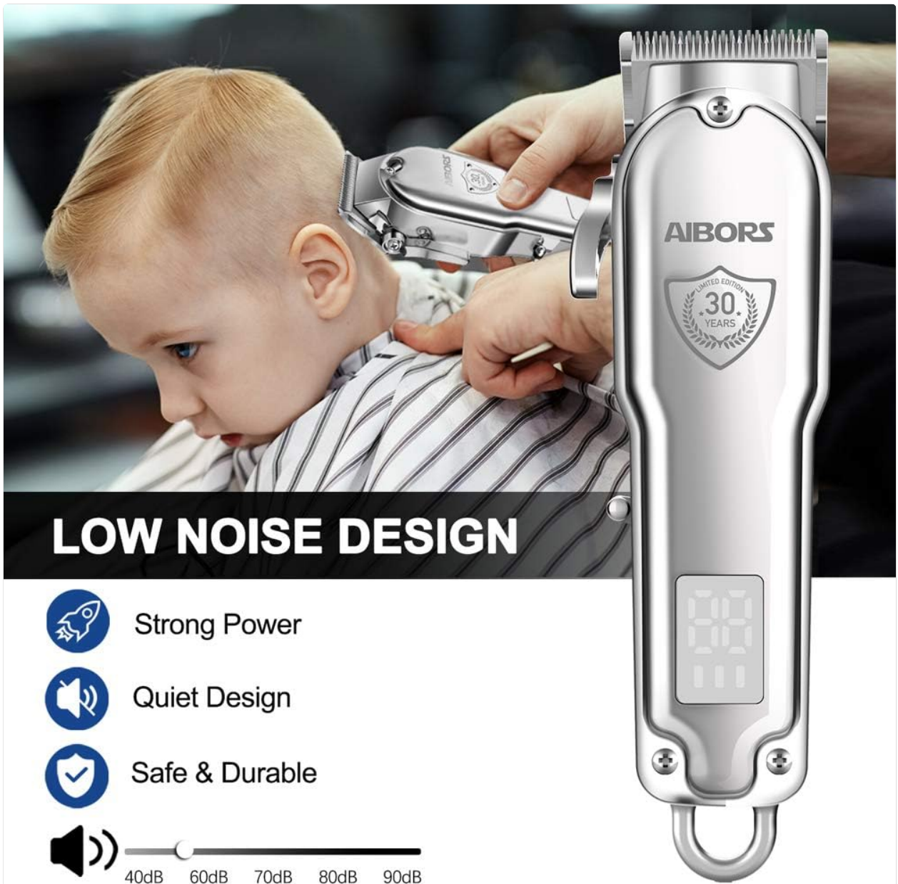
Image: The clipper in use on a child, demonstrating its quiet operation and suitability for sensitive users.