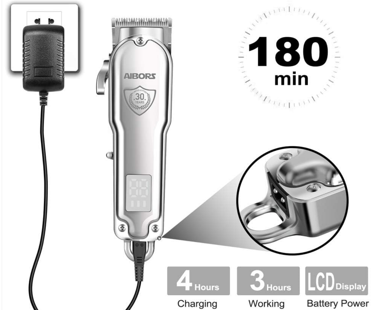
Image: The clipper connected to its charging cord, illustrating the charging process and the "HUGE CAPACITY BATTERY" feature.