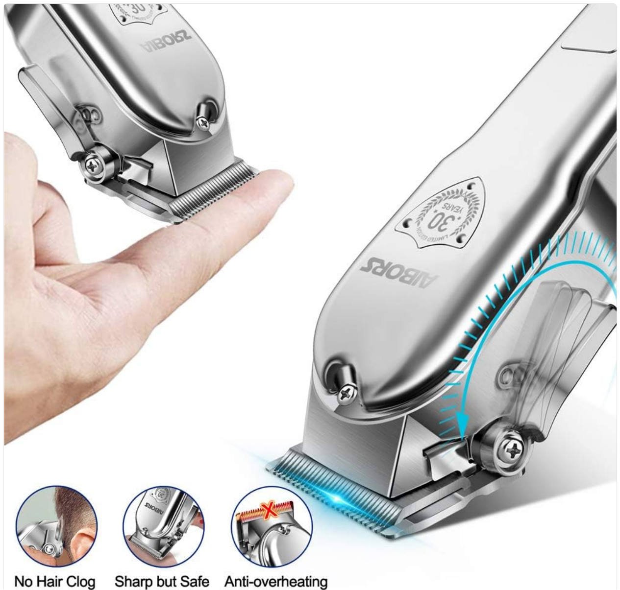
Image: Detailed view of the clipper's blade, highlighting features like no hair clogging, sharpness, and anti-overheating design.