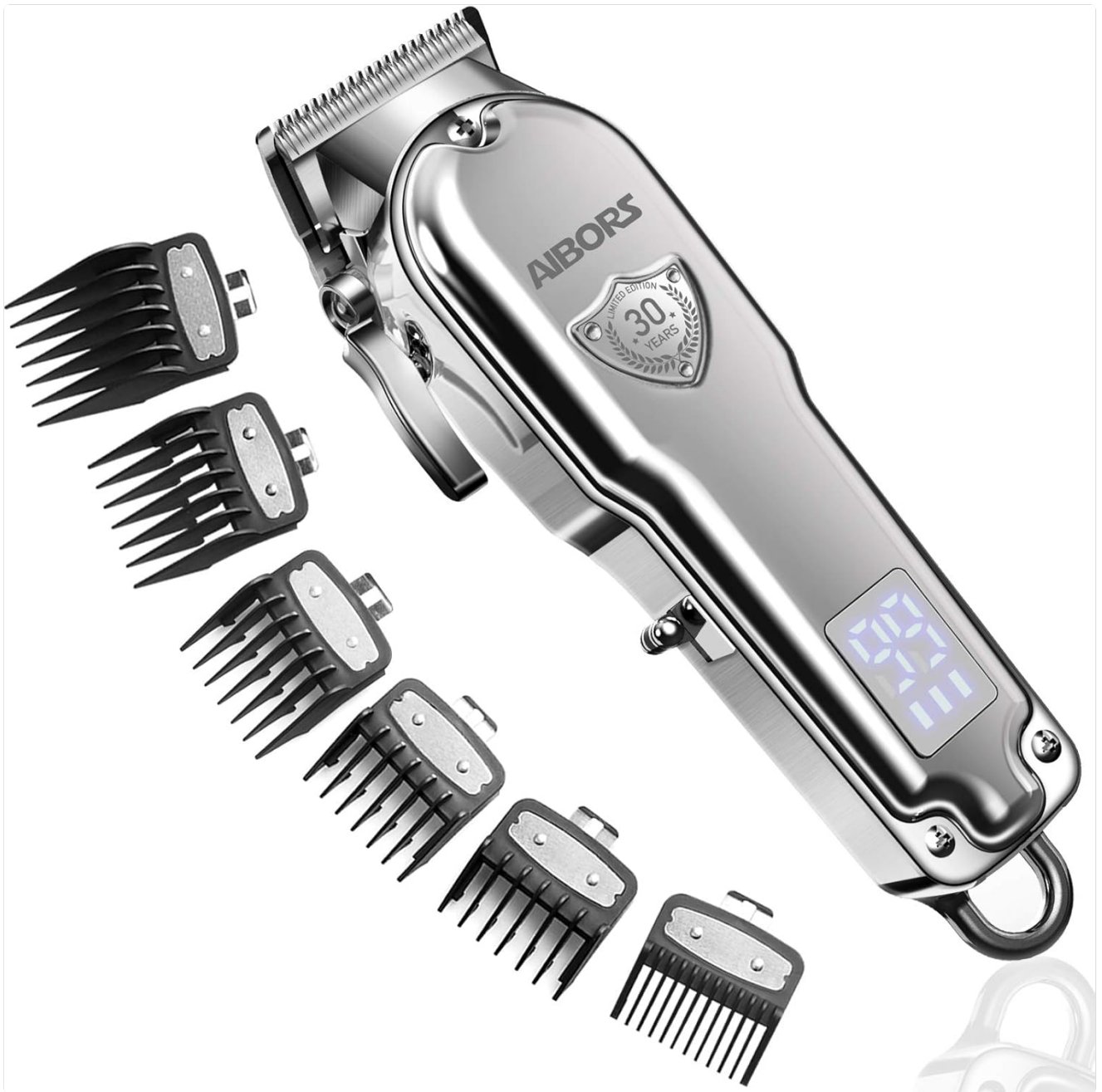
Image: The AIBORS Professional Hair Clippers, showcasing the main unit and the included set of guide combs.