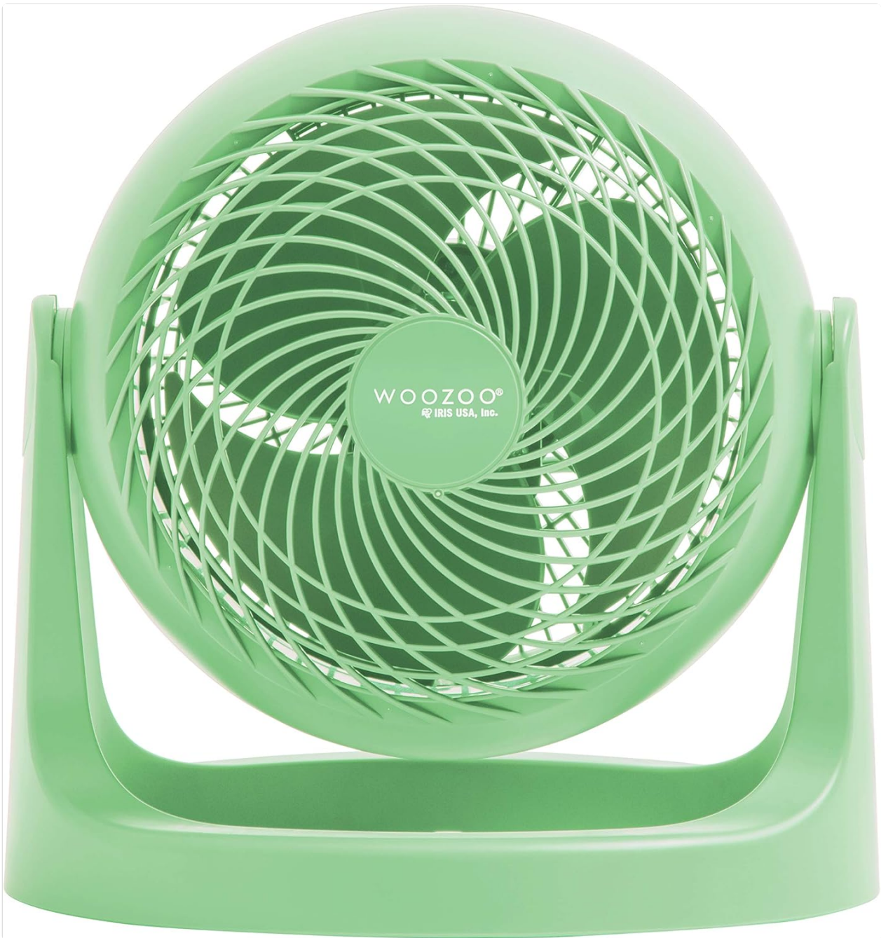
Figure 1: IRIS USA WOOZOO Desk Fan (Green)

This image displays the front view of the green WOOZOO desk fan, highlighting its spiral grille and compact design.