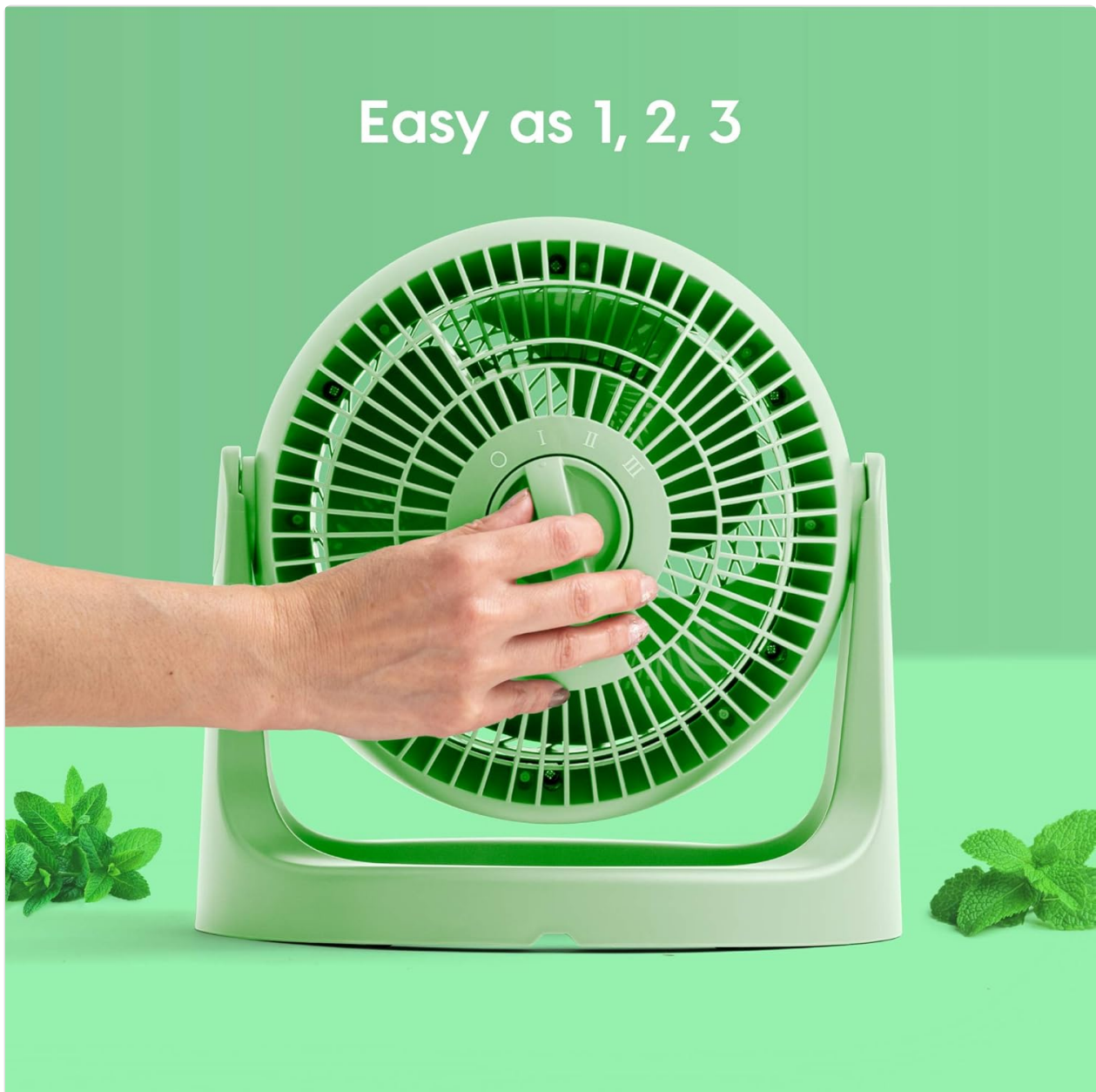
Figure 3: Control Knob for Power and Speed

This image shows a hand turning the control knob on the back of the WOOZOO fan, illustrating the easy adjustment of speed settings (O, I, II, III).