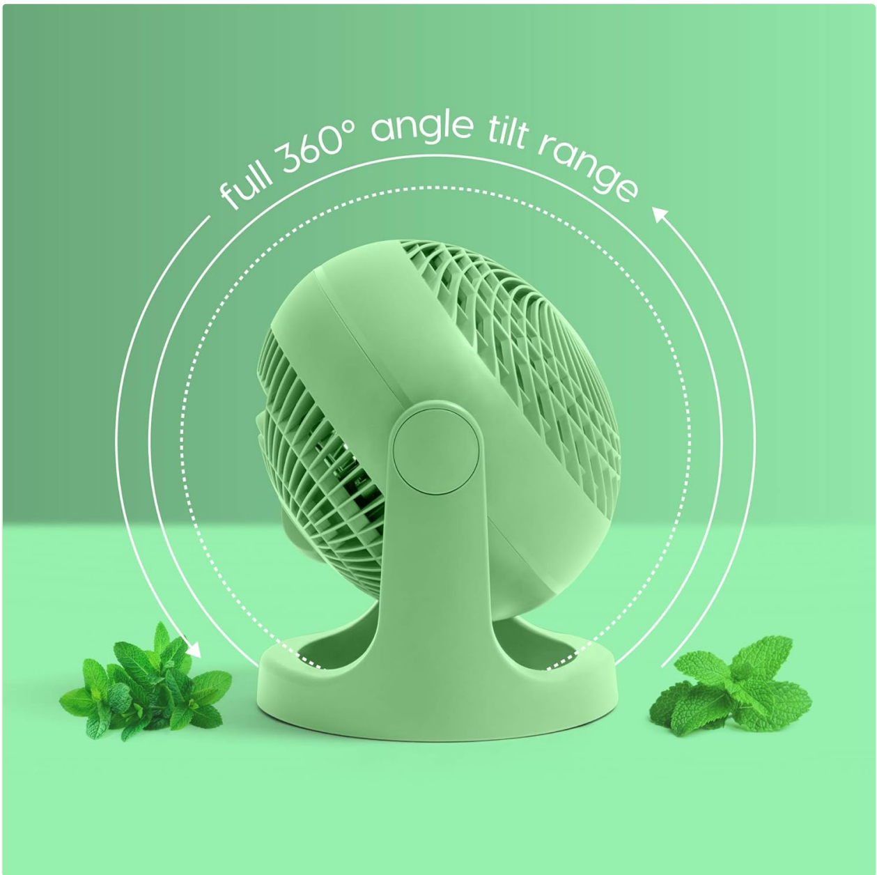
Figure 4: 360° Adjustable Tilt Feature

This image illustrates the WOZZOO fan's ability to tilt a full 360 degrees, with arrows indicating the range of motion.