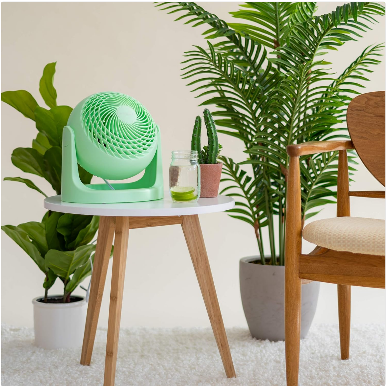
Figure 2: Example Placement of the WOOZOO Desk Fan

This image shows the green WOOZOO fan placed on a small white table next to indoor plants, demonstrating suitable placement in a living environment.