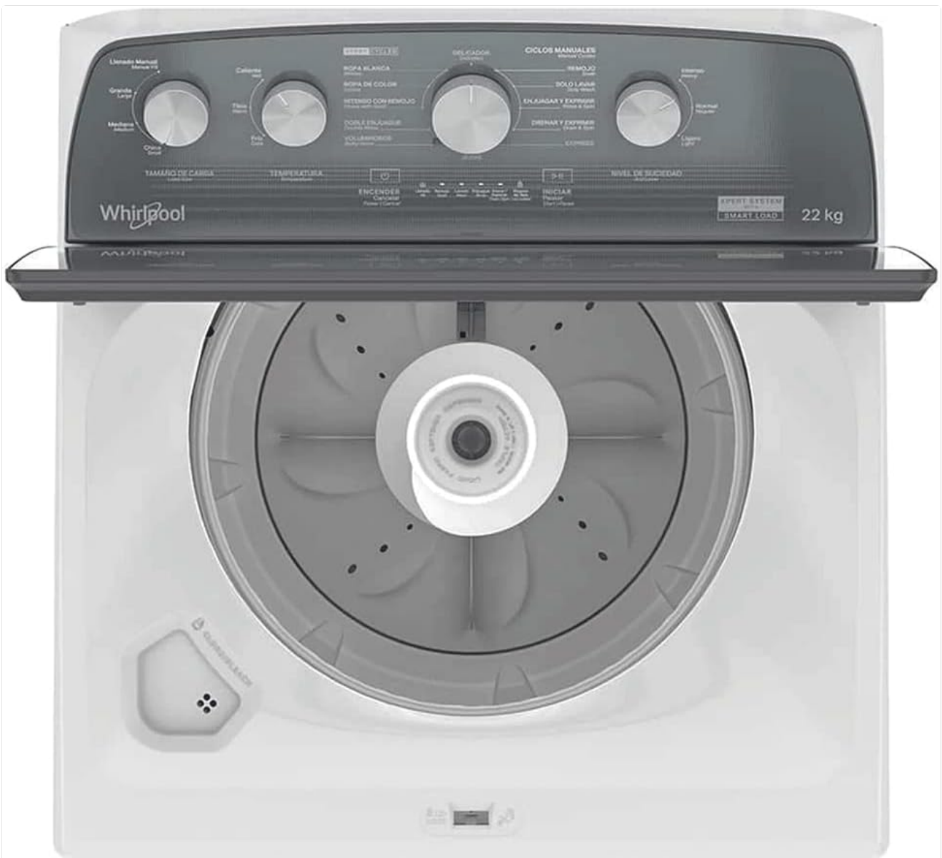
Figure 3.2: Top view showing the wash basket and agitator.