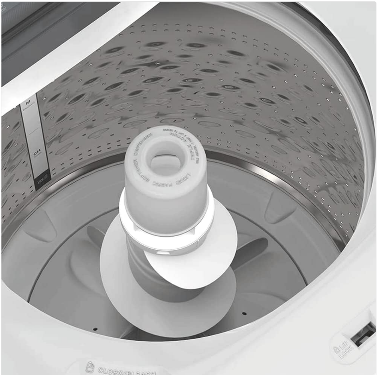
Figure 3.3: Inside the drum, highlighting the agitator and dispenser area.