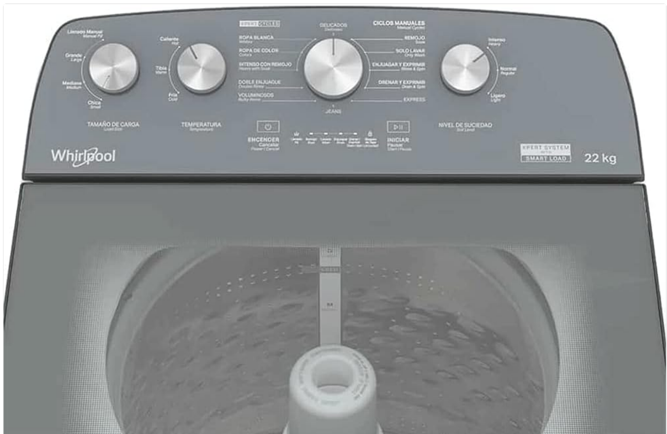
Figure 3.1: Control panel of the washing machine.