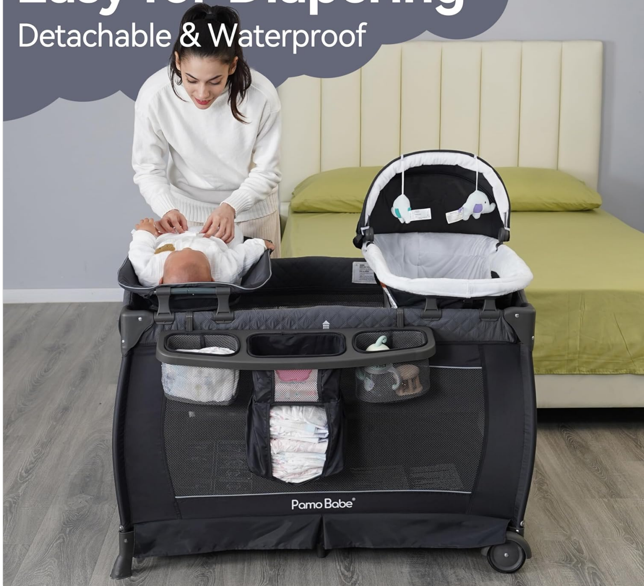
Figure 6: Easy for Diapering.