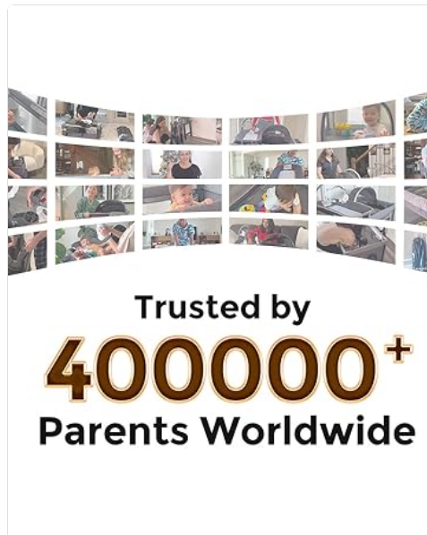
Figure 2: Pamo Babe Certified Safety.