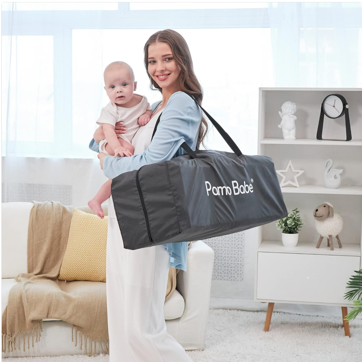
Figure 8: Portable Carrying Bag.