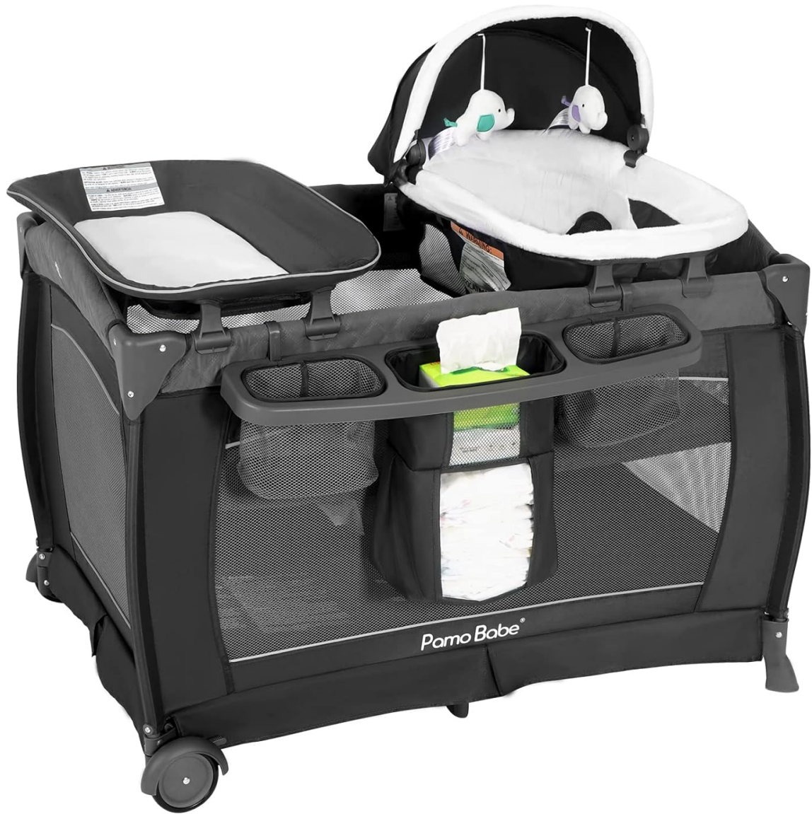
Figure 1: Pamo Babe Playard with all 4-in-1 components.