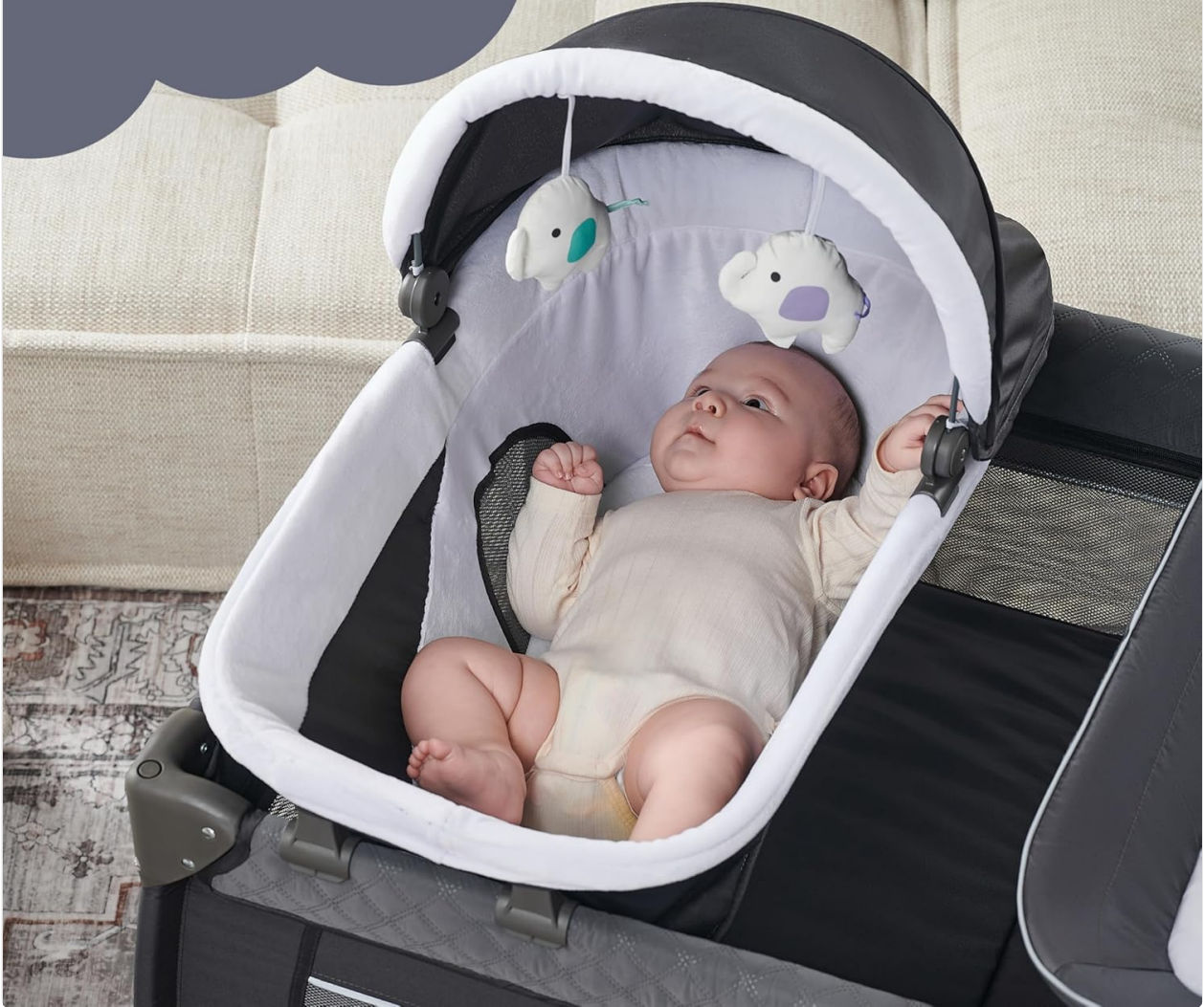
Figure 4: Newborn Bassinet (Sleep Nest).