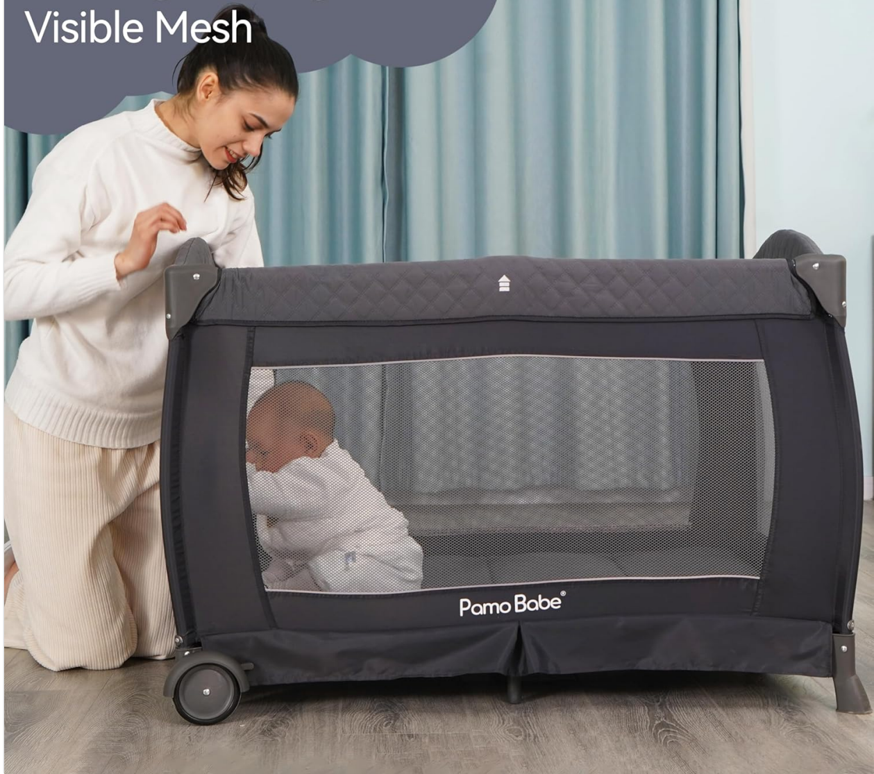
Figure 7: Baby Playard with Visible Mesh.