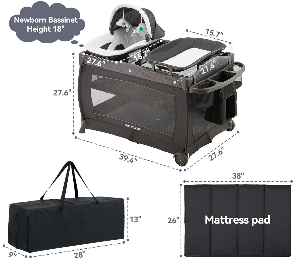
Figure 9: Product Size and Dimensions.