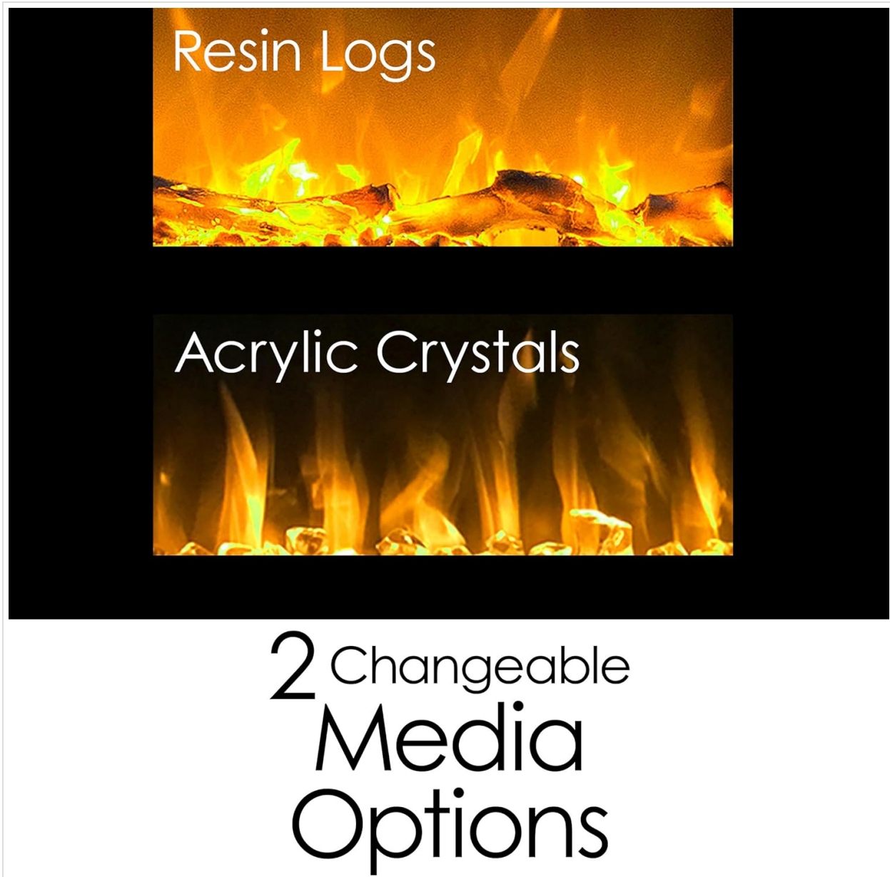
Figure 4: Faux Logs and Acrylic Crystals Media Options.

Choose between the provided faux logs or acrylic crystals to customize the flame bed appearance. Carefully place your chosen media into the designated area within the fireplace unit according to the detailed instructions in the full product manual.