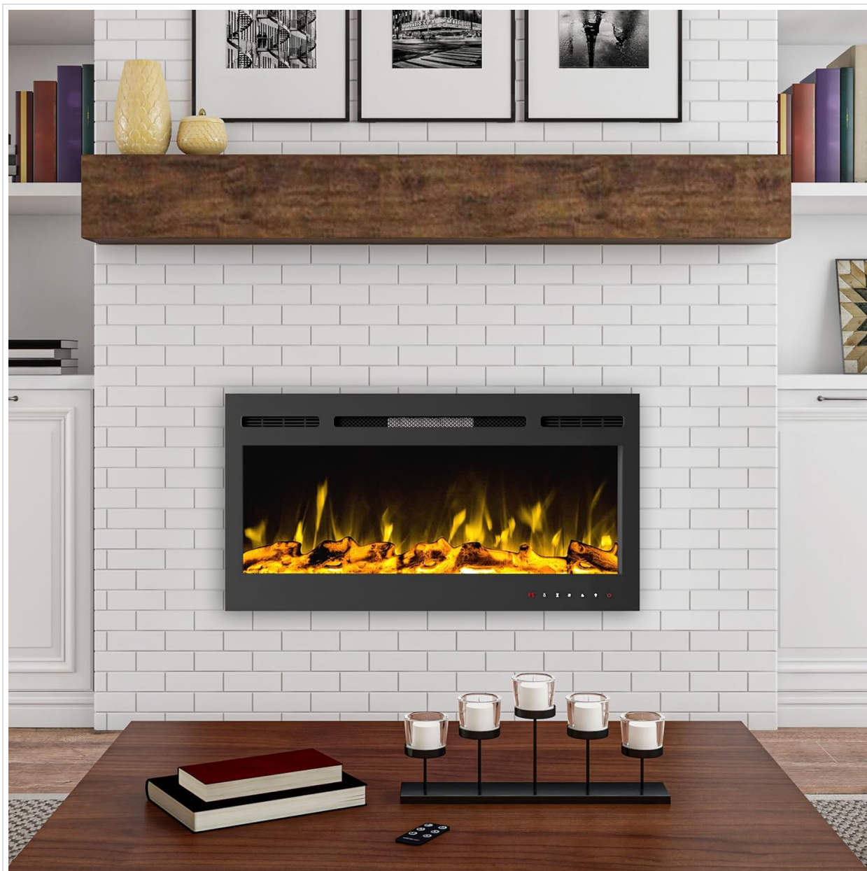
Figure 1: Northwest 36-Inch Wall Mounted Electric Fireplace in a living room.