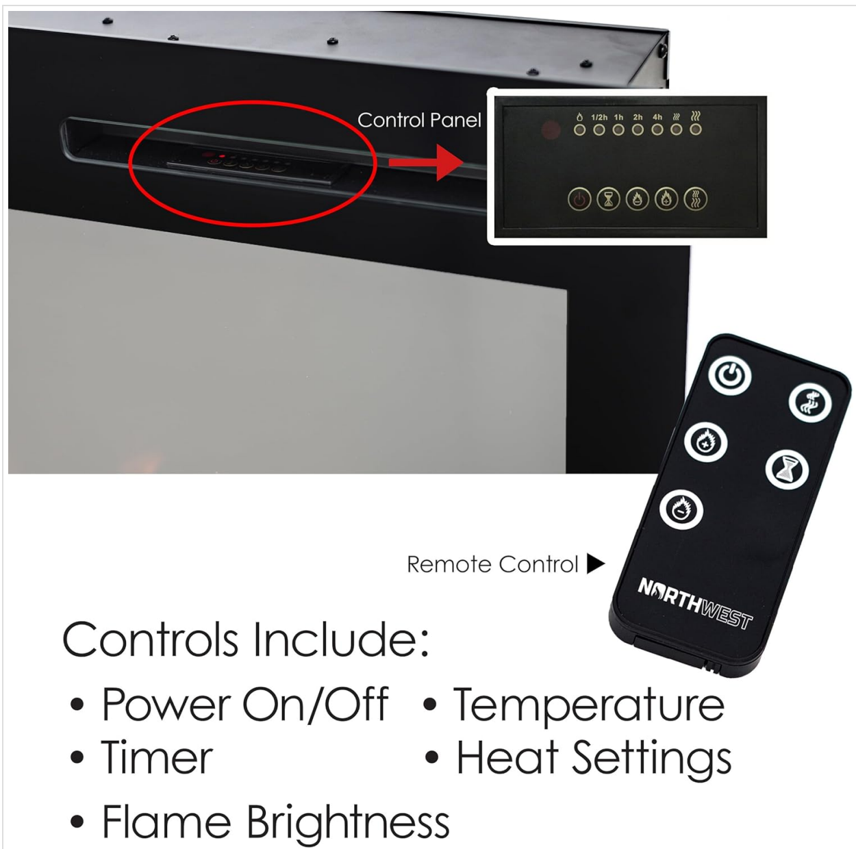
Figure 5: Control Panel and Remote Control.