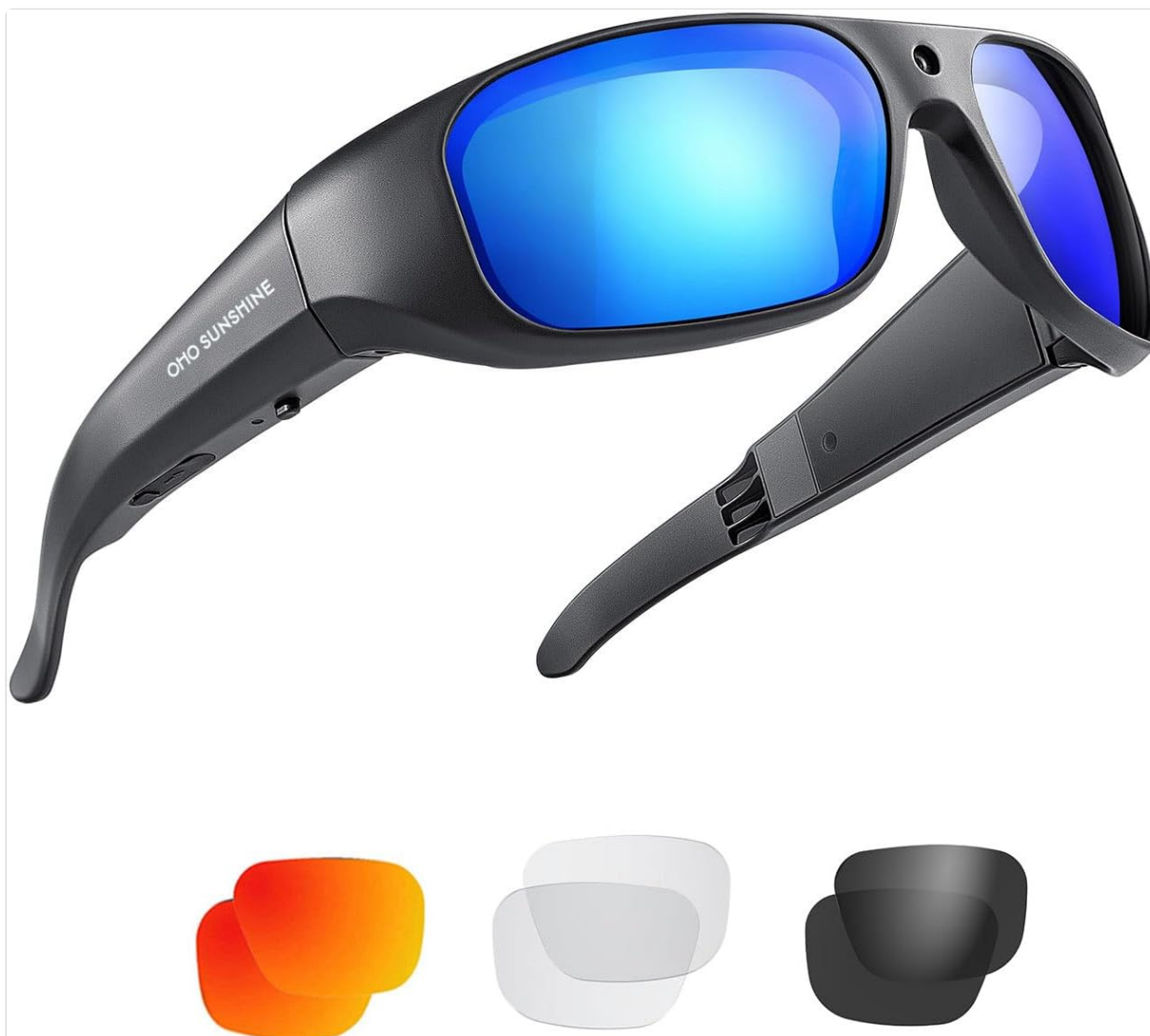
The OhO 4K 256GB Ultra HD Water-Resistant Action Camera Sports Sunglasses, shown with additional interchangeable

Thank you for choosing the OhO 4K 256GB Ultra HD Water-Resistant Action Camera Sports Sunglasses. These innovative sunglasses are designed to capture high-quality video and photos while keeping your hands free, making them ideal for various sports and outdoor activities. Featuring a built-in 4K camera, 256GB of internal memory, and UV400 polarized lenses, they offer a convenient and durable solution for recording your adventures.