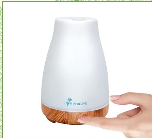
4. Press the MIST button