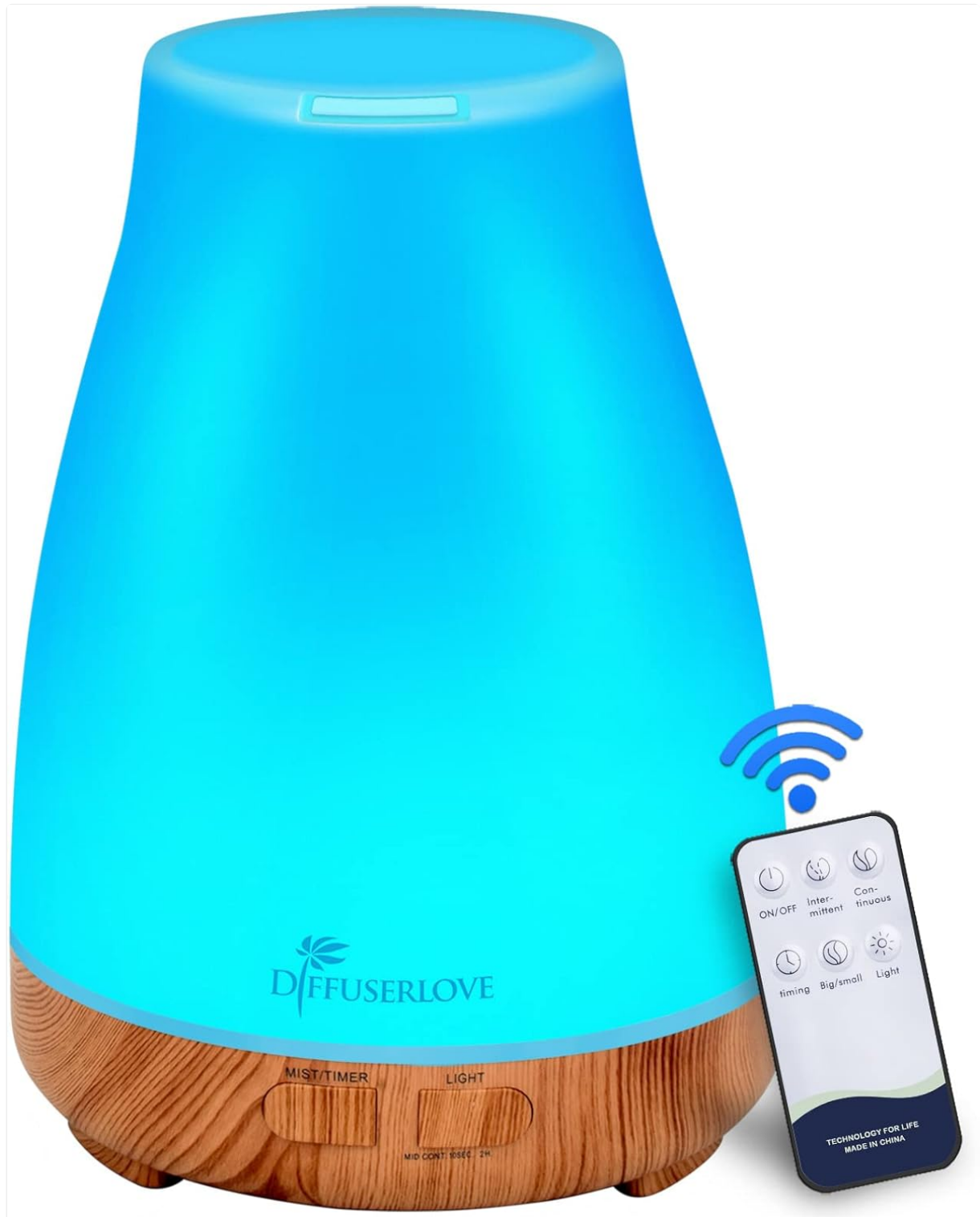
Figure 4.1: Diffuserlove 300ML Essential Oil Diffuser with included remote control.

Familiarize yourself with the components of your Diffuserlove Essential Oil Diffuser.