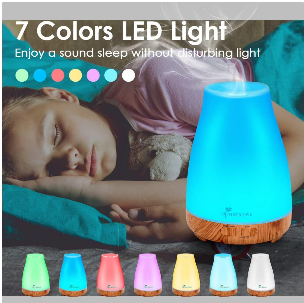
Figure 6.1: The diffuser offers 7 different LED light colors to create various atmospheres.