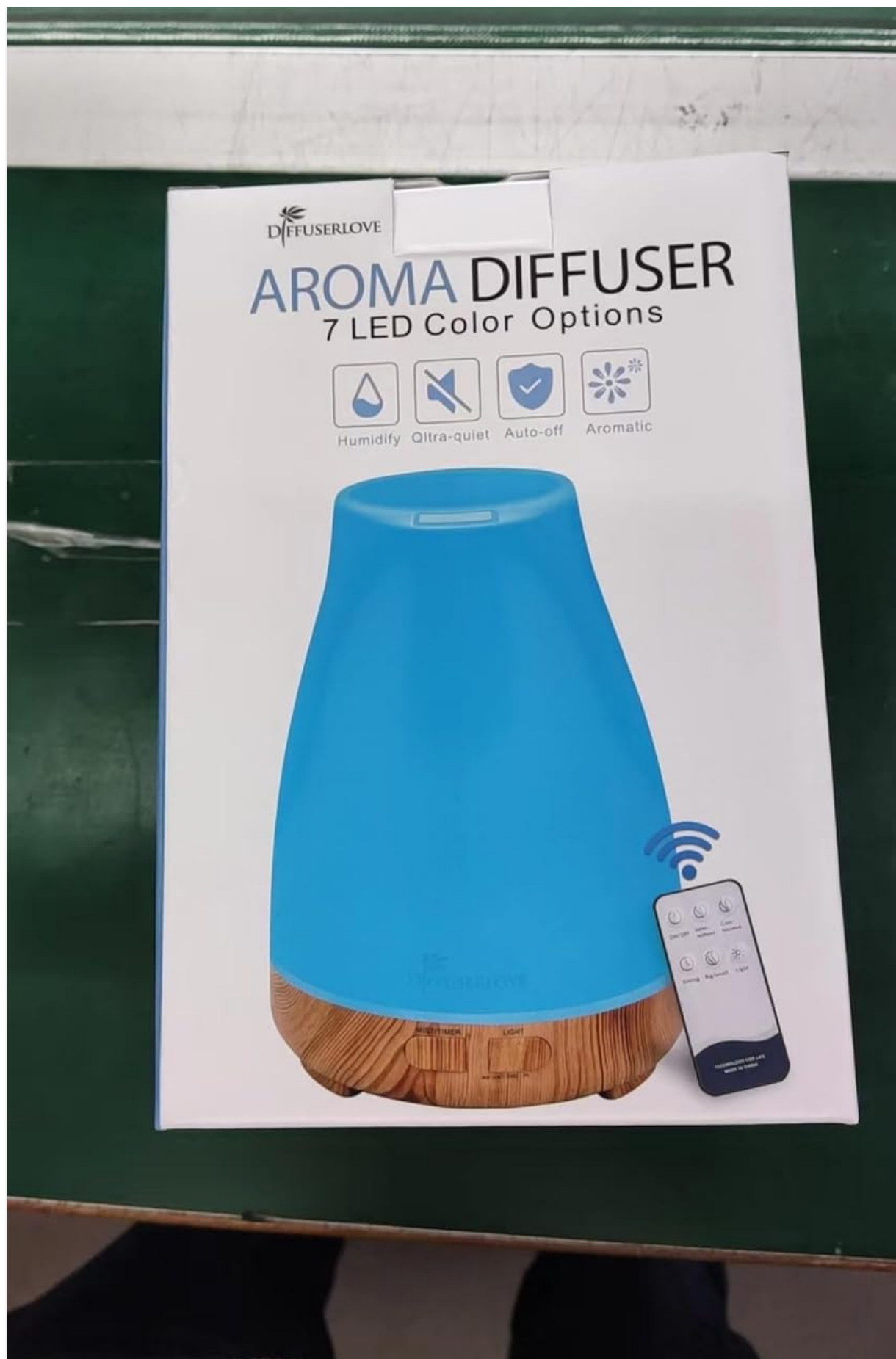
Figure 6.2: The diffuser and its remote control for convenient operation.