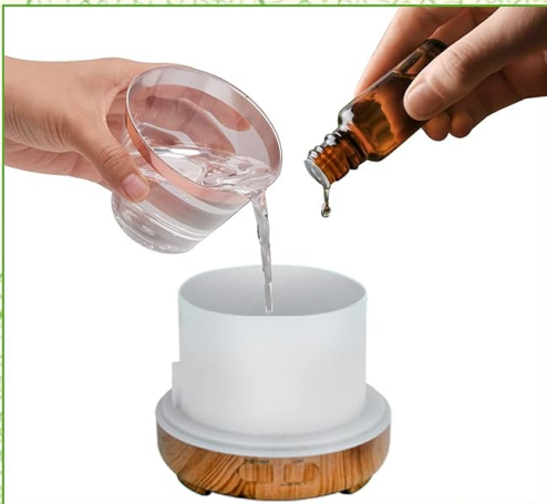
3. Add water and essential oils