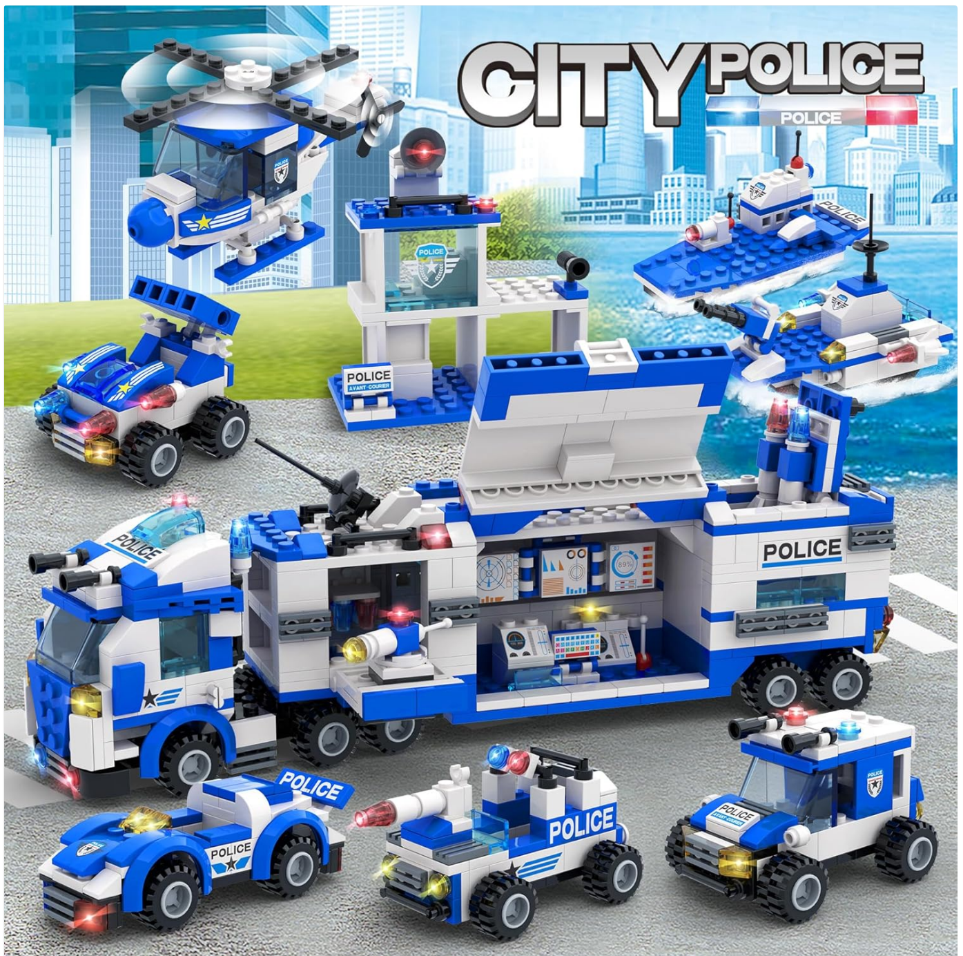
Image: The complete EP EXERCISE N PLAY City Police Building Set, showcasing the mobile command center truck, police station, helicopter, and several smaller police vehicles.