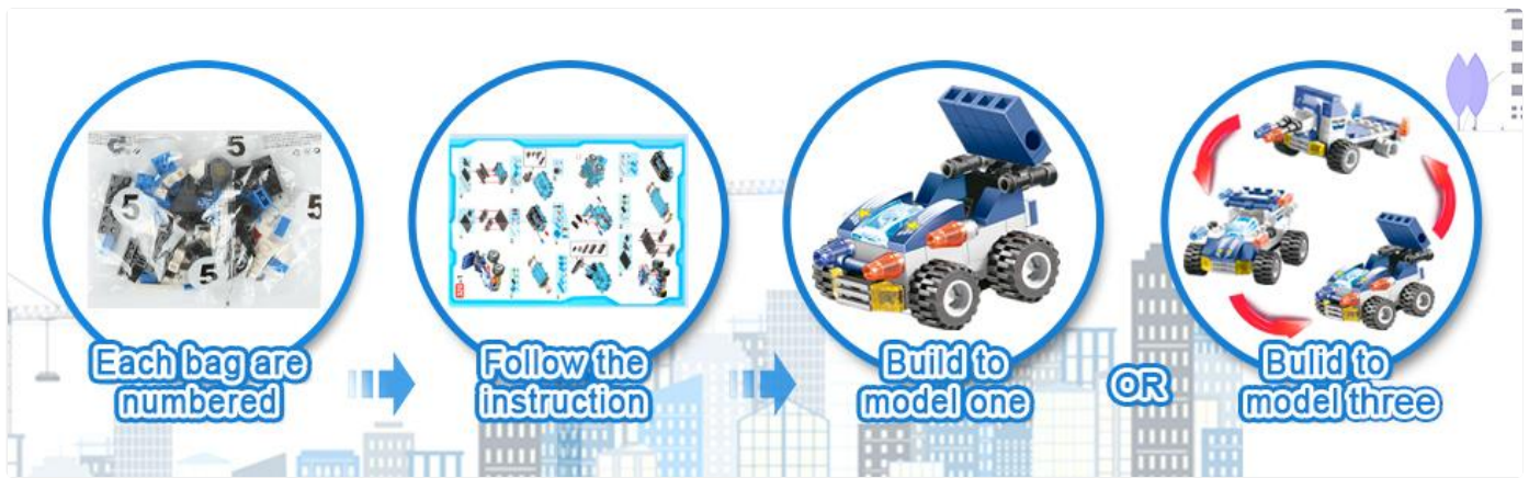
Image: An example of the assembly process, illustrating numbered bags, instruction following, and the ability to build different models from the same set of pieces.