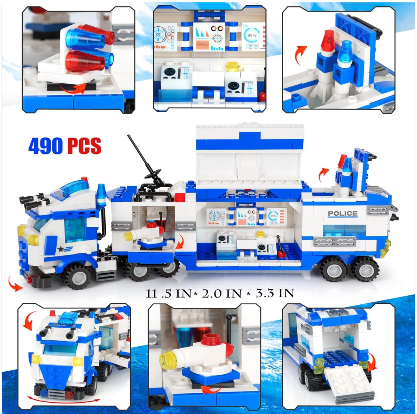
Image: Detailed view of the Mobile Command Center Truck, highlighting its various functional areas and accessories.

Your browser does not support the video tag.