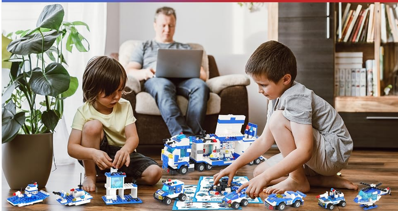
Image: Two children engaged in imaginative play with the assembled police building set, demonstrating interaction with the models.