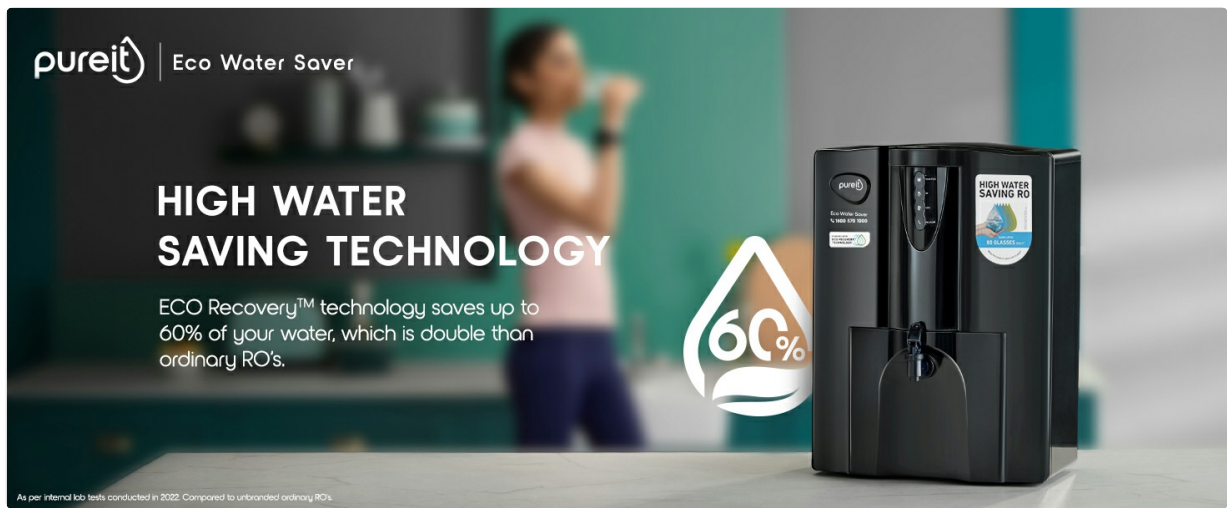
Image 1.2: Visual representation of the 60% water saving technology integrated into the purifier.