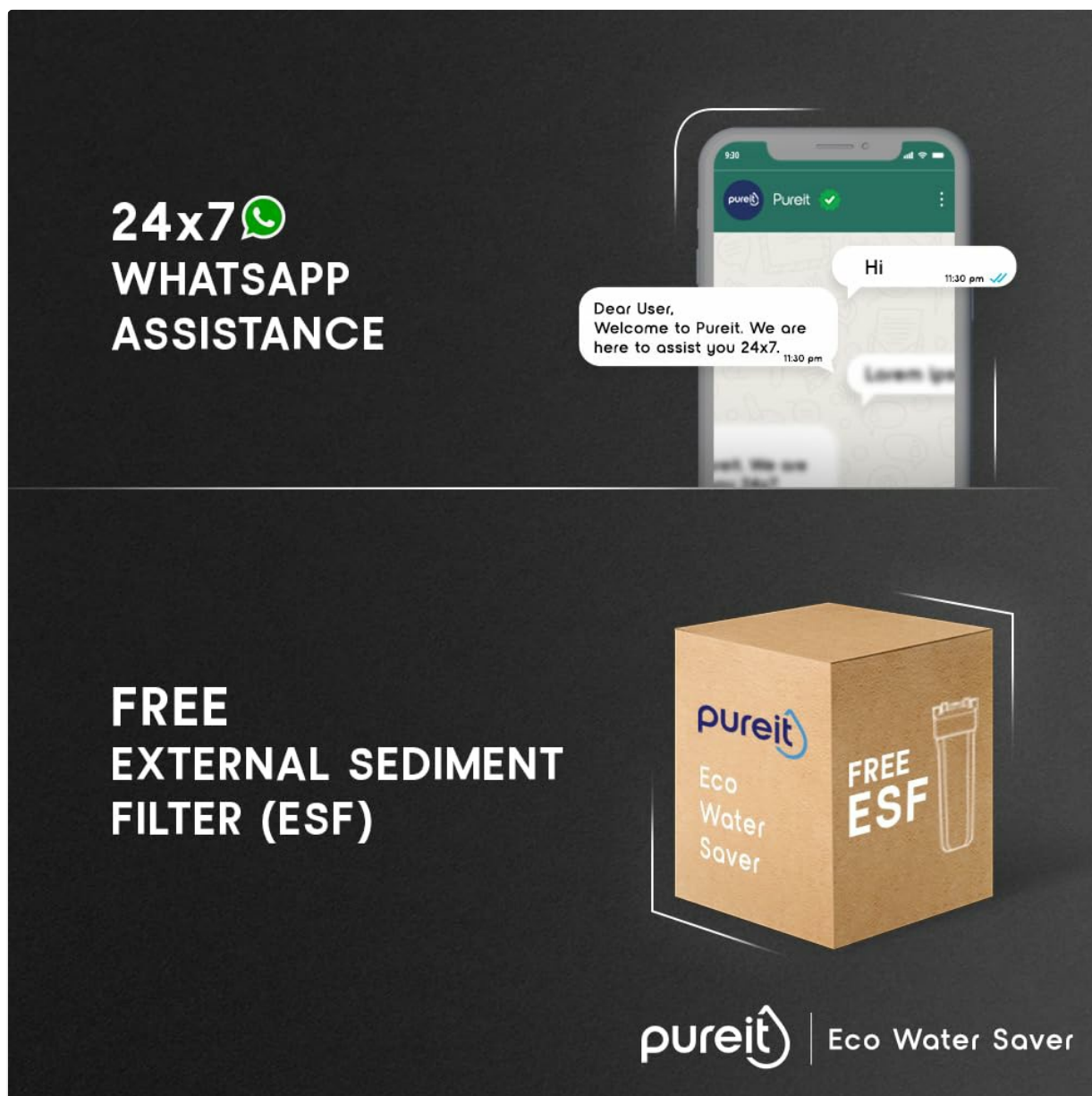
Image 2.1: The Pureit Eco Water Saver unit shown alongside its external sediment filter, included for pre-filtration.