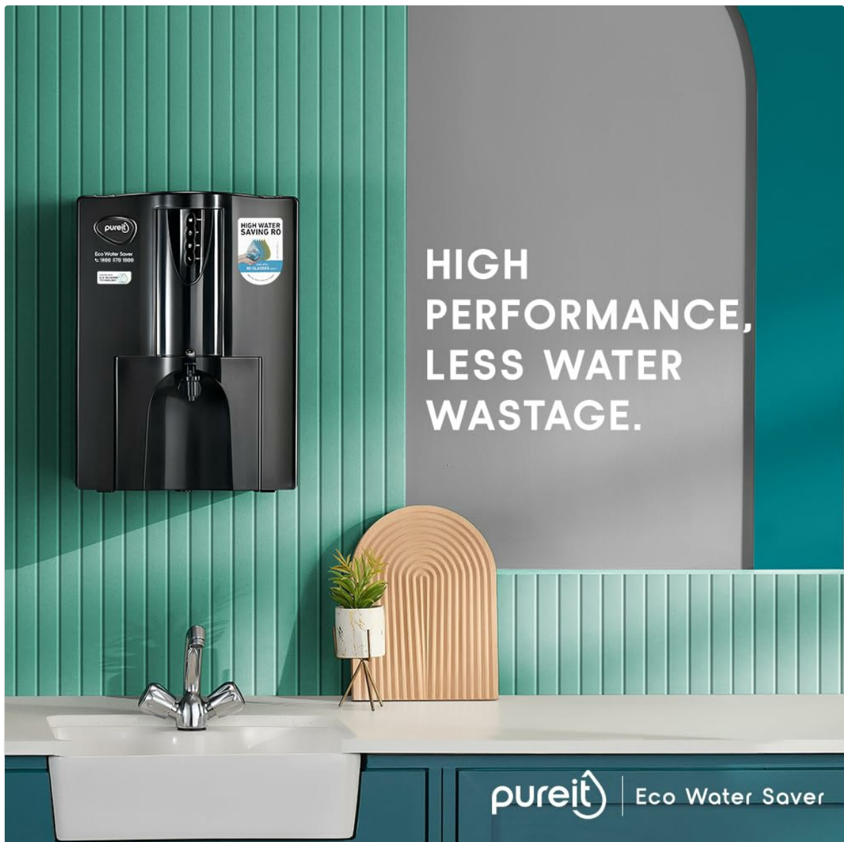
Image 1.1: Pureit Eco Water Saver water purifier, showcasing its sleek design and wall-mounted installation.