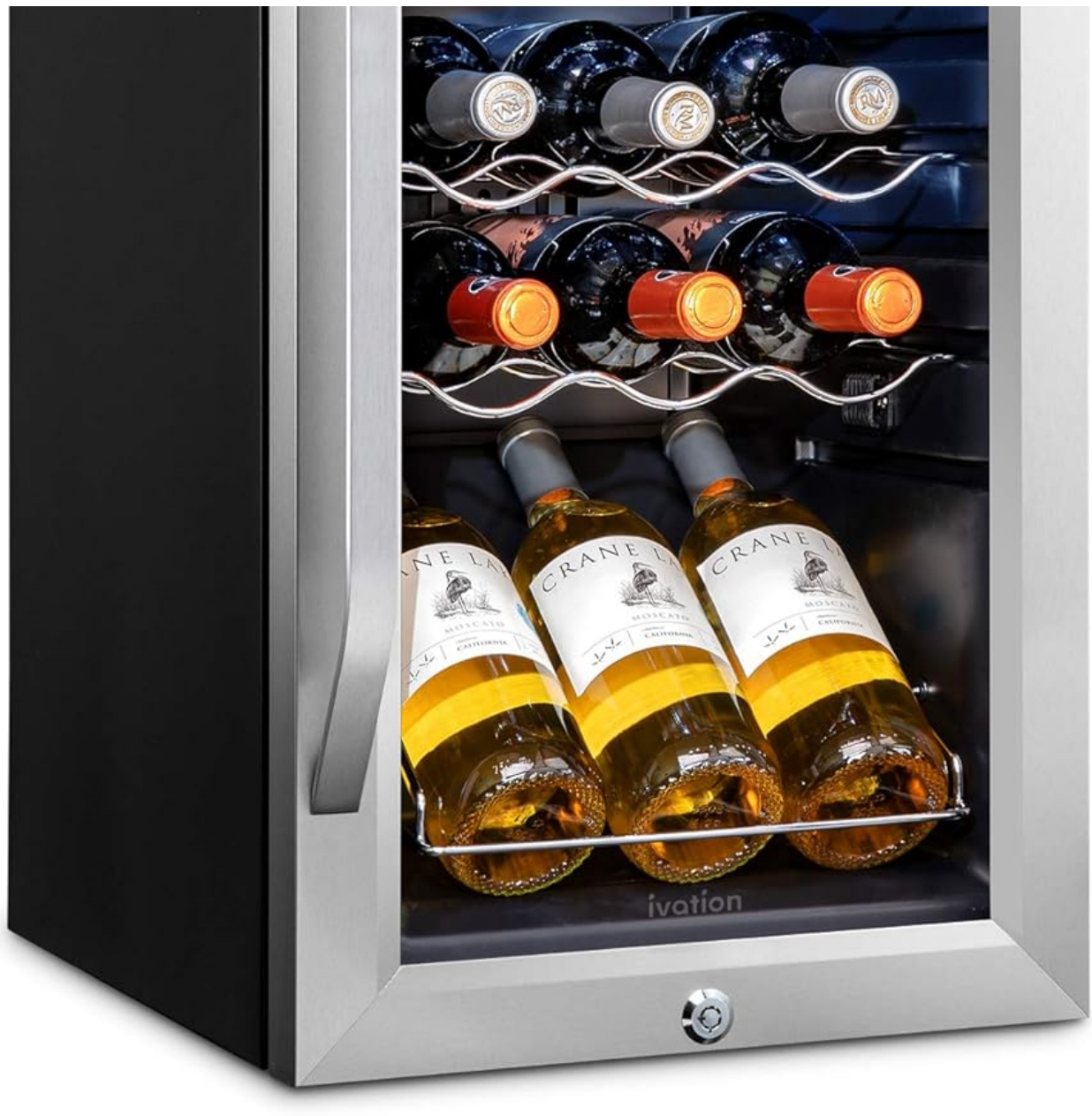
Front view of the Ivation 18 Bottle Compressor Wine Cooler Refrigerator, showcasing its stainless steel finish and glass door filled with wine bottles.