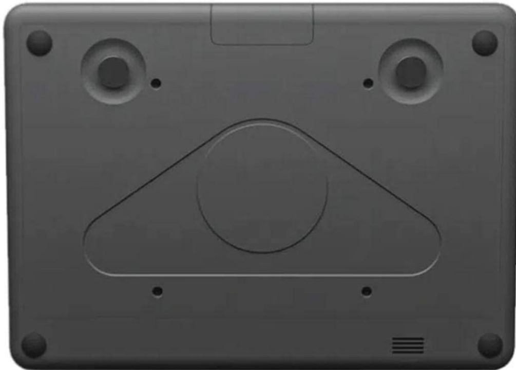
Image: Bottom view of the Logitech Tap Touch Controller, showing rubber feet for stability and potential mounting points.