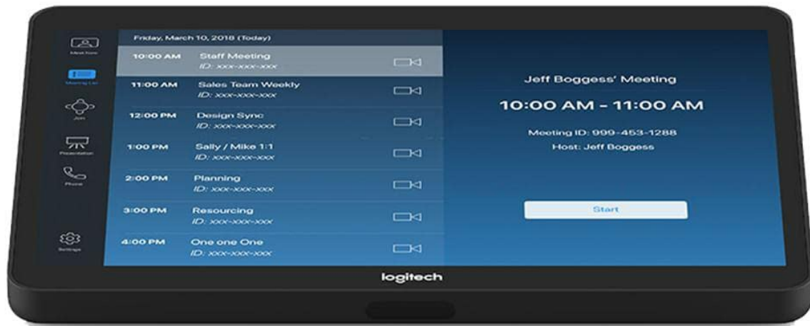
Image: Front view of the Logitech Tap Touch Controller displaying a meeting schedule interface.