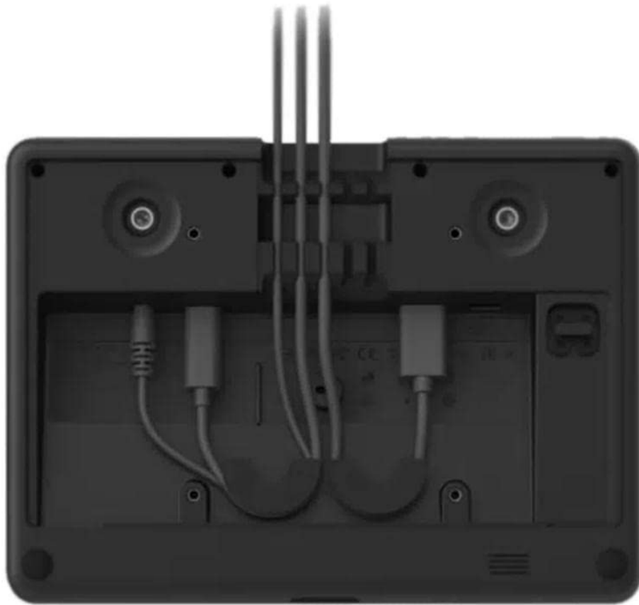
Image: Underside of the Logitech Tap Touch Controller, illustrating the cable management system and various connection ports.