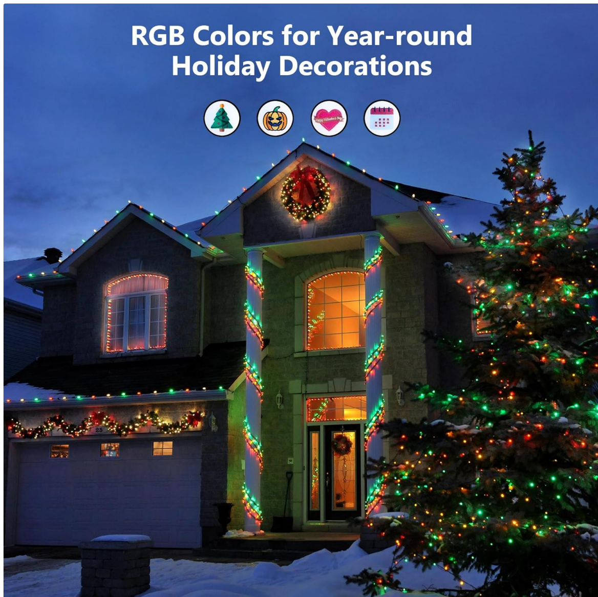
Image: A house exterior adorned with Brizled RGB string lights displaying a mix of red, green, and white colors, suitable for year-round holiday decorations.