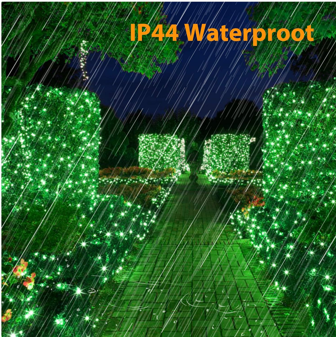
Image: Green Brizled string lights draped over garden bushes, shown during a light rain, highlighting their IP44 water-resistant design for outdoor use.