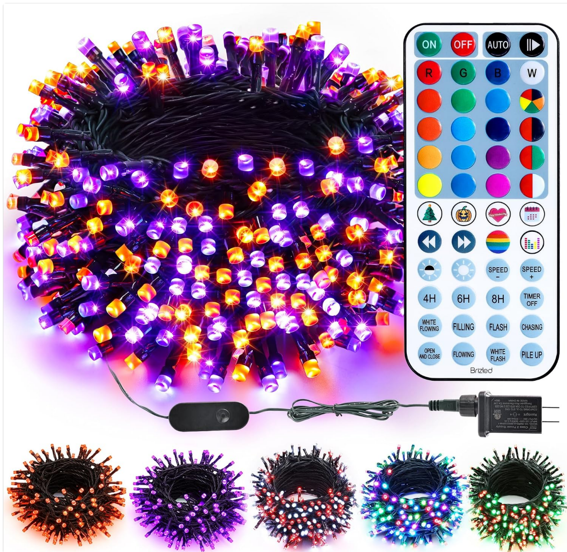
Image: The Brizled 200 LED RGB string lights coiled, alongside the 48-key remote control and the power adapter.