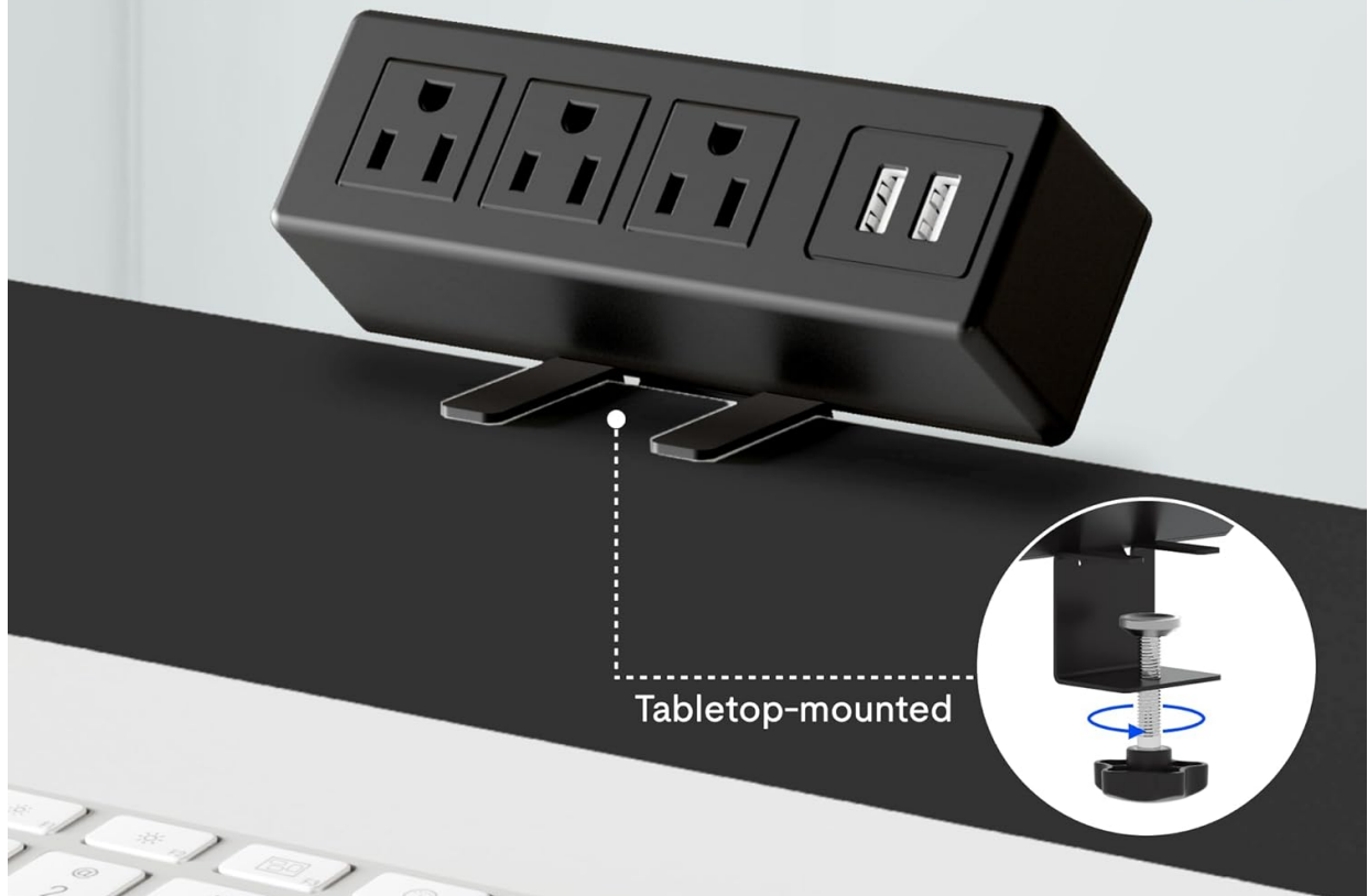
Image: A detailed shot of the removable desktop power outlet, showing its three AC outlets and two USB ports, designed to clamp onto the desk edge.