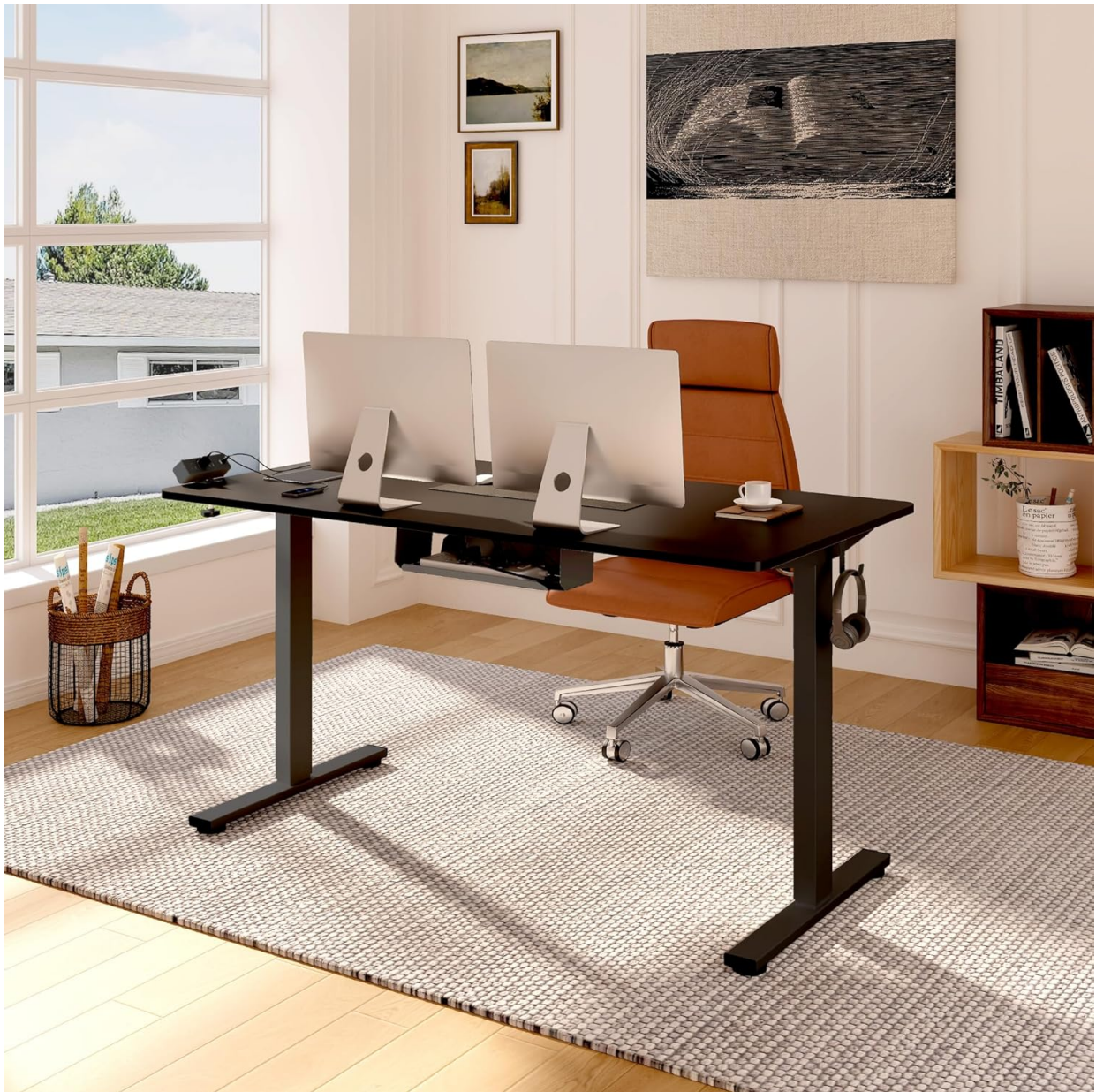
Image: The FLEXISPOT EN2 Electric Standing Desk in a home office, showcasing its spacious black tabletop and black frame. Two computer monitors are set up on the desk, with a chair positioned for sitting. A water cooler is visible to the left.