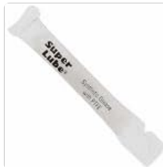
Image: A small packet of synthetic grease, which can be used to lubricate stiff lock mechanisms for smoother key operation.