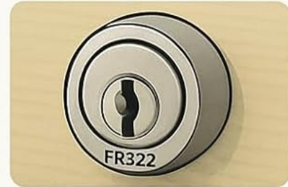
On the Lock Face