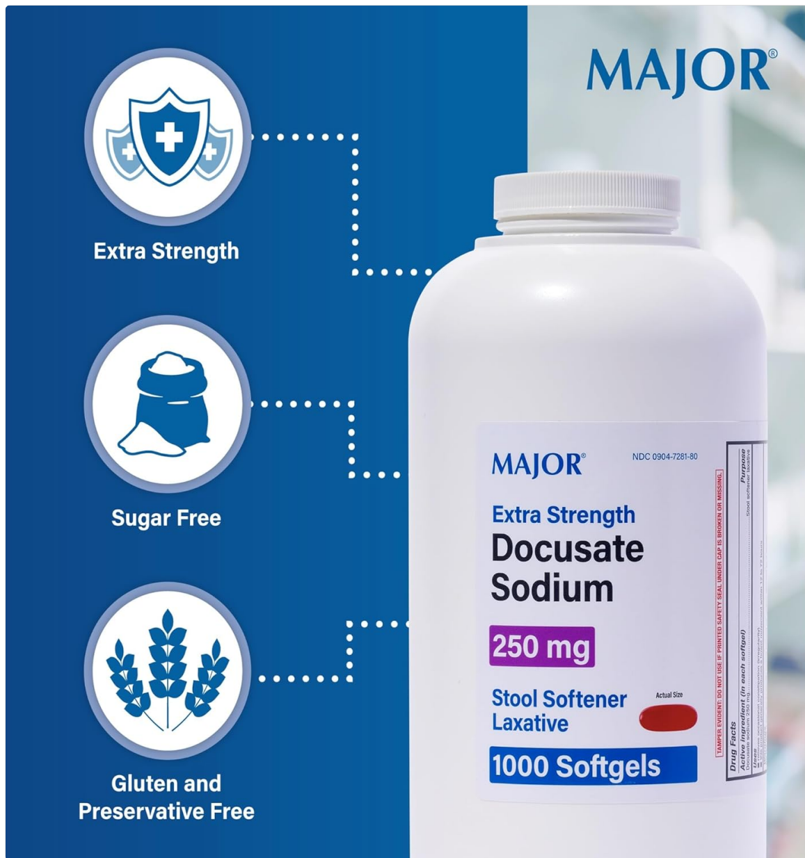
Image: Product features highlighting Extra Strength, Sugar Free, and Gluten and Preservative Free.