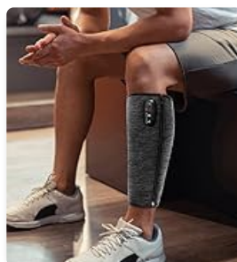
Image: Step-by-step guide for wearing the massager: 1. Controller outward, wrap with controller facing the outer side of your calf. 2. Gentle Velcro fit, don't fasten too tightly on first use. 3. Power on & Adjust, slightly

Image: A person wearing the CINCOS calf massager wraps on both calves, demonstrating proper placement.