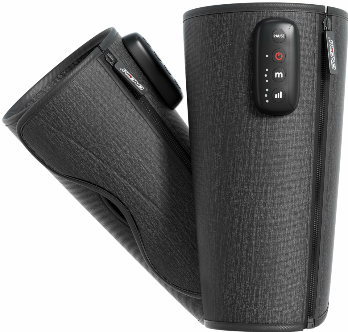
Image: CINCORM Cordless Calf Massager, highlighting its compact and portable design.