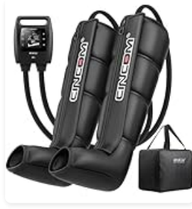
Image: All items included in the CINCOM Cordless Calf Massager package.