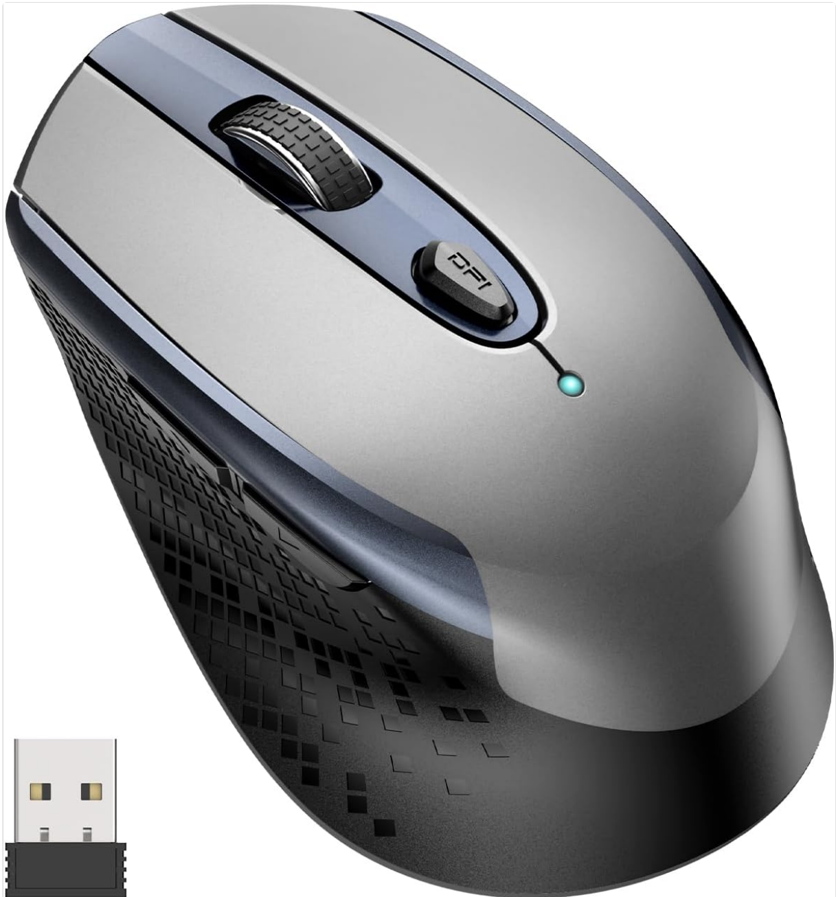
Image: The cimotech Wireless Mouse TM004 in grey, shown with its compact USB receiver.