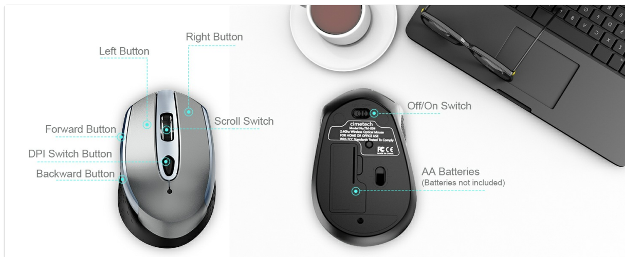
Image: The bottom of the mouse, indicating the battery compartment, USB receiver storage, and the power switch.