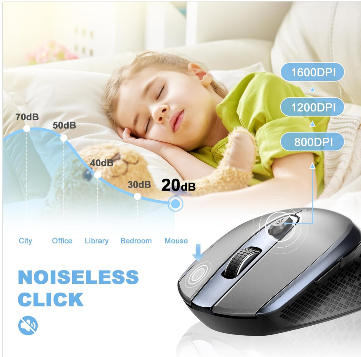
Image: The mouse highlighting its DPI adjustment button and the silent click feature, with DPI levels of 800, 1200, and 1600.