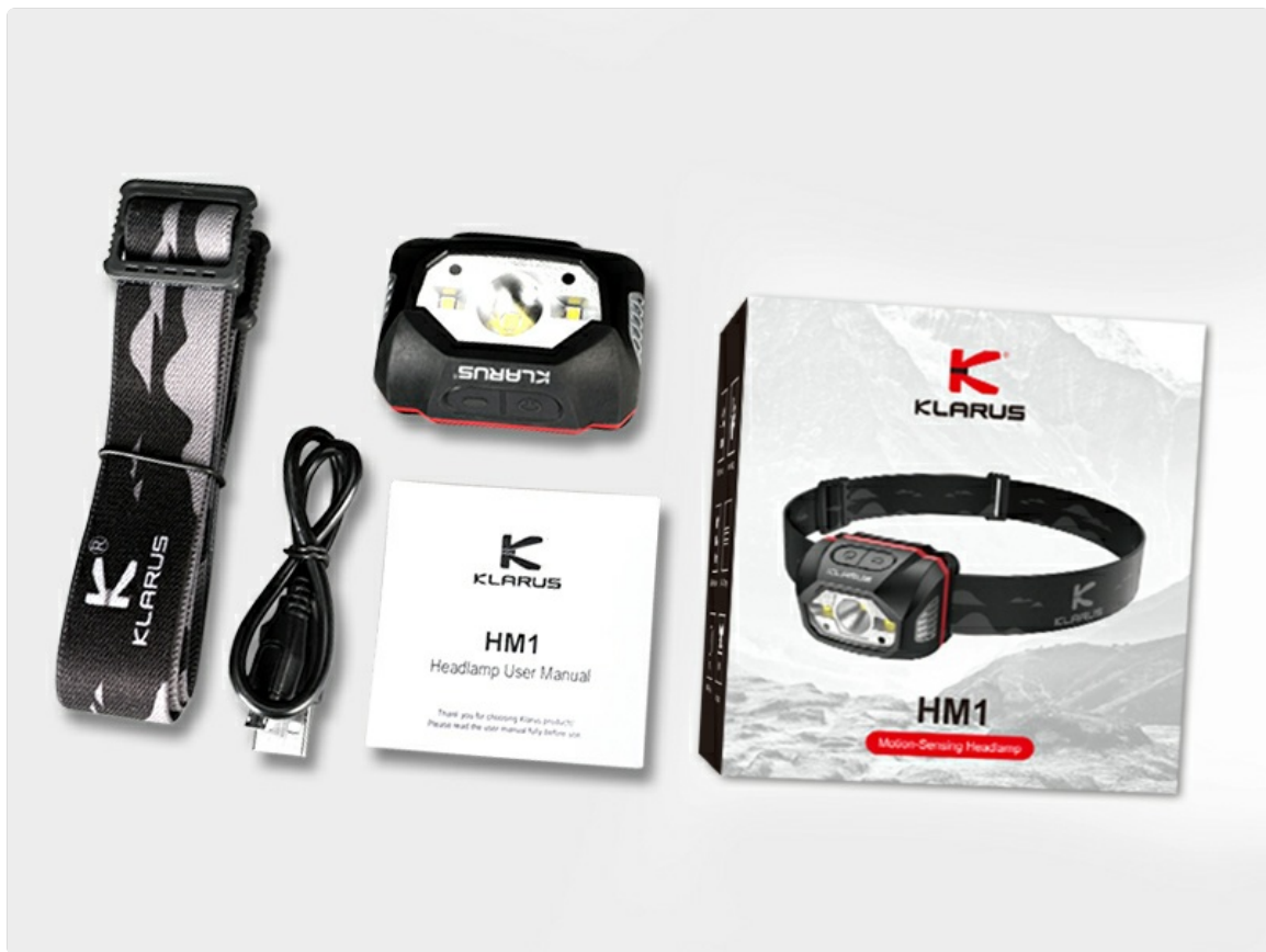
Figure 6: The Klarus HM1 headlamp package contents, including the headlamp unit, user manual, charging cable, and spare headband.

For warranty claims or technical support, please refer to the contact information provided in your product packaging or visit the official Klarus website.