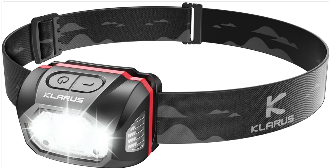
Figure 1: Klarus HM1 Headlamp, showcasing its compact design and integrated strap.

The Klarus HM1 is a versatile and durable headlamp designed for various outdoor activities and professional applications. It features a powerful 440-lumen output, extended battery life, and smart control options, including a motion sensor for hands-free operation. Built with military-grade durability, it is IPX6 waterproof and highly resistant to shocks and drops, ensuring reliable performance in challenging environments.