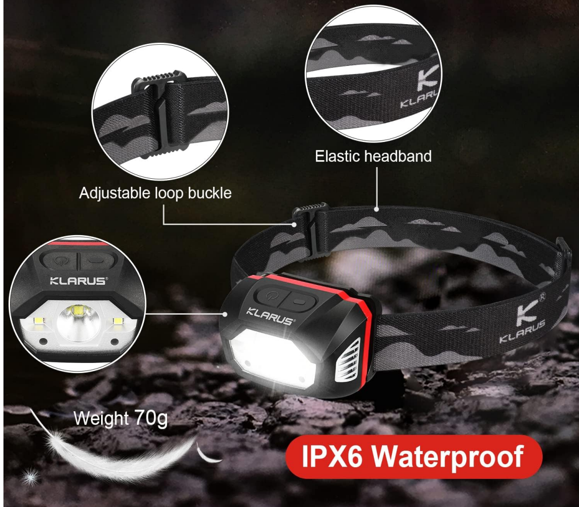
Figure 3: The lightweight design of the Klarus HM1, highlighting the adjustable loop buckle and elastic headband for comfortable wear.