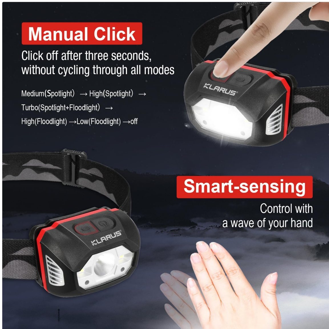
Figure 4: Illustration of the manual click operation and the smart-sensing feature for hands-free control of the Klarus HM1 headlamp.