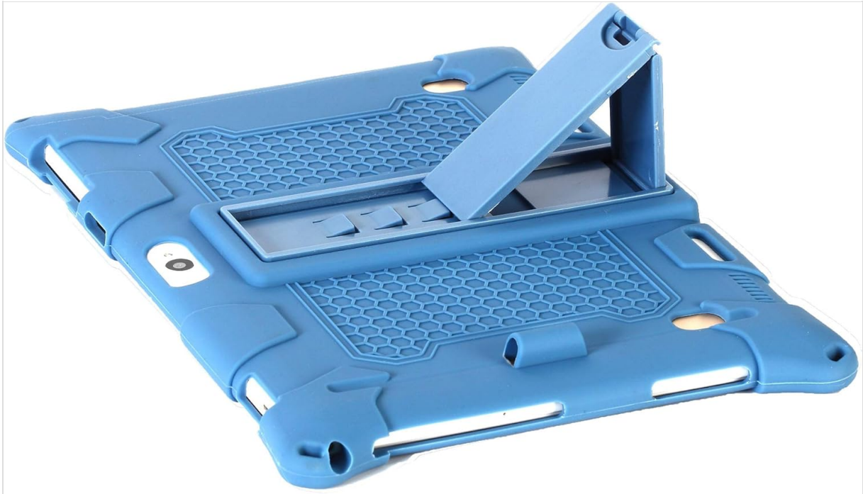
Image 5.1: The integrated kickstand provides stable support for your tablet in landscape orientation.