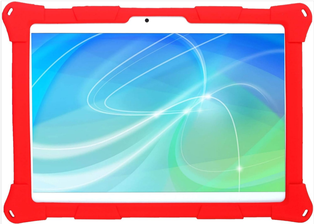
Image 4.2: Front view of the tablet correctly installed in the silicone case, showing screen visibility.