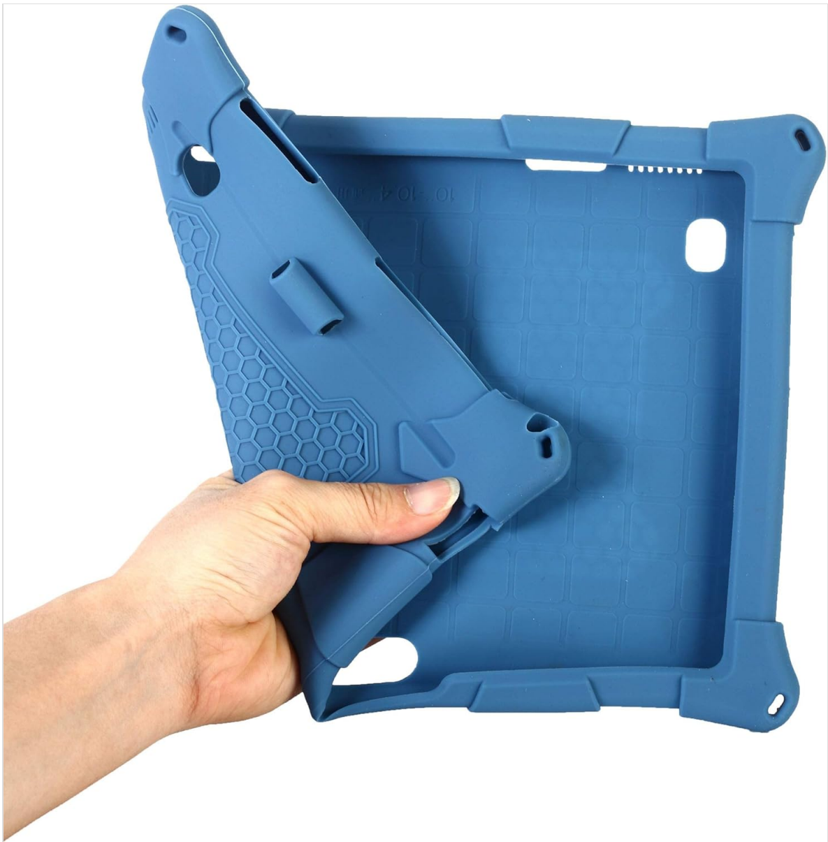
Image 4.1: The flexible silicone material allows for easy installation and removal of your tablet.