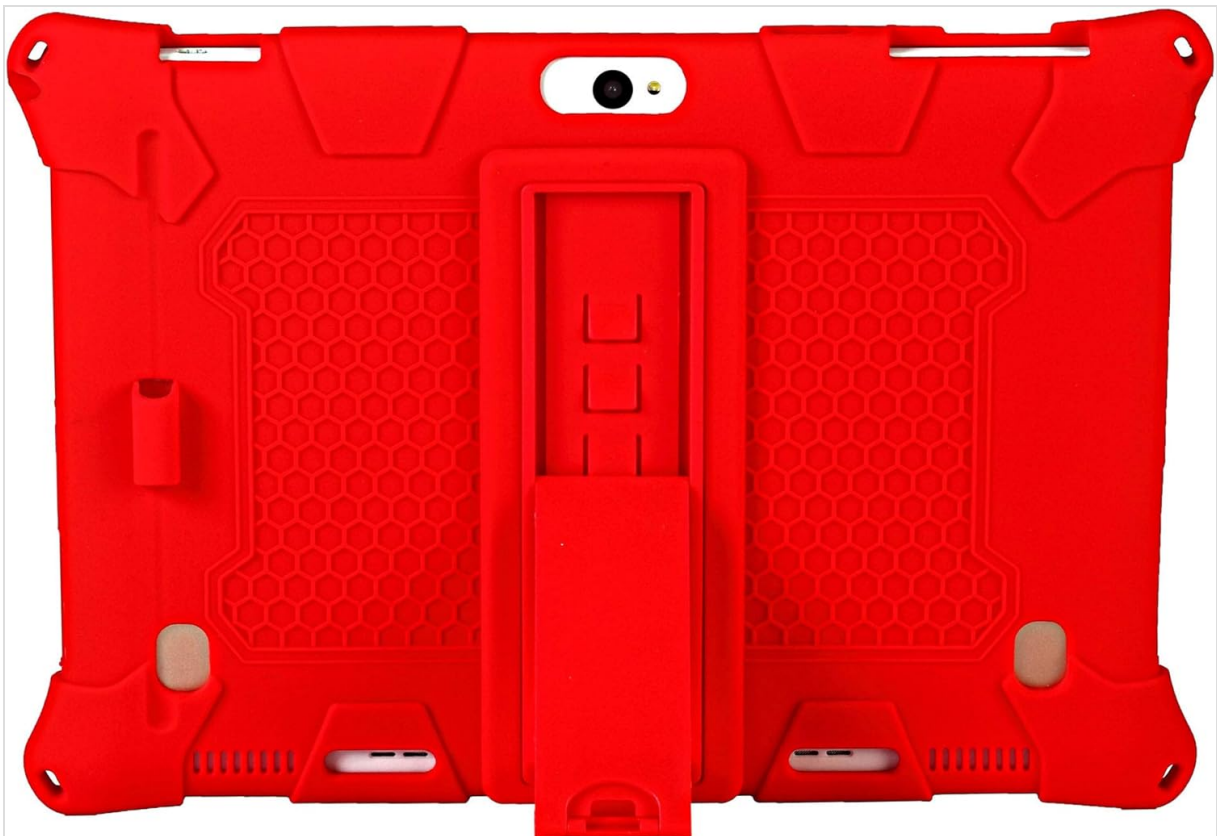
Image 4.3: Back view of the tablet in the case, illustrating proper alignment of the camera and the kickstand mechanism.