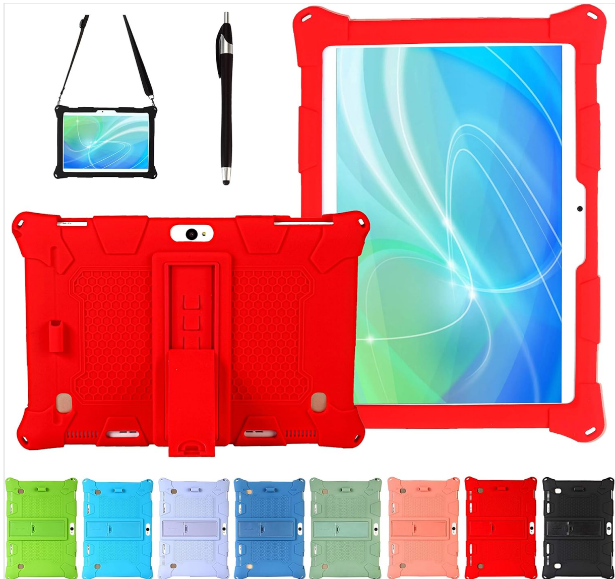
Image 3.1: The complete AKNICI Silicone Case package, including the case, shoulder strap, and stylus.