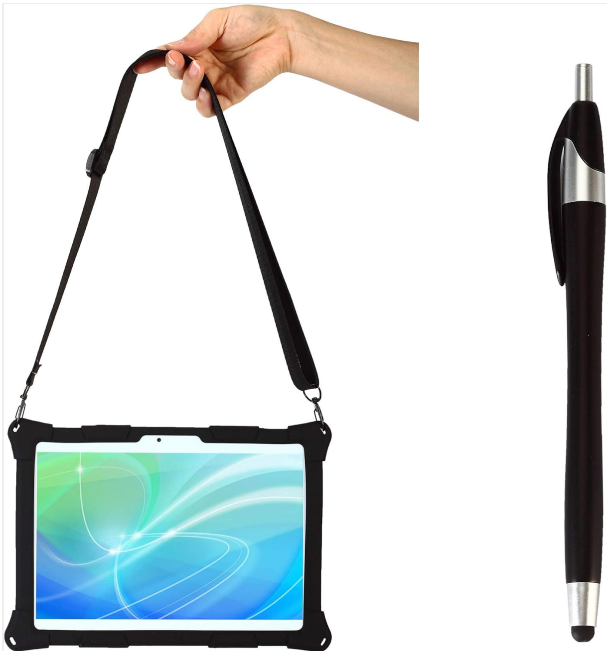
Image 5.2: The adjustable shoulder strap allows for easy and secure transport of your tablet.