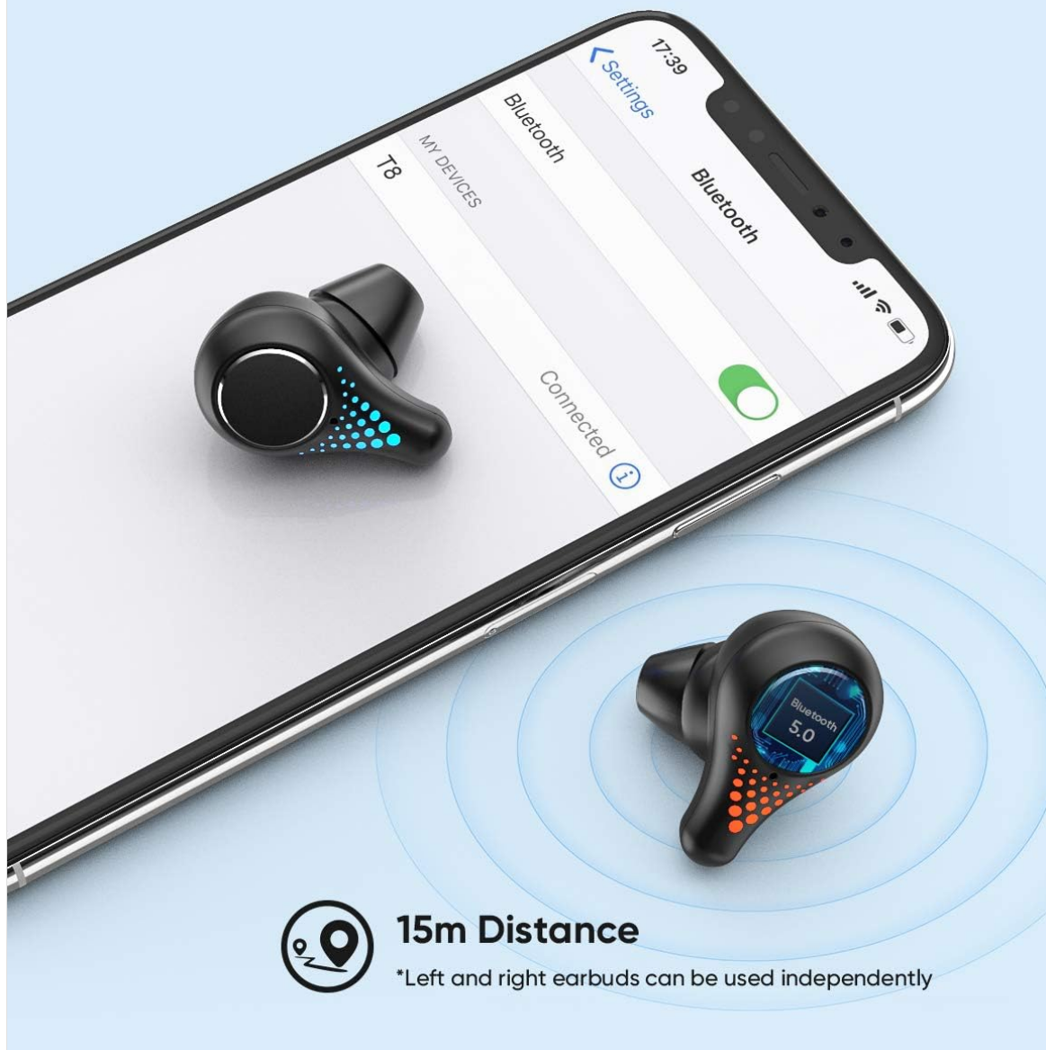
Image: A smartphone displaying a successful Bluetooth connection to the T8 earbuds, indicating a strong and stable connection.

Bluetooth 5.0 creates an unbreakable connection