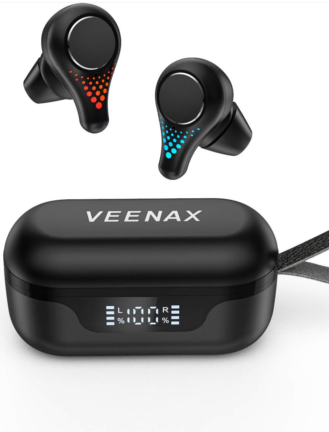
Image: VEENAX T8 Bluetooth In-Ear Headphones with their charging case.