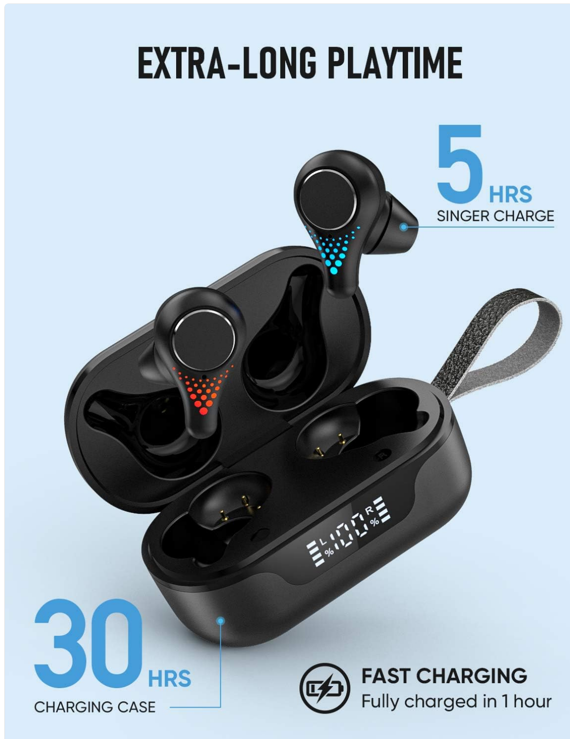
Image: VEENAX T8 earbuds inside their charging case, illustrating the battery life and charging capabilities.