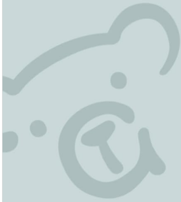
Figure 9: Warranty and Quality Commitment