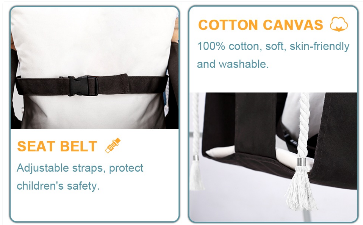
Figure 6: Cotton Canvas Seat and Safety Belt Details