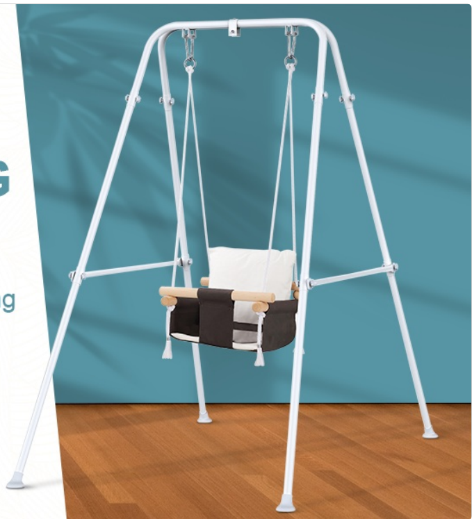
Figure 3: The 2-in-1 Swing and Jumper Configuration