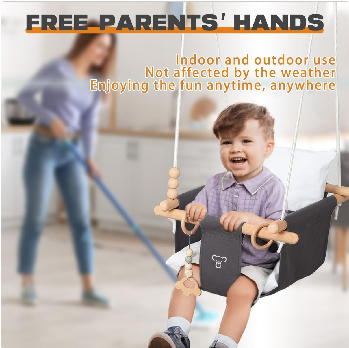
Figure 5: Indoor Use of the Baby Swing

Indoor and outdoor use Not affected by the weather Enjoying the fun anytime, anywhere