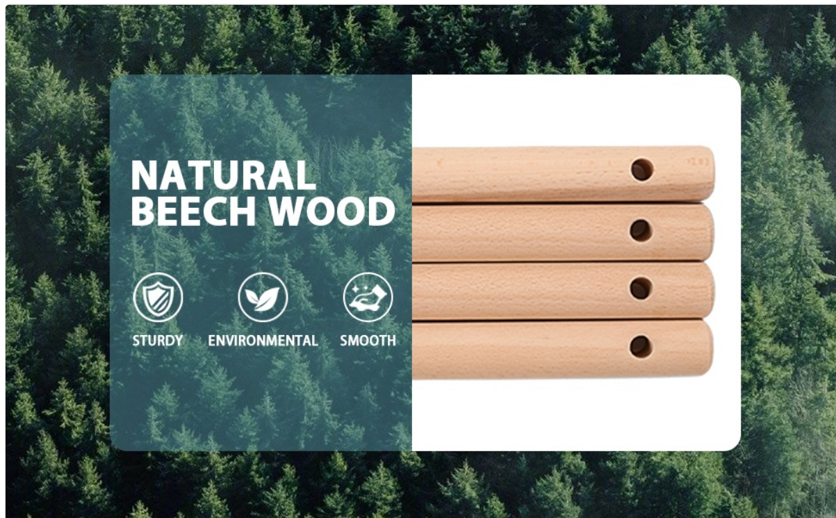
Figure 7: Natural Beech Wood Components