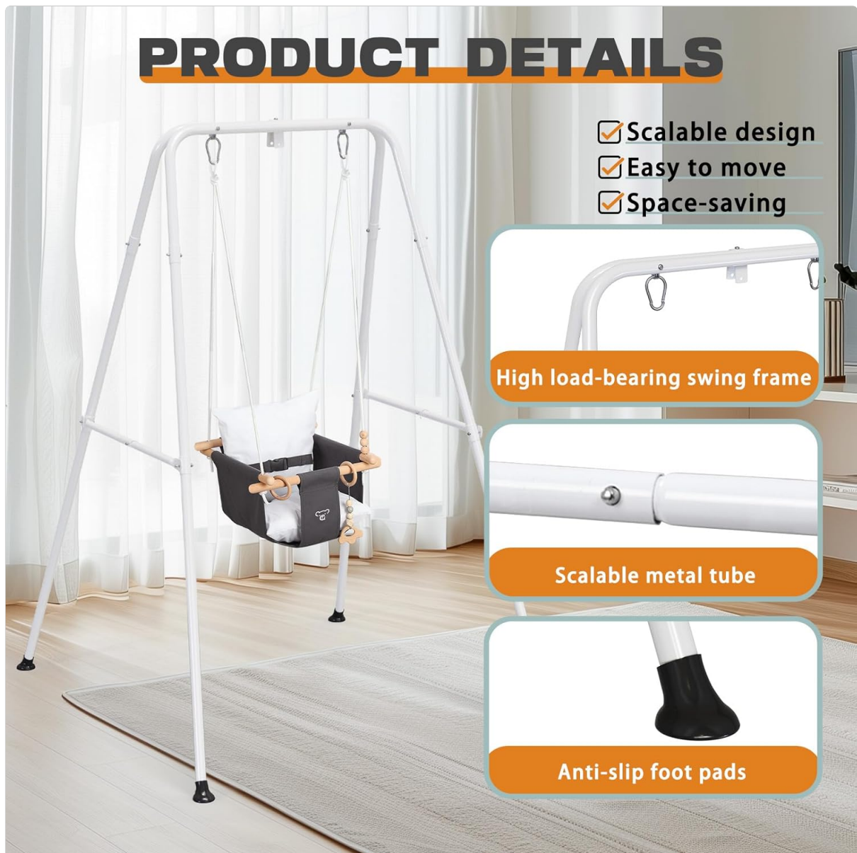
Figure 1: Frame Components and Features