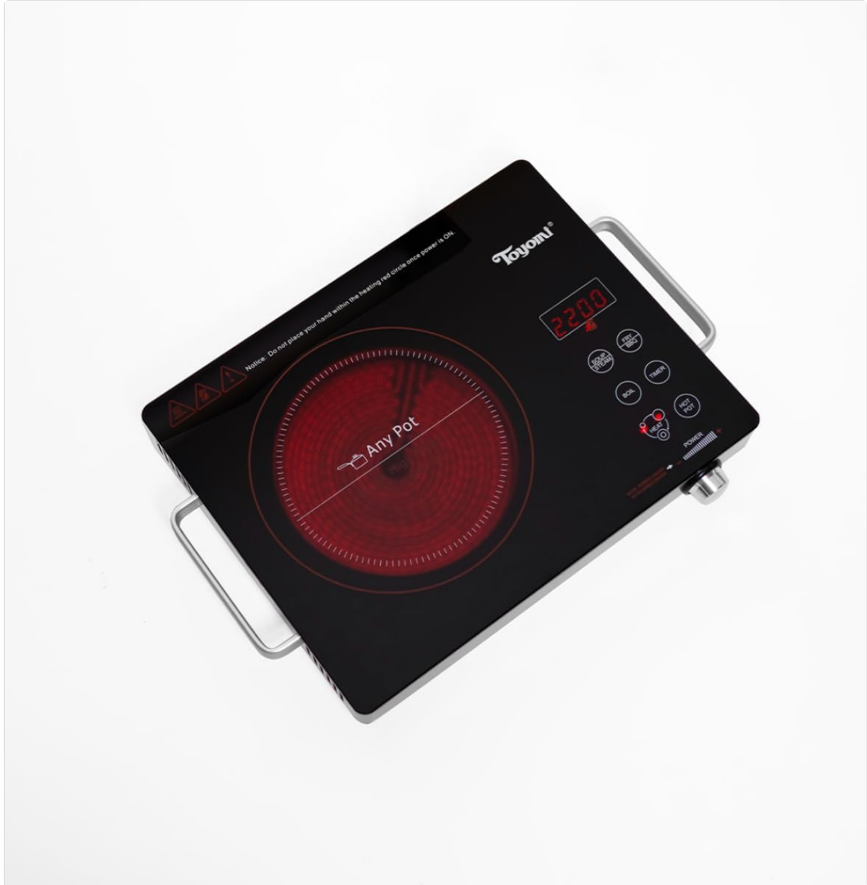
Figure 3: Top view of the cooker, highlighting the heating zone and control layout.

The Toyomi IC 9590 offers various cooking modes and precise control for different culinary needs.