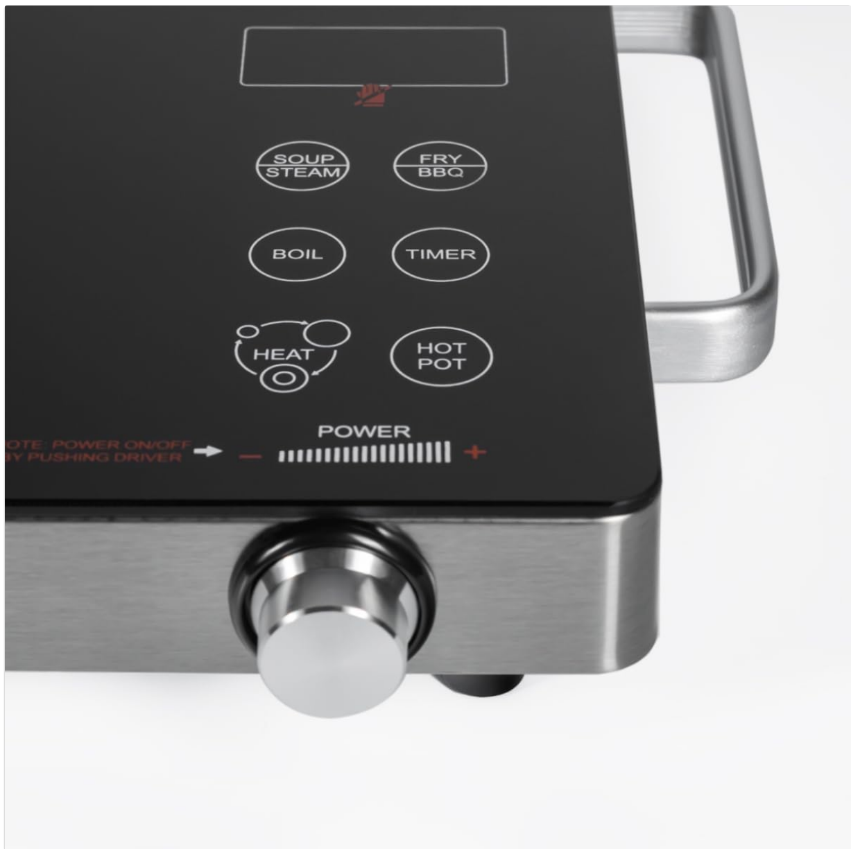
Figure 2: Detailed view of the digital control panel and power knob.