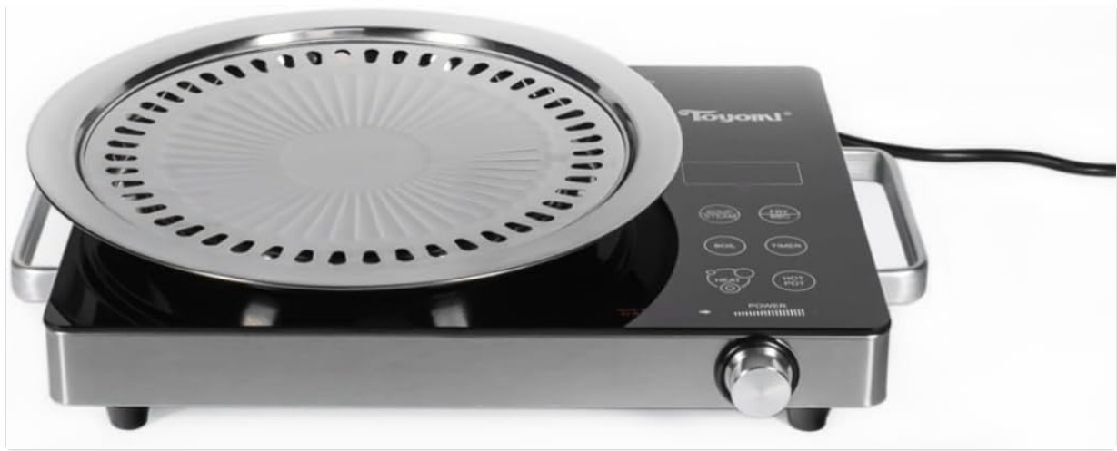
Figure 1: Toyomi IC 9590 Digital Infrared Cooker with included stainless steel grill plate.